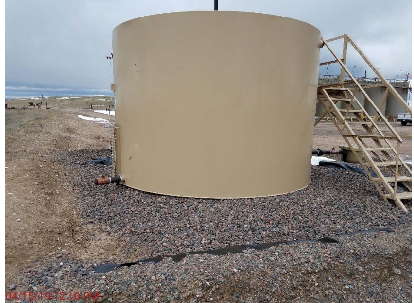
Photo 10 – Unlabeled AST, secondary containment not adequate for tank.