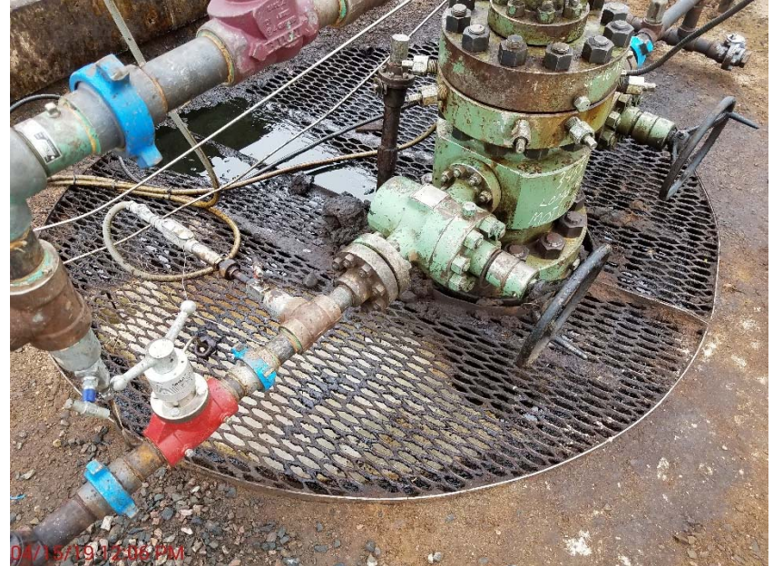
Photo 6 – Leaks around wellhead with cellar full of water and hydrocarbons