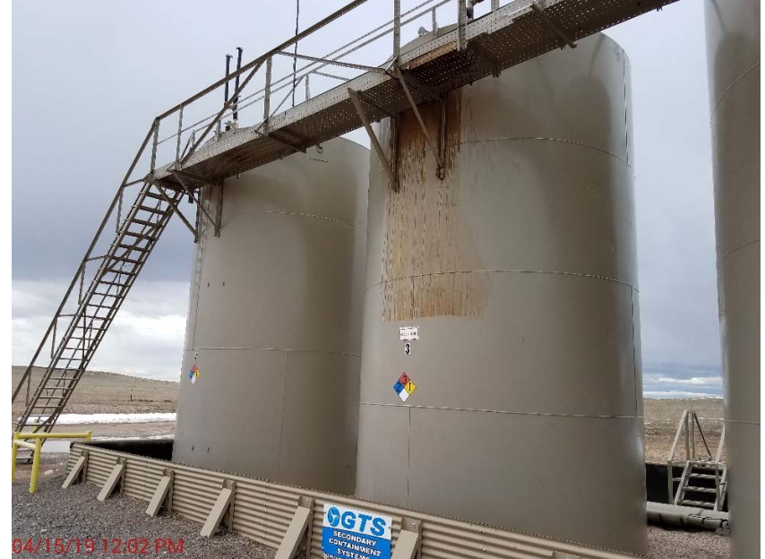
Photo 2 – Thief hatch with previous release and no capacity on crude oil tanks