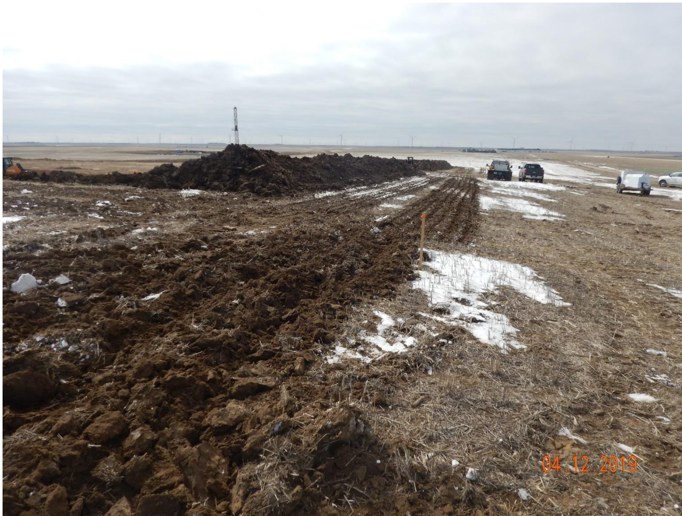
Photo 1: Photo taken from the northwest corner of the disturbance area, facing south. Photo shows construction in process. Photo also shows operator has installed two (2) separate rows of surface roughening along perimeter of the location.