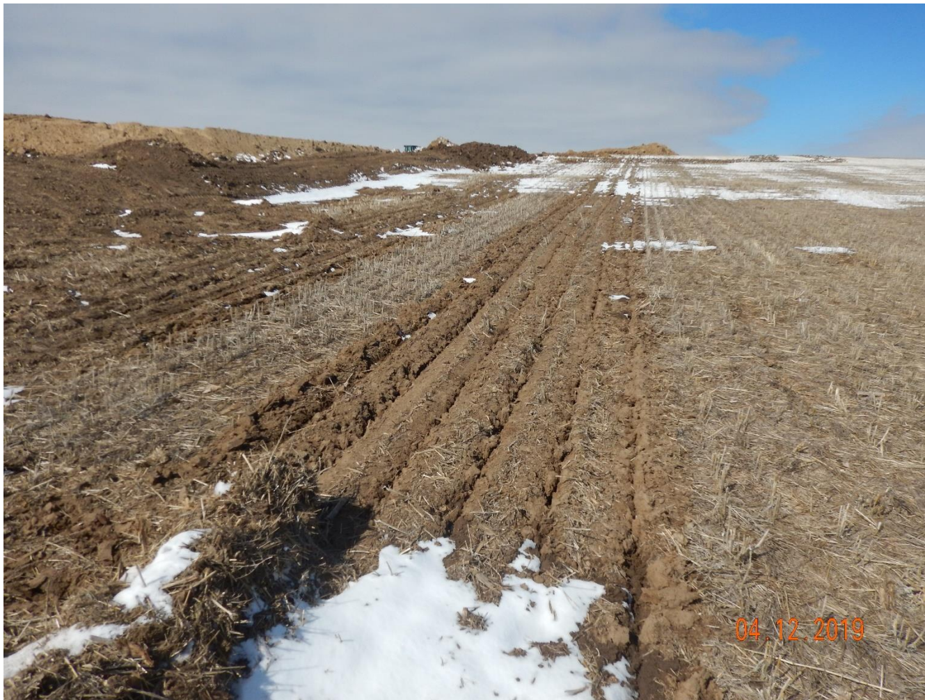
Photo 4: Photos taken from the northwest corner of the disturbance area, facing south. Photo shows area of the location where surface roughening has been installed with the slope, rather than along the contour of the slopes. This is not good engineering practices.