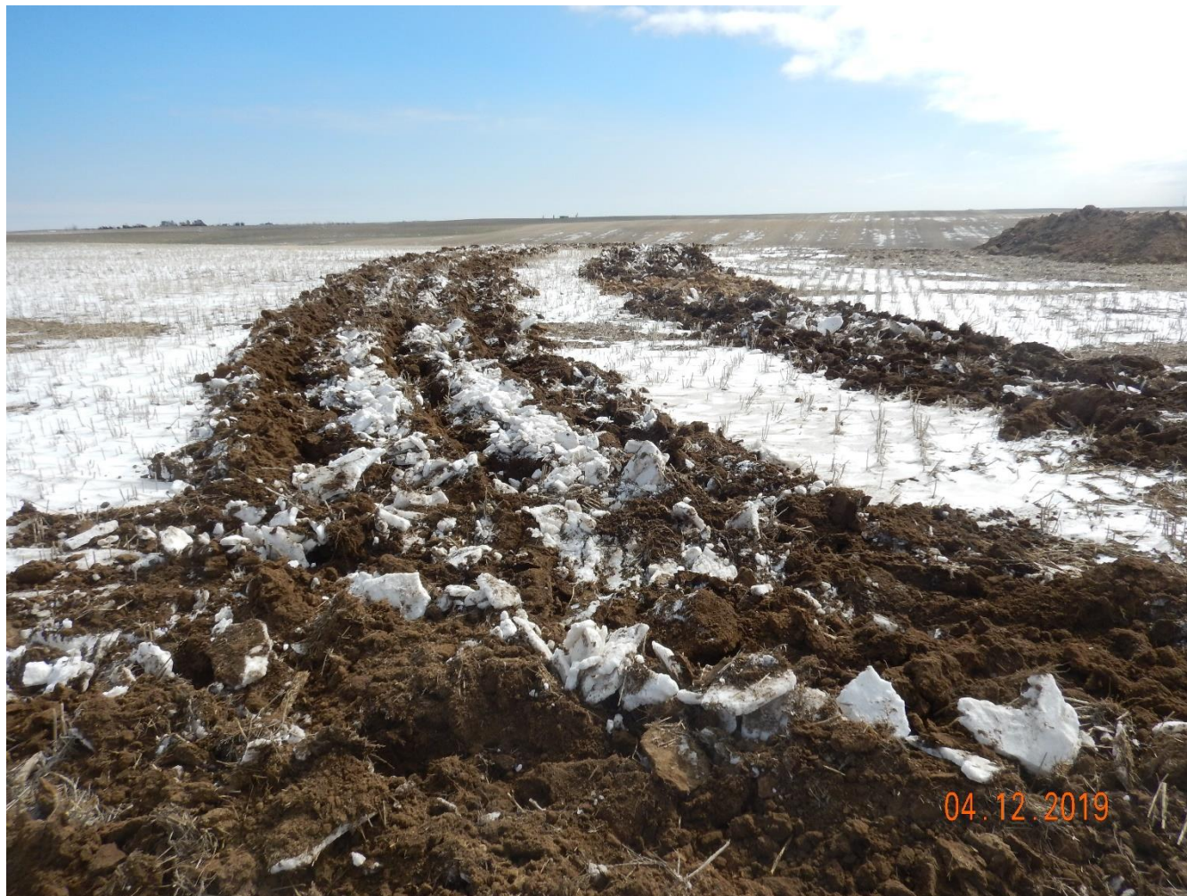
Photo 3: Photo taken from the northwest corner of the disturbance area, facing south. Photo shows construction in process. Photo also shows operator has installed two (2) separate rows of surface roughening along perimeter of the location.