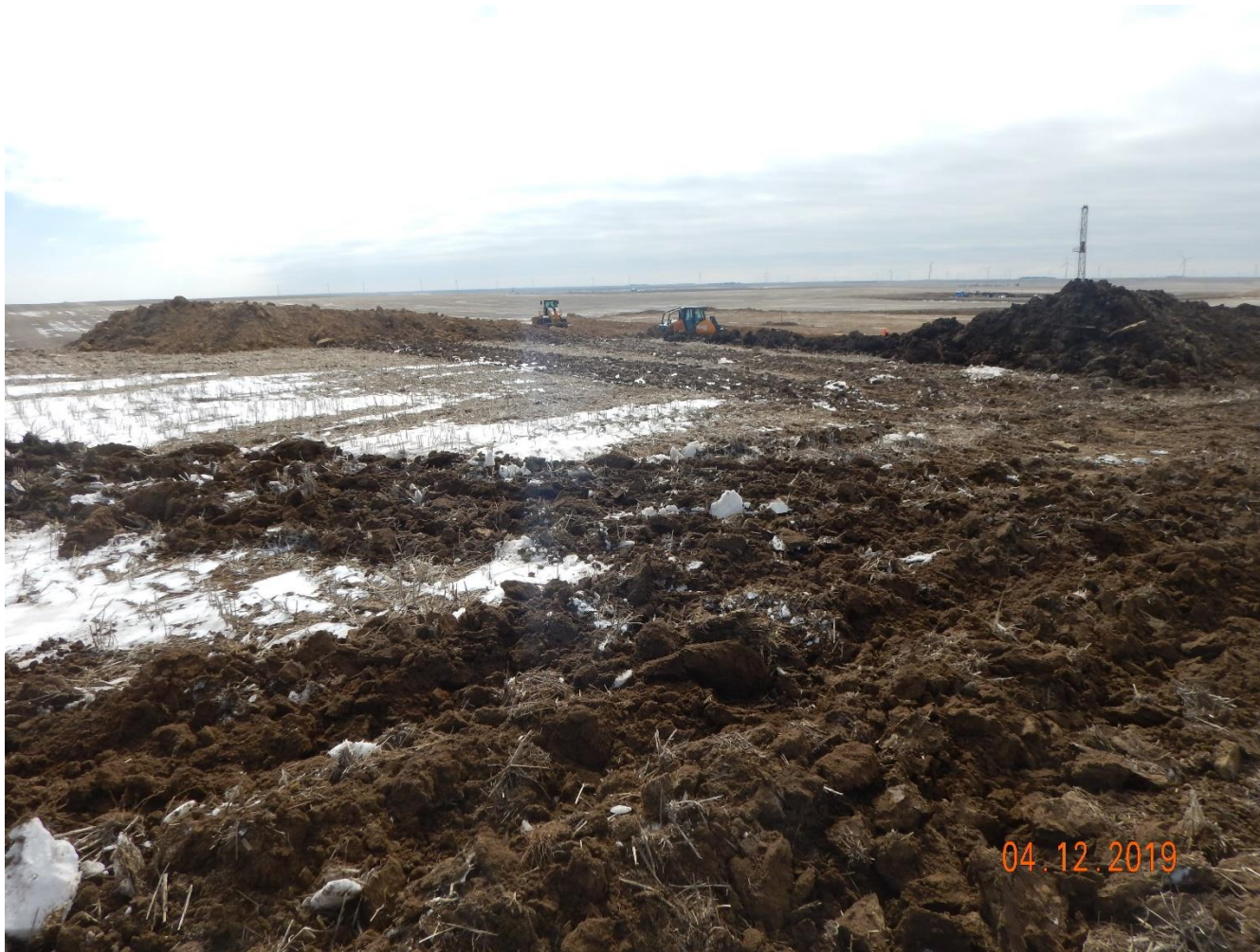
Photo 2: Photo taken from the northwest corner of the disturbance area, facing southeast. Photo shows construction in process. Photo also shows operator has installed two (2) separate rows of surface roughening along perimeter of the location.