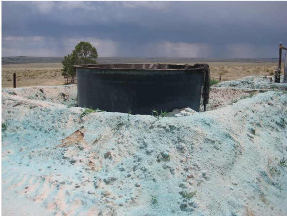
Photo 3. Fiberglass tank and berm