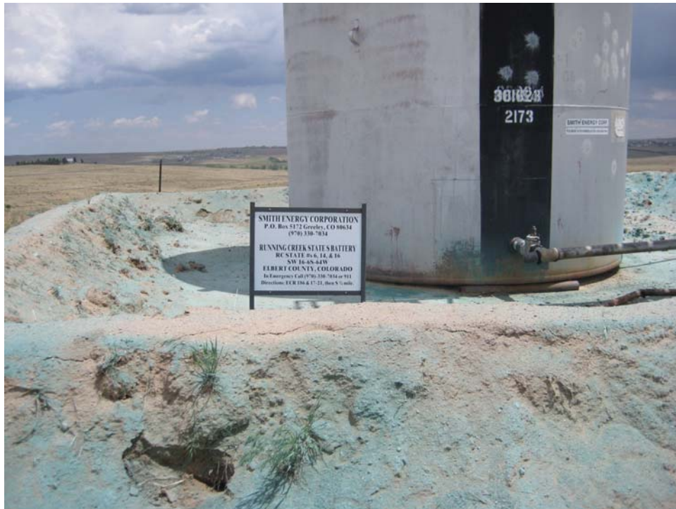
Photo 1. Tank battery sign