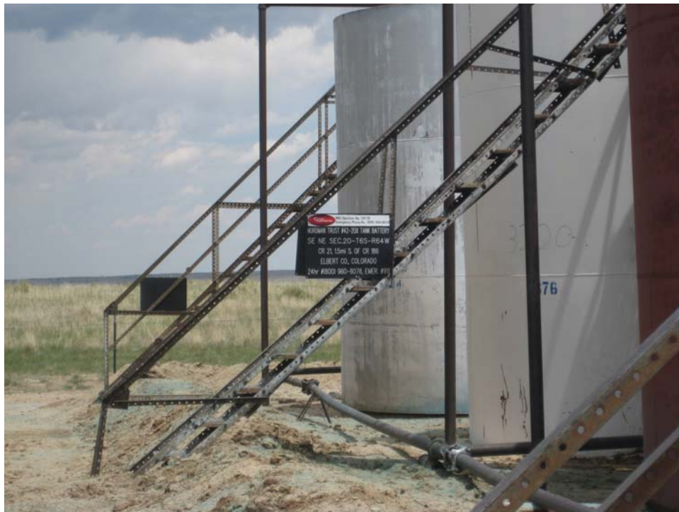
Photo 3. Battery tanks and lease signs