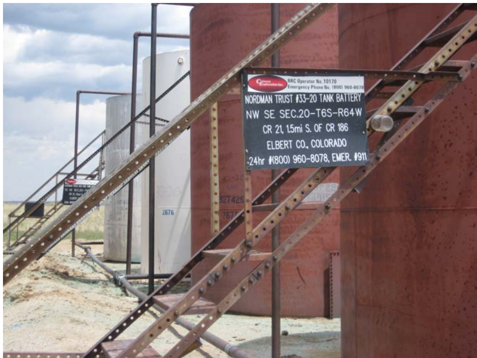
Photo 2. Battery tanks and lease signs