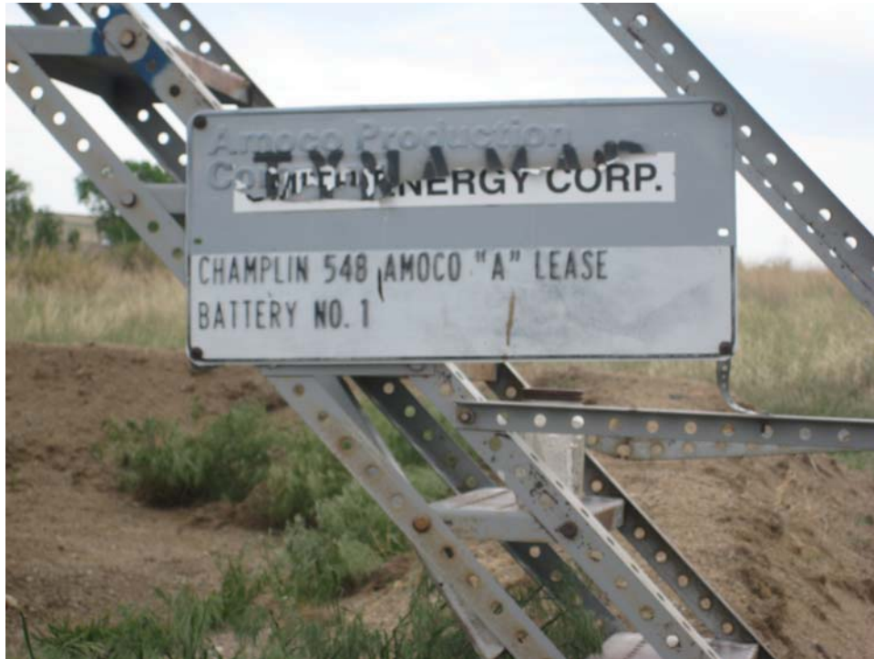
Photo 1. Champlin 548 1 & 2 battery tank sign