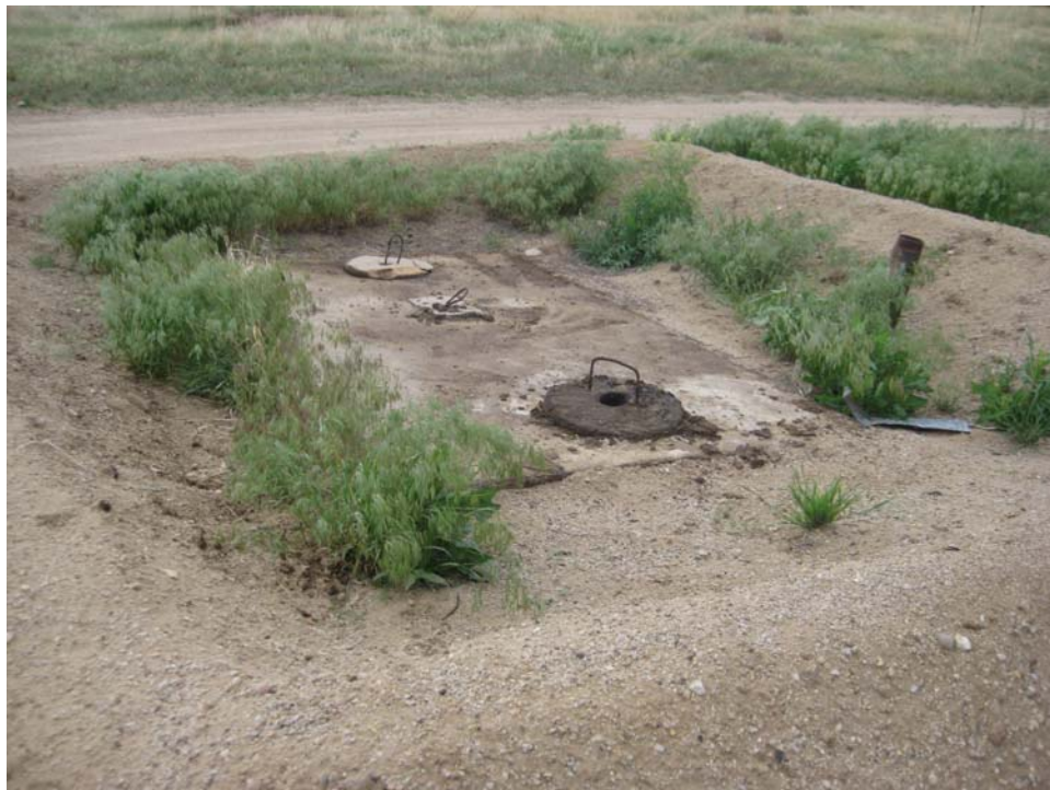
Photo 2. Buried concrete vault