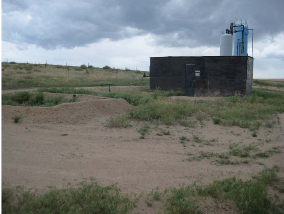
Photo 3. Buried concrete vault and two separators to the west