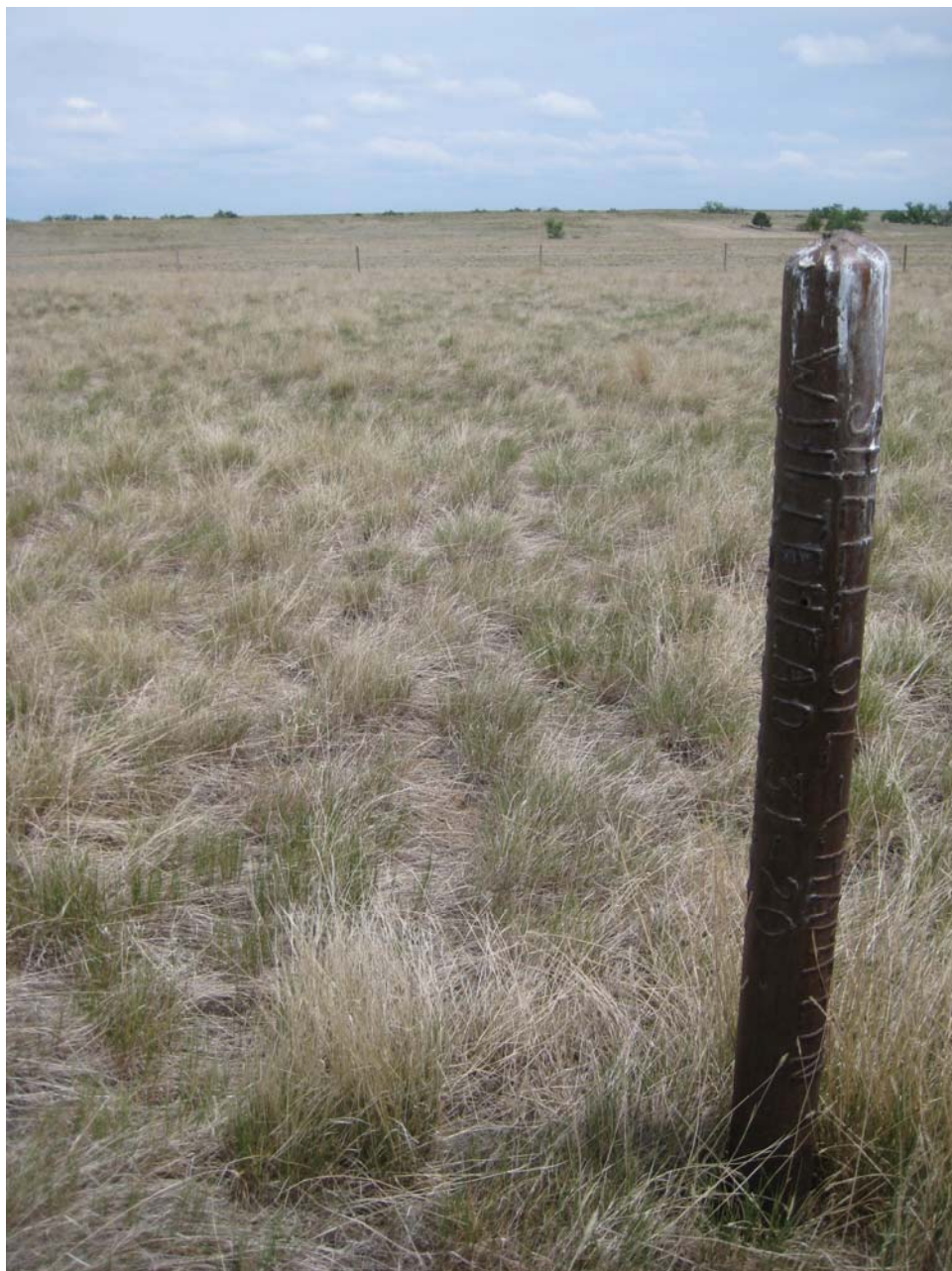
Photo 1. Looking east at marker for Whitehead 31-20 plugged and abandoned well; former pit site is beyond marker.