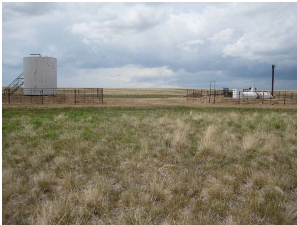
Photo 2. Looking west at former pit site in foreground and Whitehead 31-20A wellhead and equipment