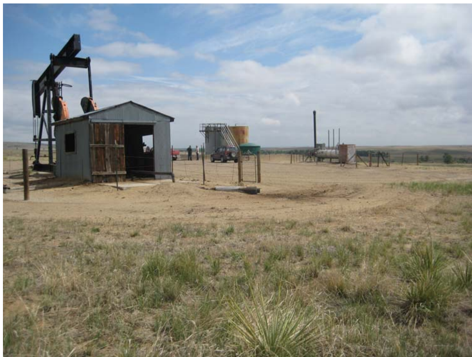
Photo 5. Looking northeast from the southwest corner of well pad. The former pit site may have been at the southeast corner of the well pad (right in photo).