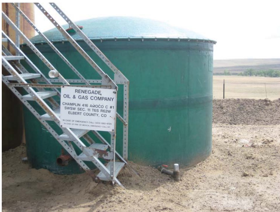
Photo 1. Covered fiberglass water tank