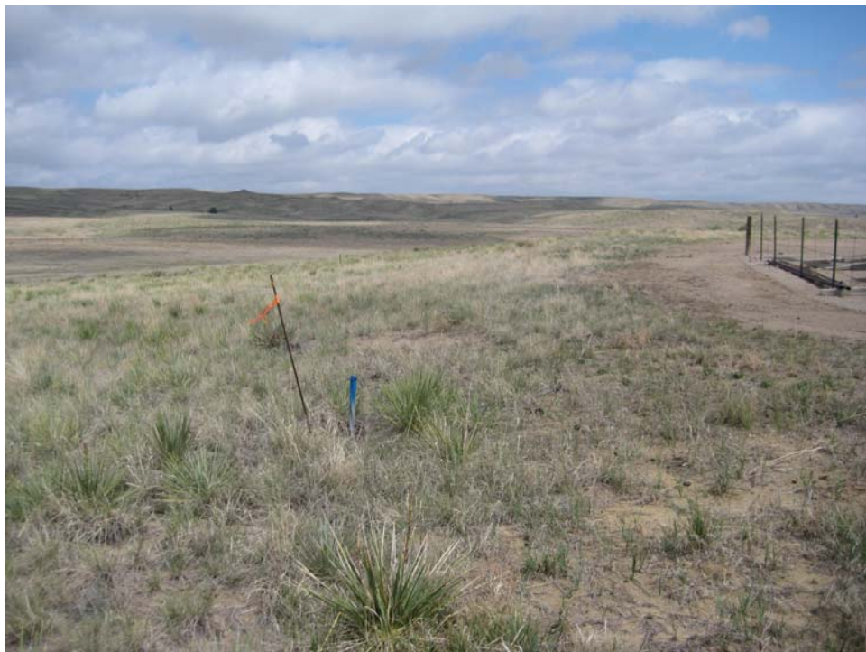
Photo 4. Looking north from the southwest corner of the wellpad