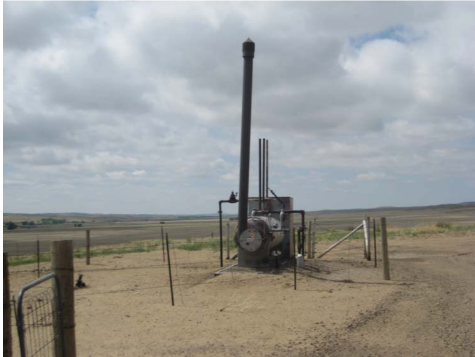
Photo 3. Horizontal separator