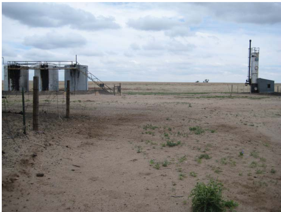
Photo 2. Looking east at three 300 BBL tanks and seperator