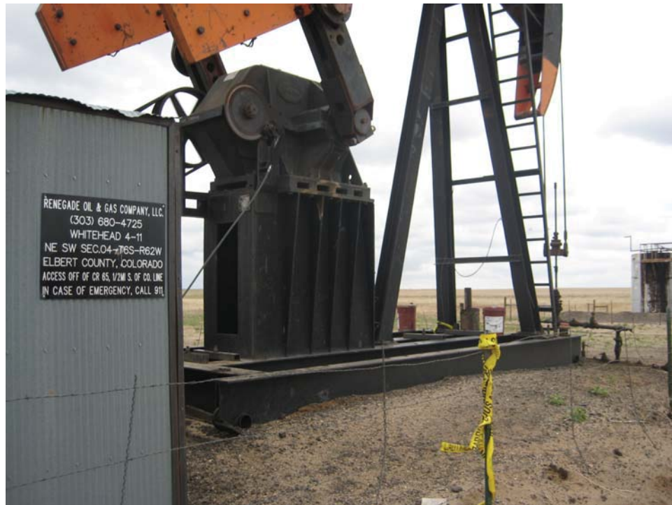
Photo 1. Whitehead 4-11 wellhead and lease sign