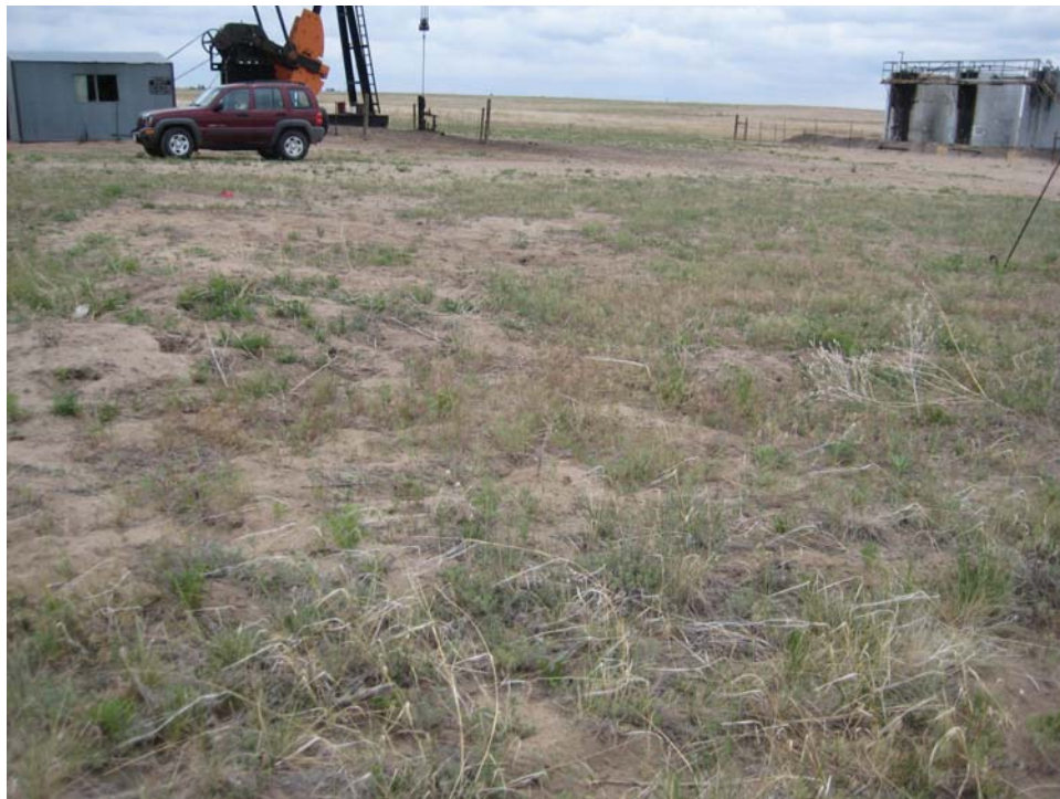
Photo 3. Looking north at former location of pit in foreground of wellhead