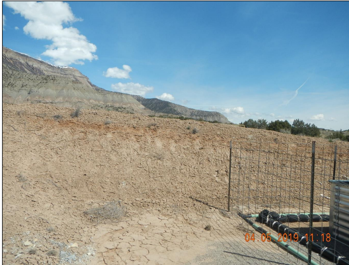
Slope behind equipment and tanks is sloughing sediment.