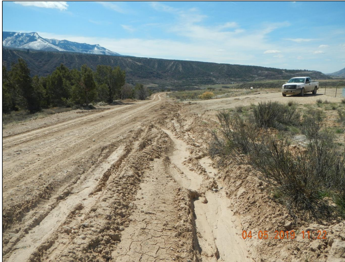
Road and ditch are rutted and damaged from traffic.