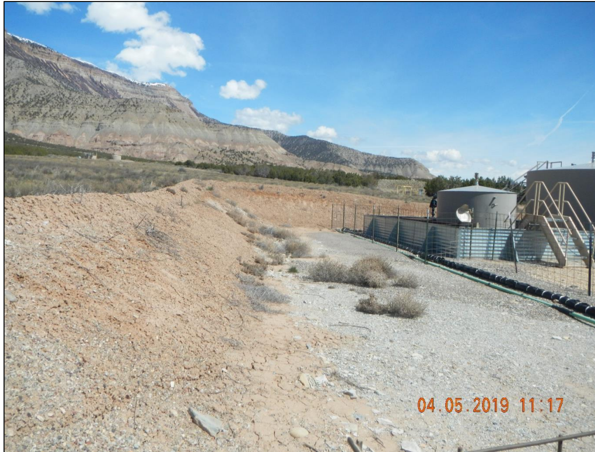
Dead weed rubbish between separators and tanks.