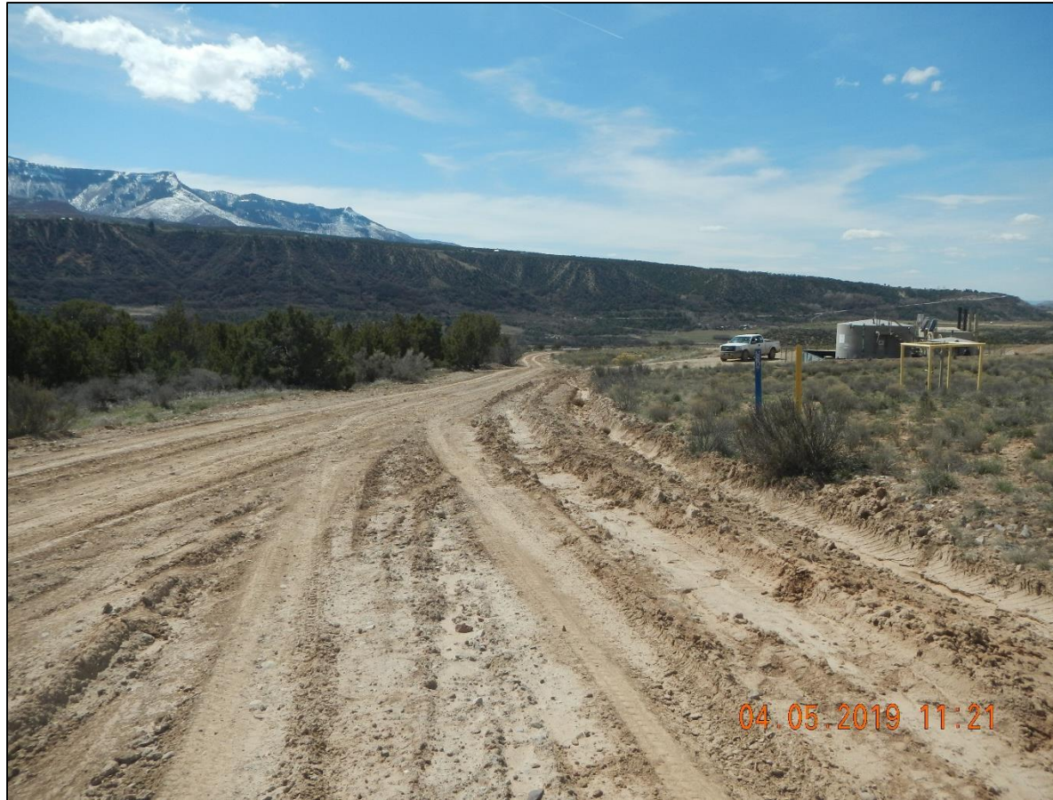
Road and ditch are rutted and damaged from traffic.