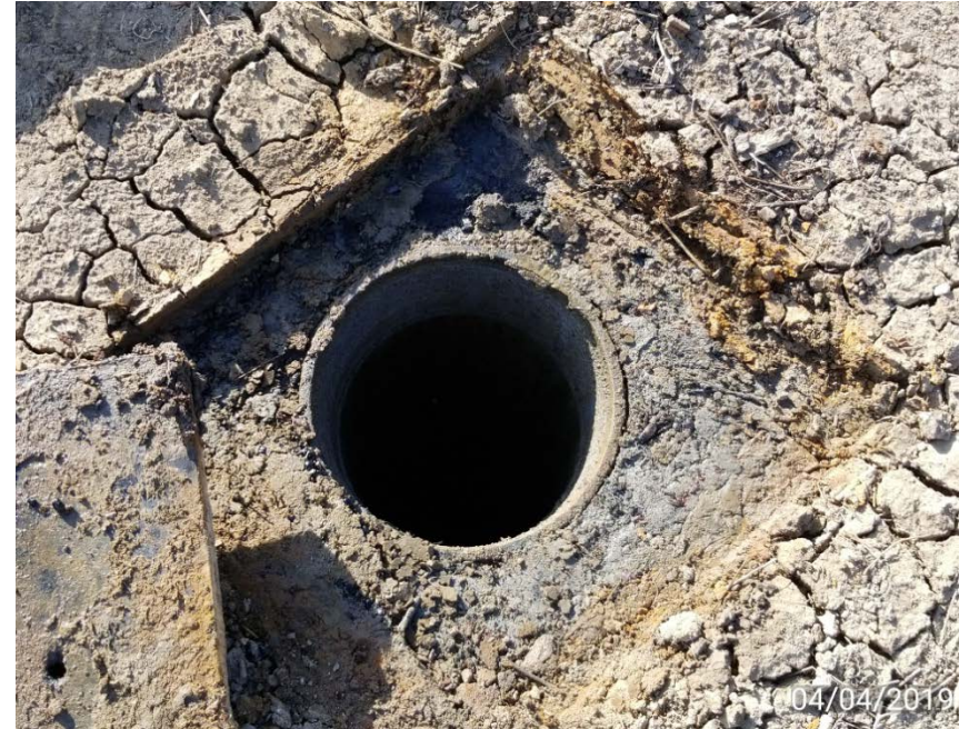
Photo 4. Well casing without cover.