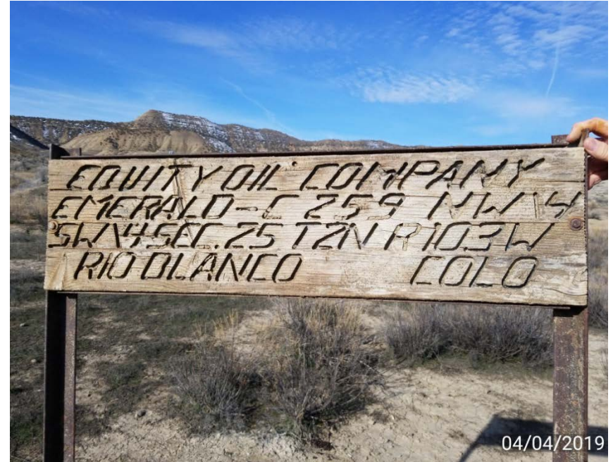
Photo 2. Well sign was lying on ground.