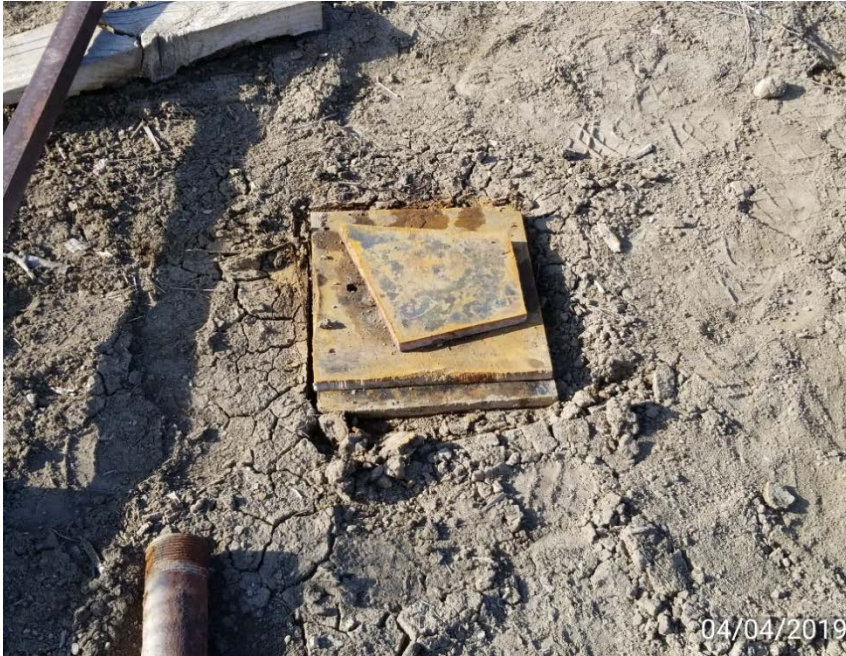
Photo 3. Well casing covered with steel plate.