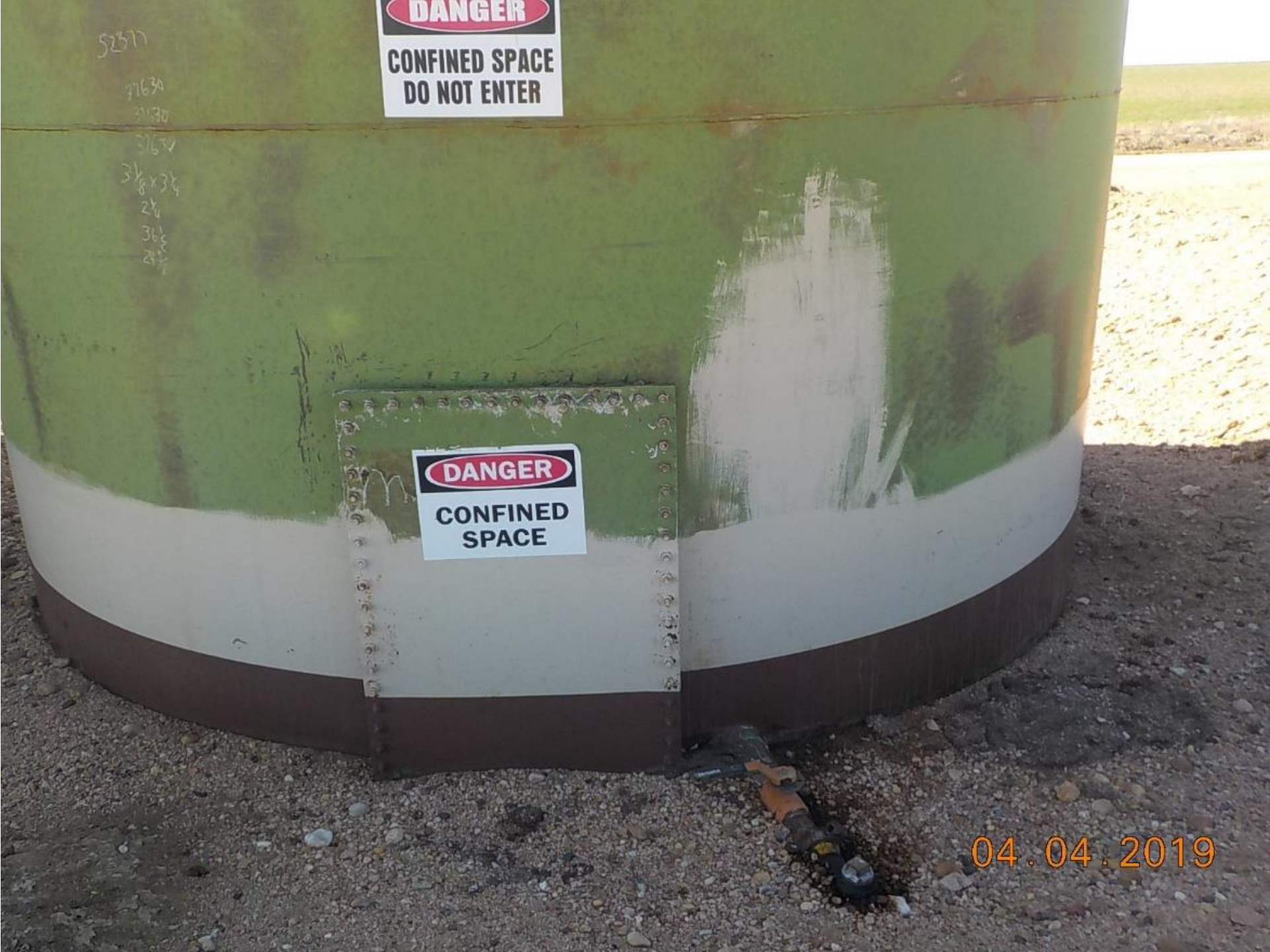
Tank valve is leaking.