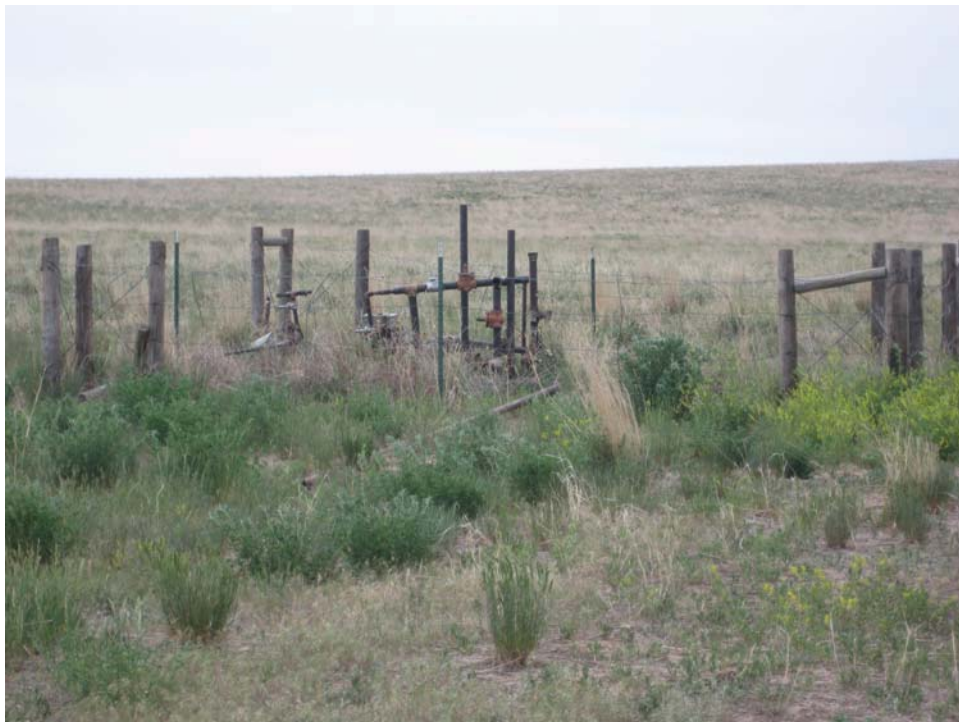
Photo 4. Wellhead equipment