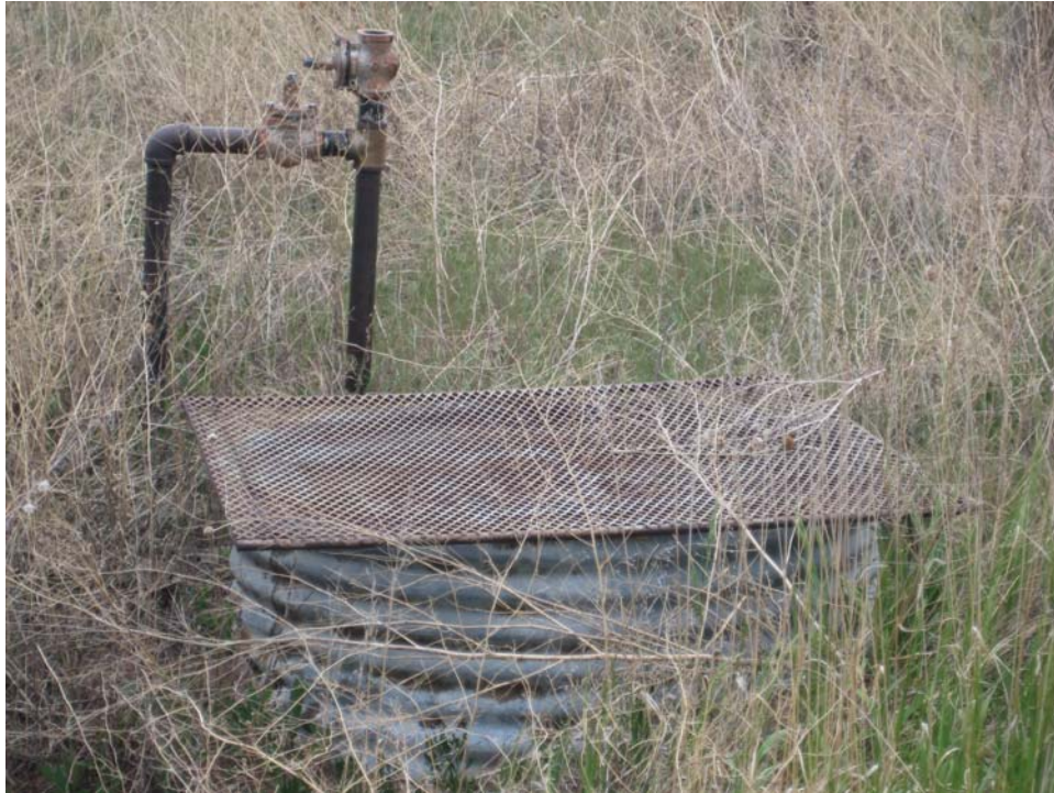
Photo 3. Culvert and cover