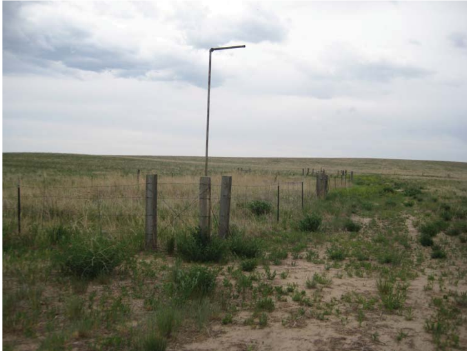
Photo 1. Well site - temporarily abandoned well status