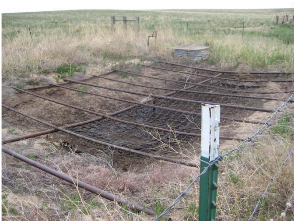
Photo 2. Earthen pit and culvert