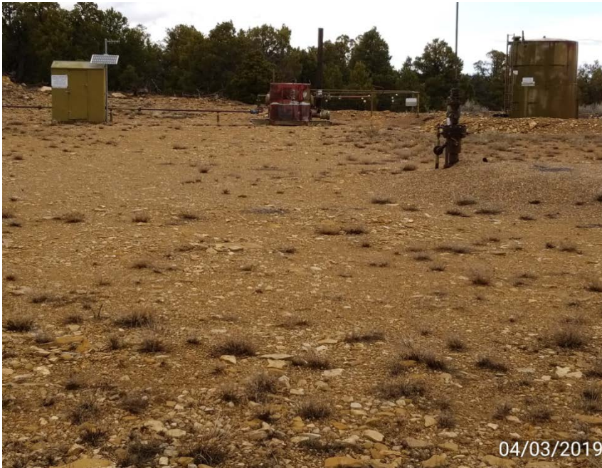
Photo 1. Location looking north.