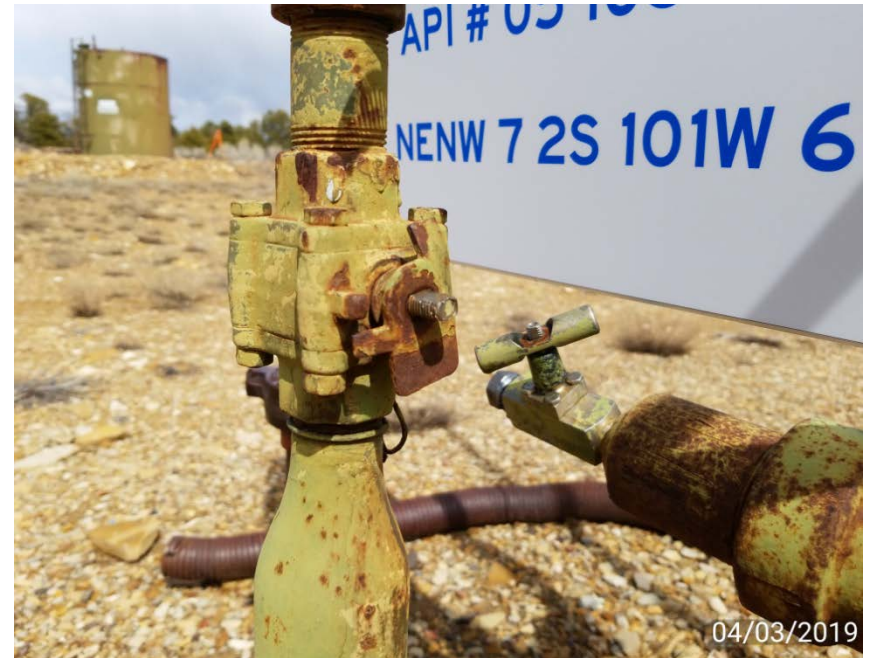
Photo 3. Well head - casing valve closed.