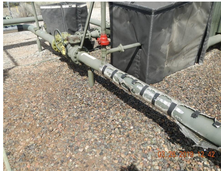
Area of stained gravel and wet area beneath valve.