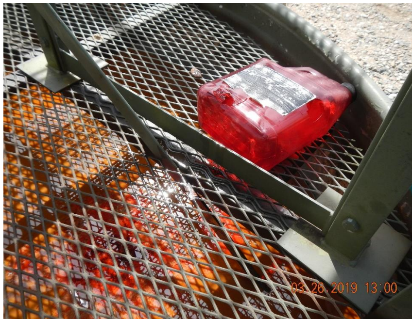
Broken jug of oil additive dripping into secondary containment.