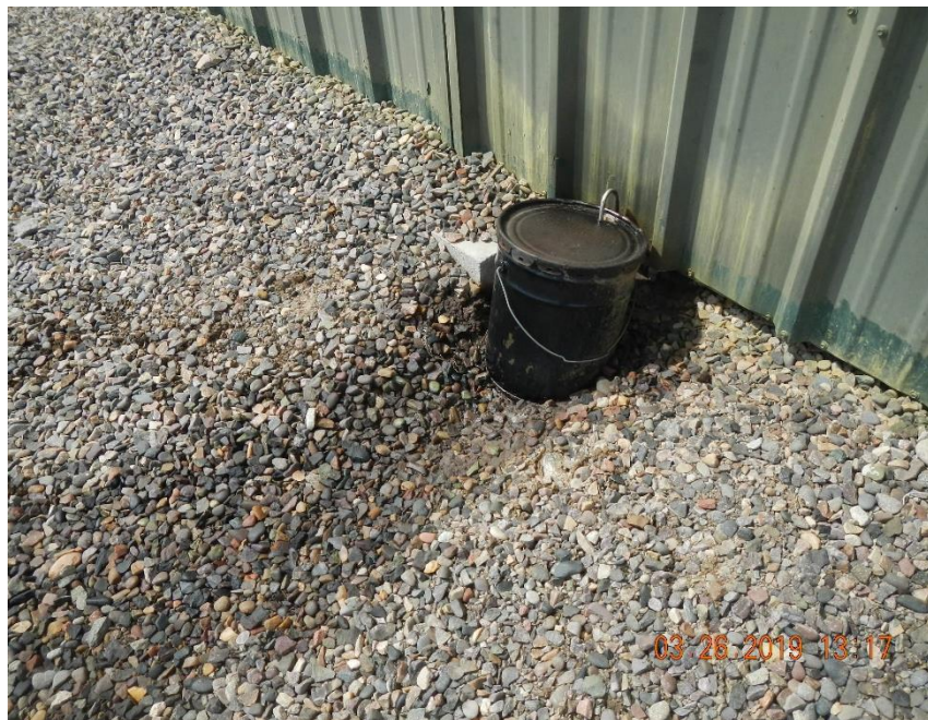
Overflowing 5 gallon bucket.