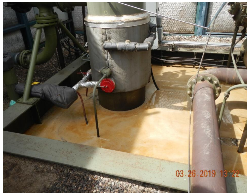
Oil underneath compressor.