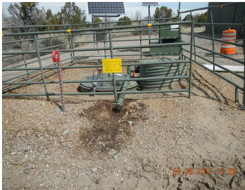
Stained soil at truck load out valve.