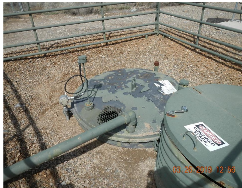
Paint on tank is peeling off.