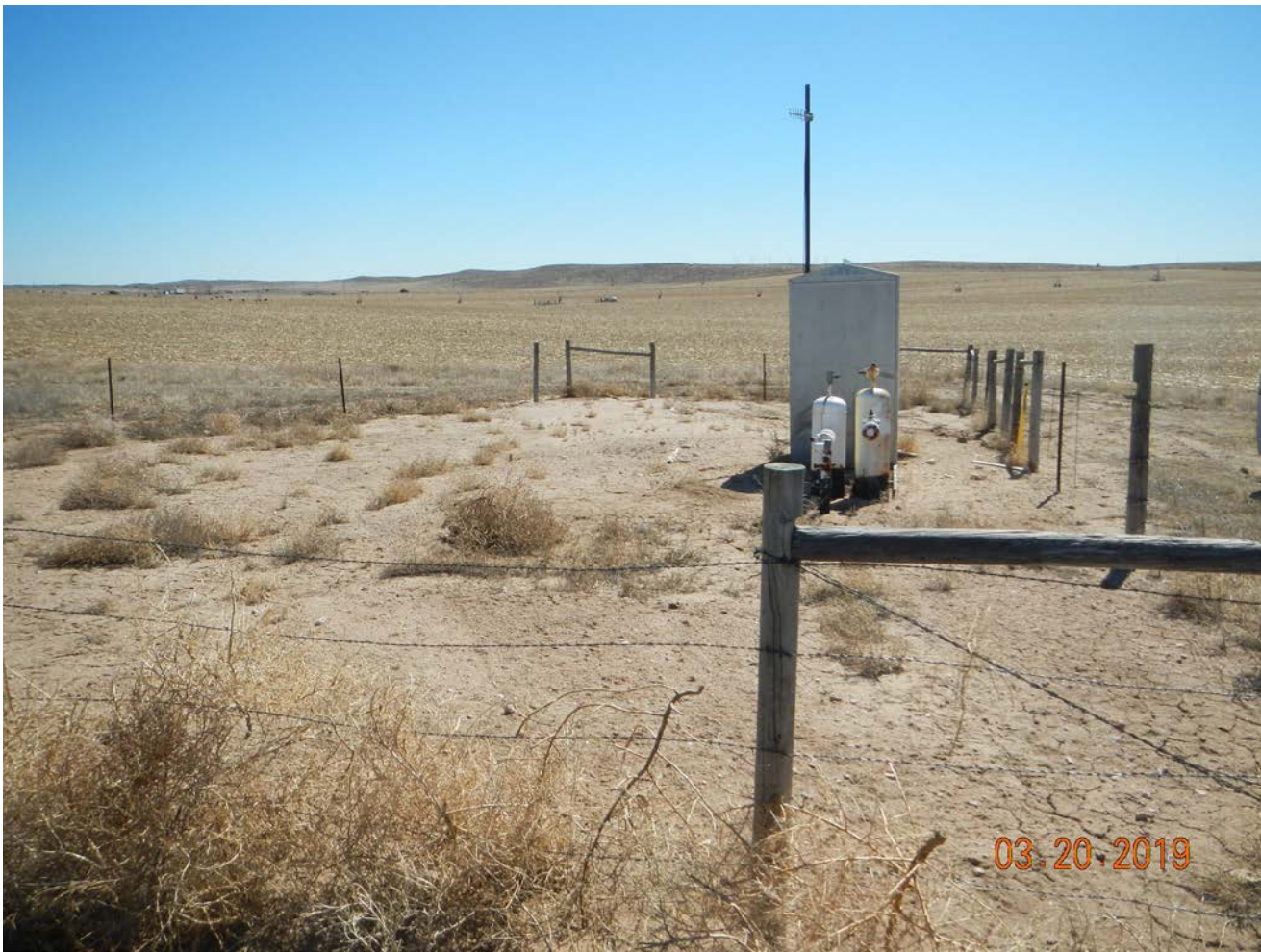
Location photograph, view south. Meter shed contains no equipment, Foundation Energy sign on the door. Site requires final reclamation per 1000 series Rules.