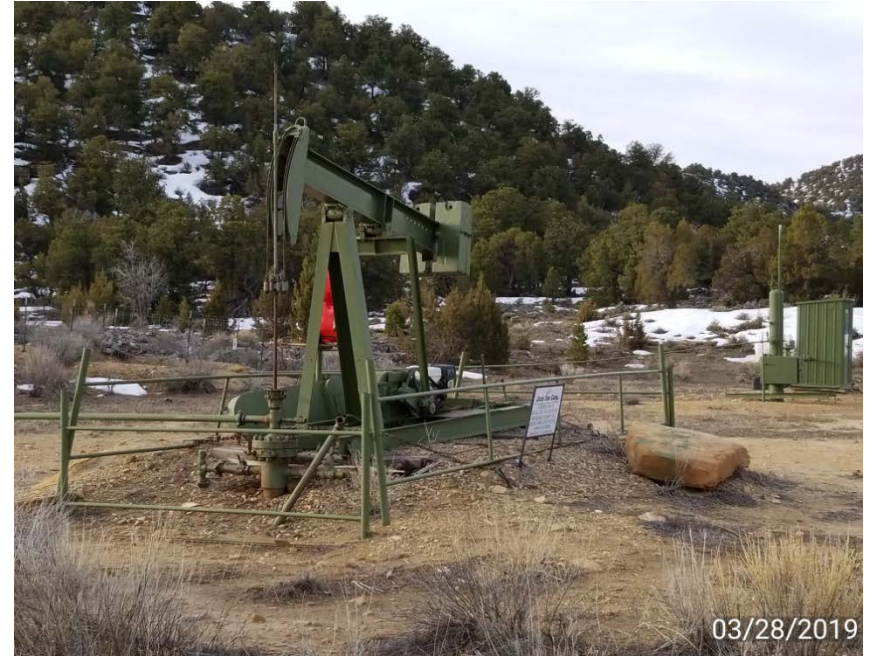
Photo 2. Pump jack & separator.