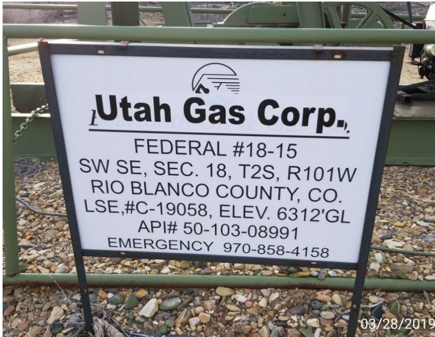
Photo 5. Well head sign with incorrect phone number.