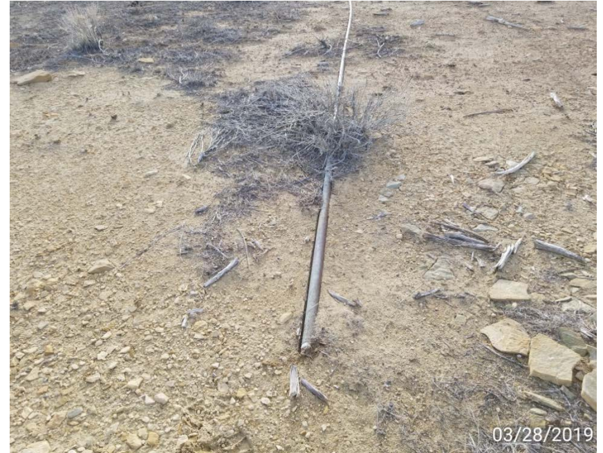
Photo 6. Unused pipe.