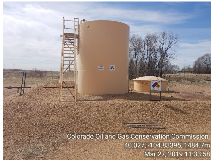
Photo 4 TNK BTRY Equipment not anchored. Earthen berm in floodplain