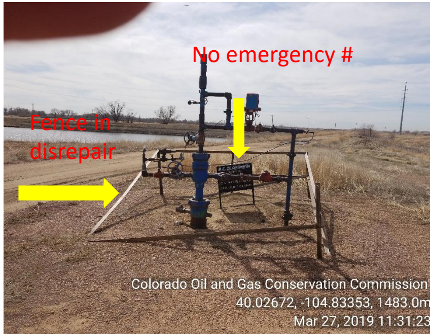
Photo 1 WH no emergency contact number on sign. Fence in disrepair. Well head is SI