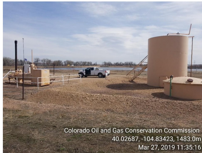
Photo 6 Facility located in a floodplain