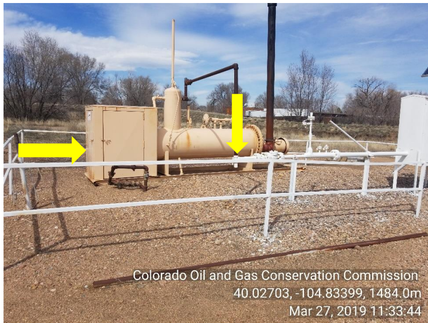
Photo 3 Equipment not anchored