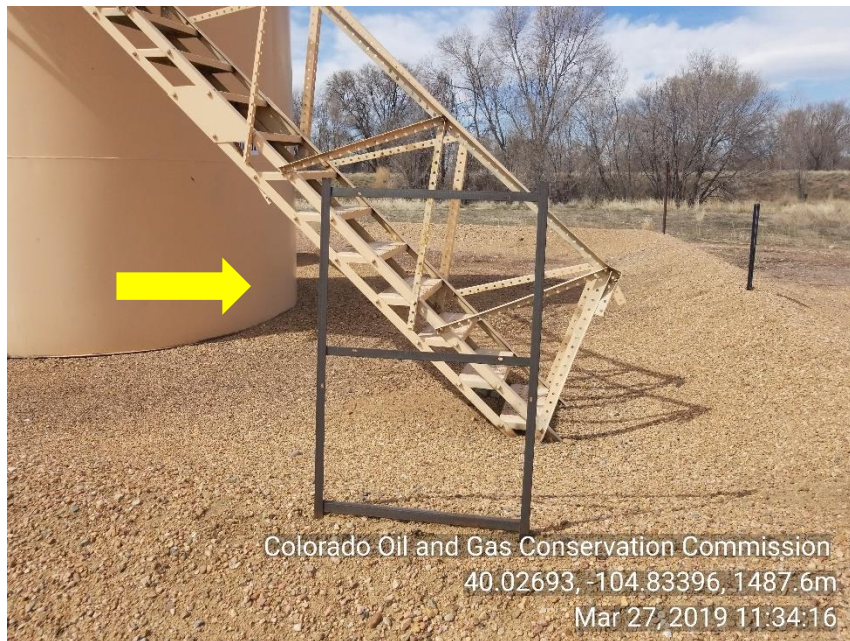
Photo 5 Missing TNK BTRY facility sign