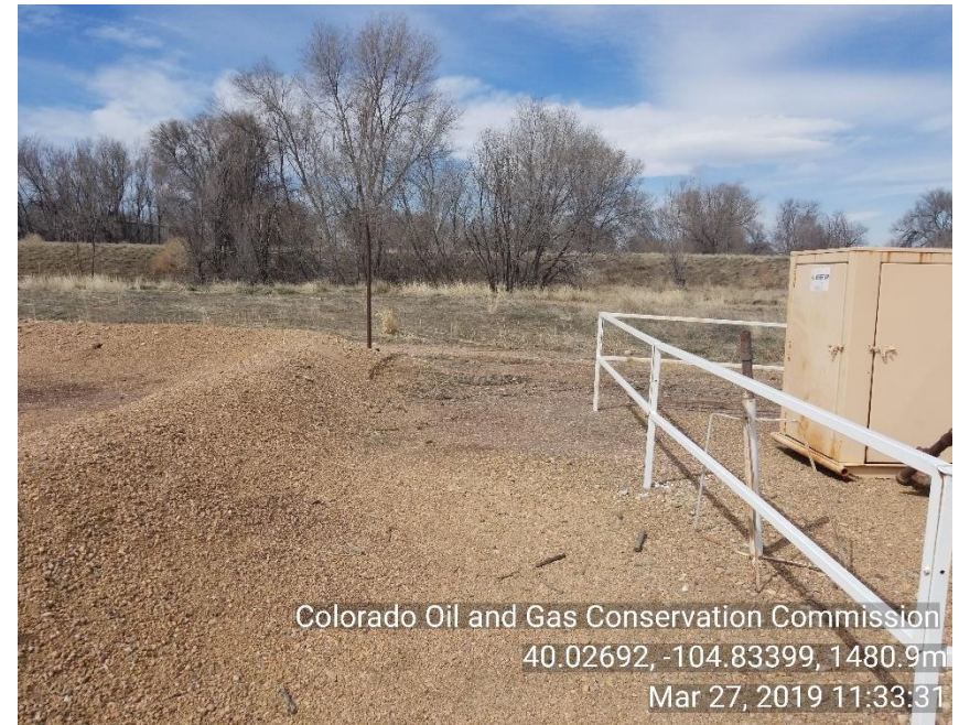
Photo 2 unused equipment removed