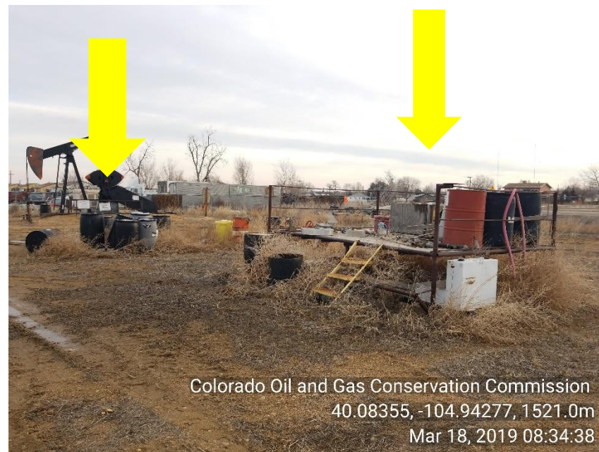
Photo 12 Trash, Deris(weeds) Unused equipment and improper storage of fluids