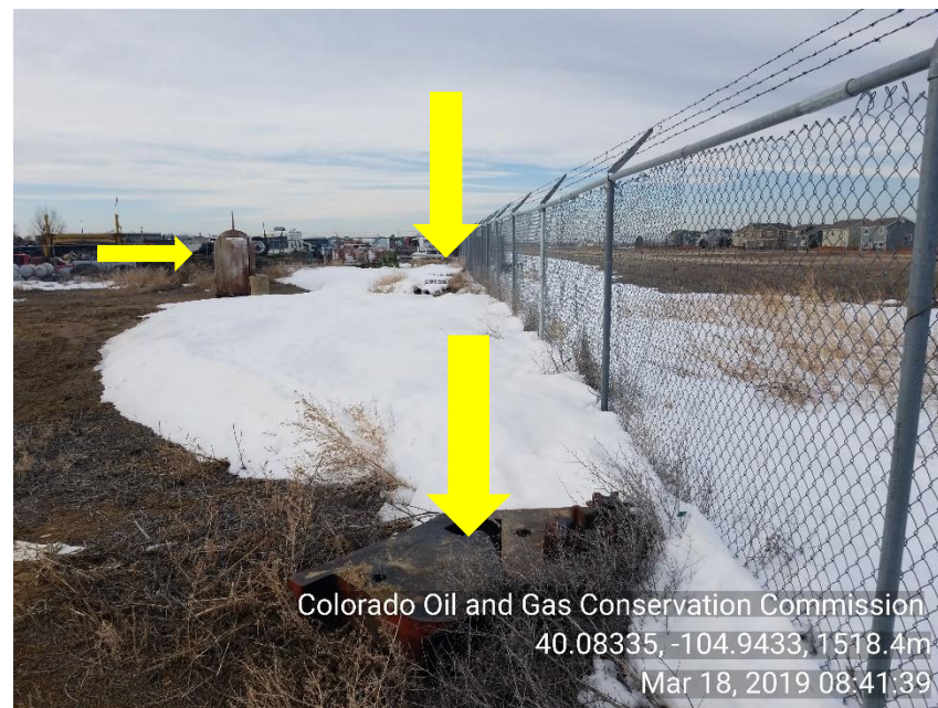
Photo 20 Trash, Debris (weeds) unused equipment PU weight, Pipe and separators