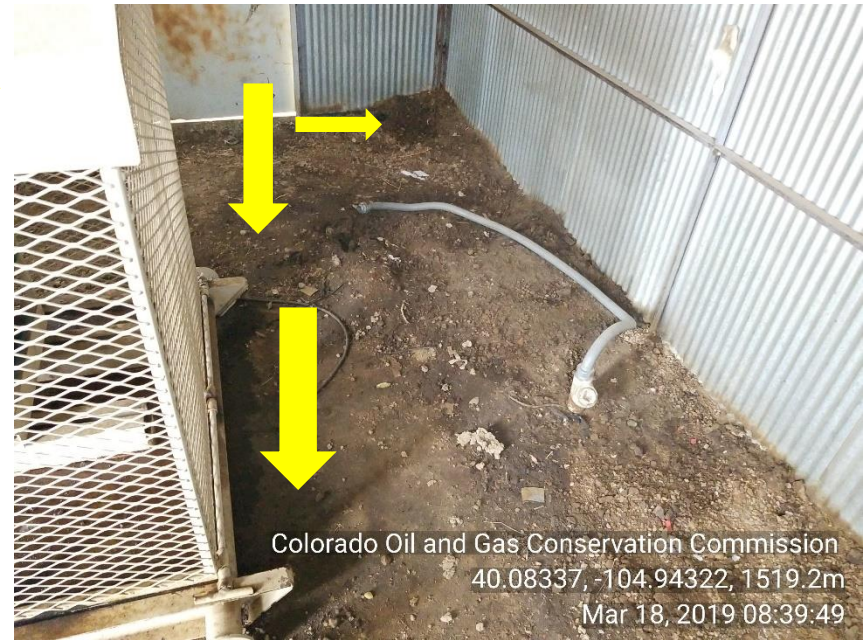
Photo 18 Stained soil inside pump house