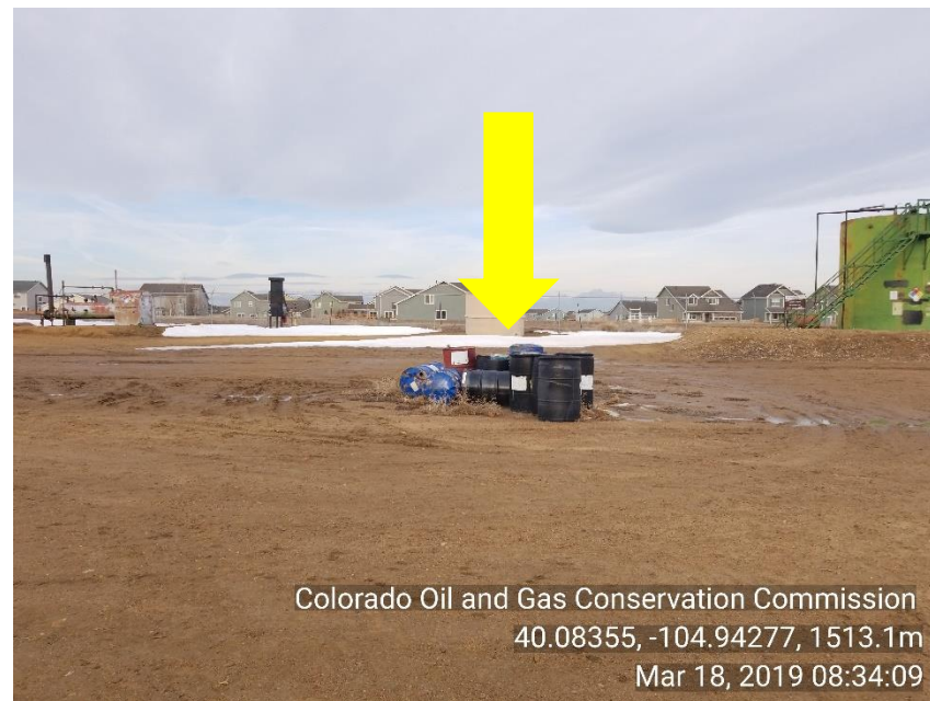
Photo 10 Unused equipment and improper storage of fluids