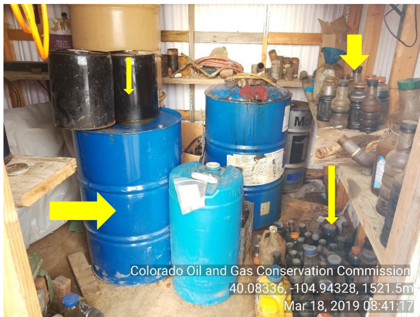
Photo 19 improper storage of fluids containers not marked with identifying fluid.