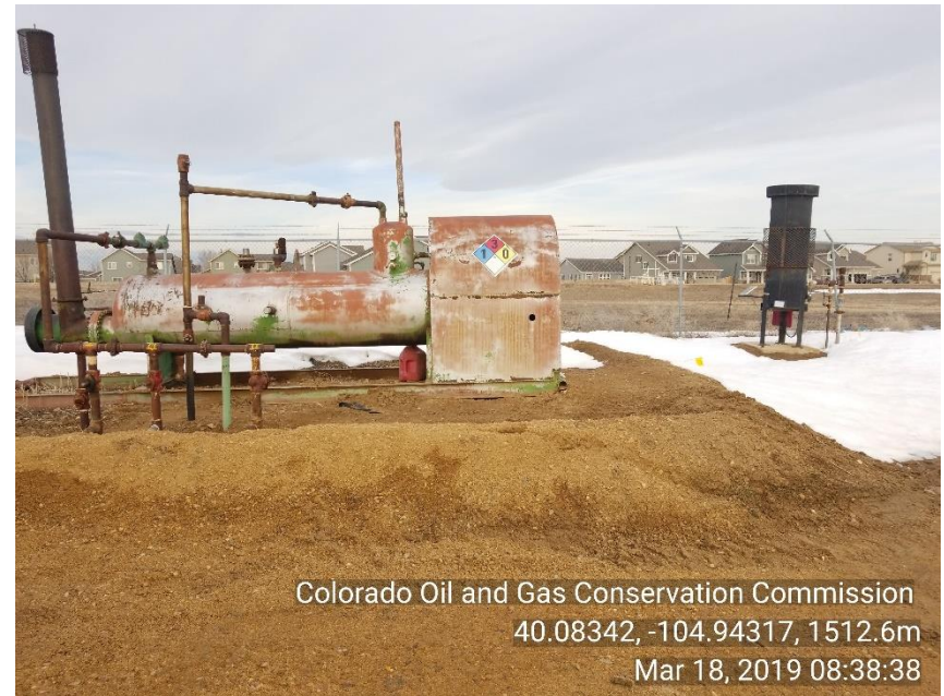
Photo 16 Separator and ECD