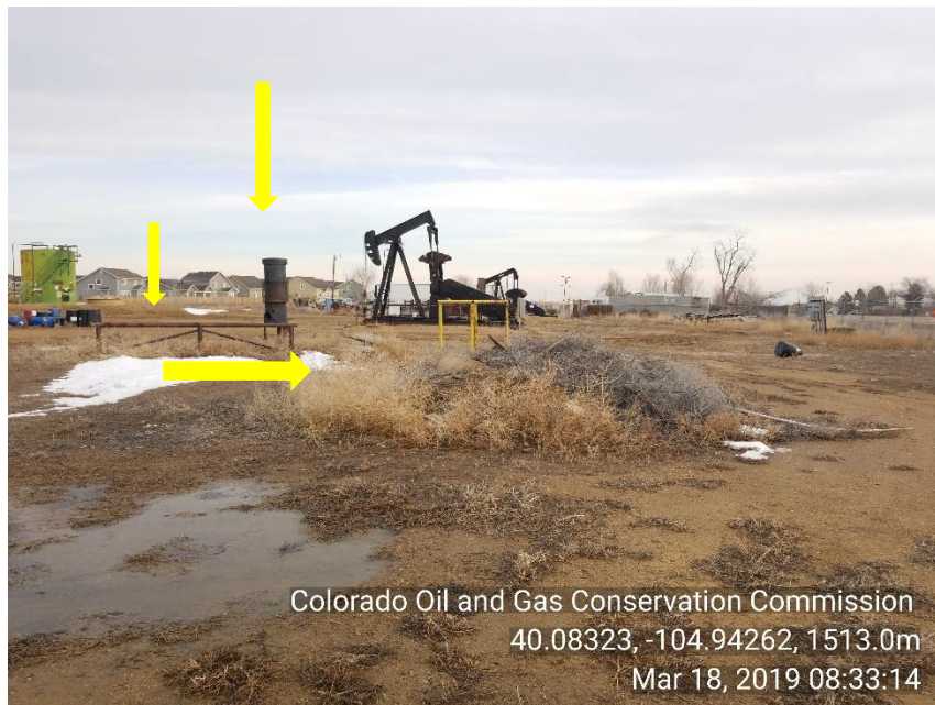
Photo 9 Trash, Debris(weeds) and unused equipment pip rack and ECD