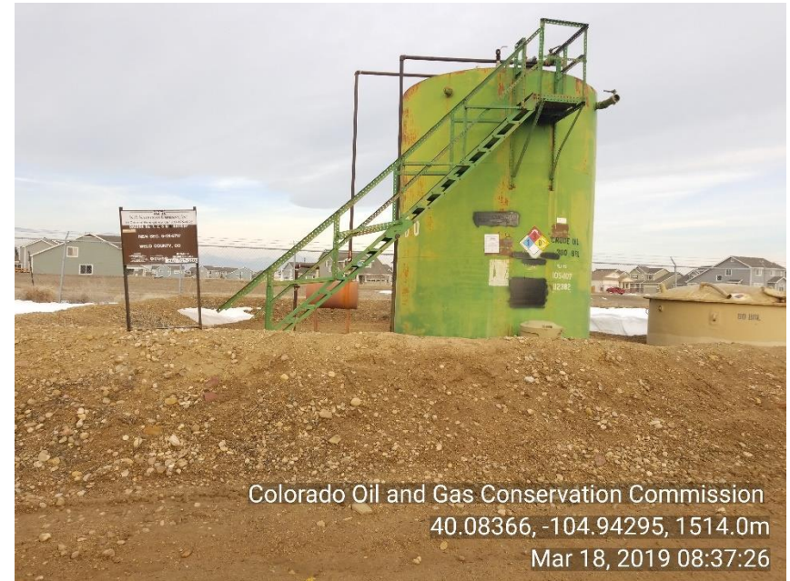
Photo 4 TNK BTRY battery location is next to Colorado BLVD needs to be painted appropriate color