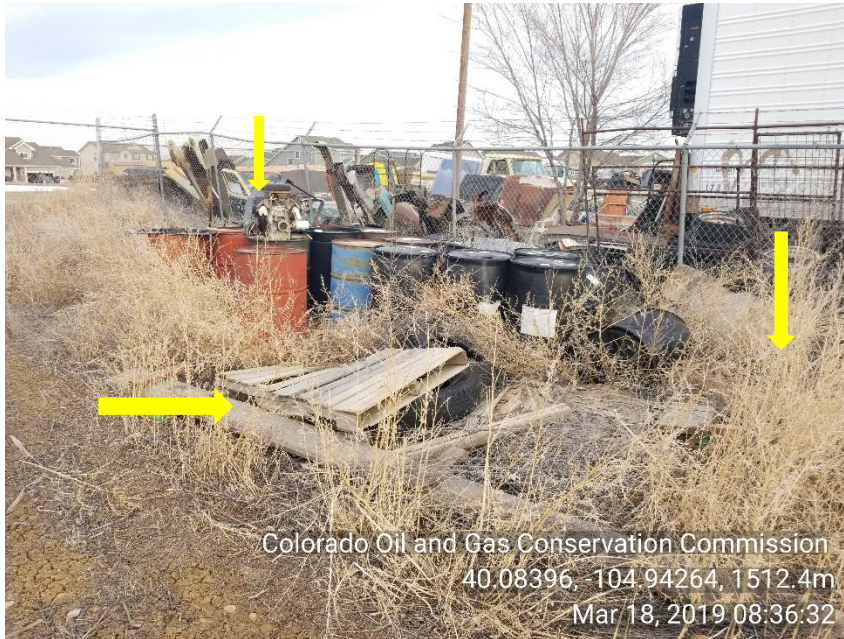
Photo 15 Trash, Debris(weeds) pellets and unknown trash, Improper storage of fluids