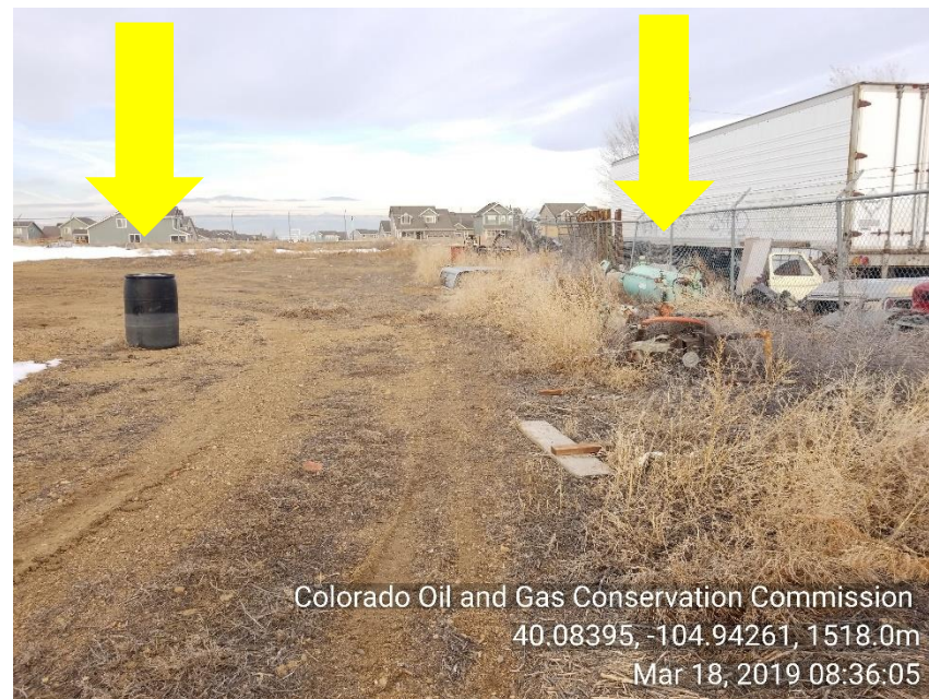
Photo 14 Trash, Deris(weeds) Unused equipment and improper storage of fluids