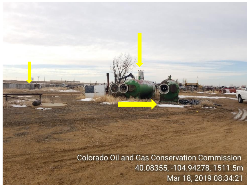
Photo 11 Trash, Debris(weeds) and unused equipment pipe rack, poly pipe and separators