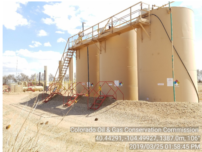
Photo #2 Devries State A 36-21, 36-23, Scholfield A 36-20, State A 36-9 - Battery Shut-down