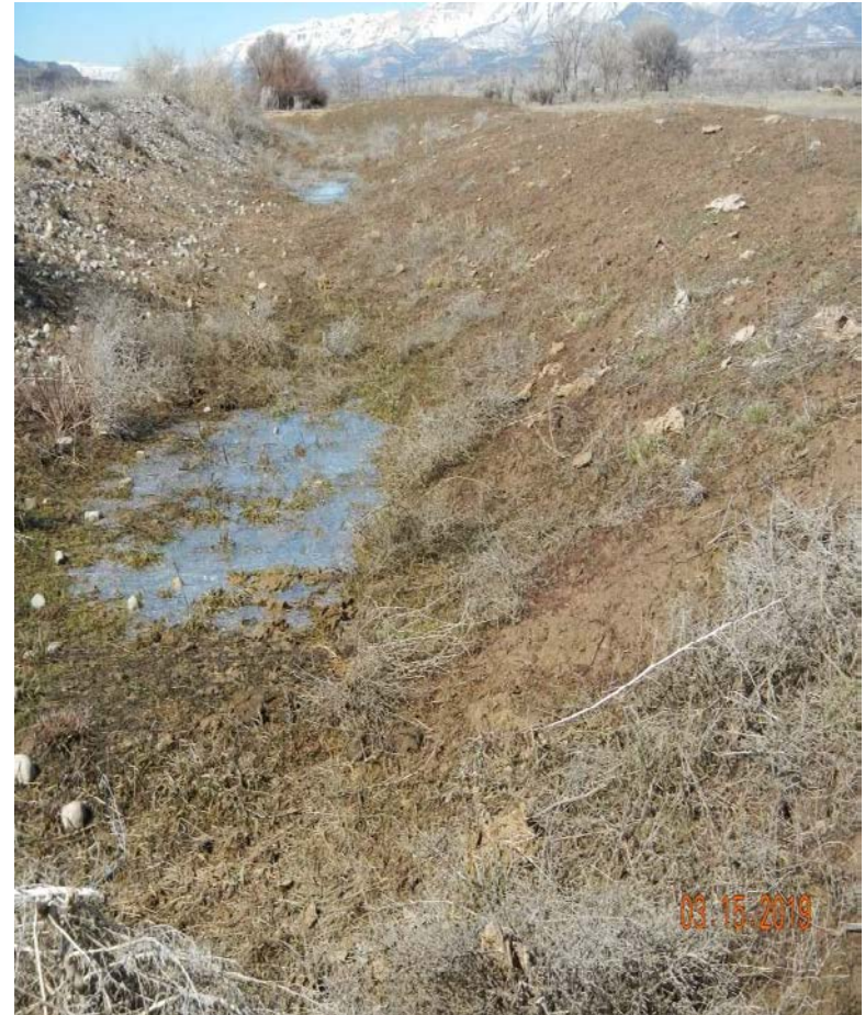
Photo#3: BMP needs to be installed along along inside base of berm.