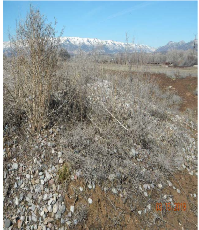
Photo#7: There is evidence of Annual Weed Growth that becomes Debris .