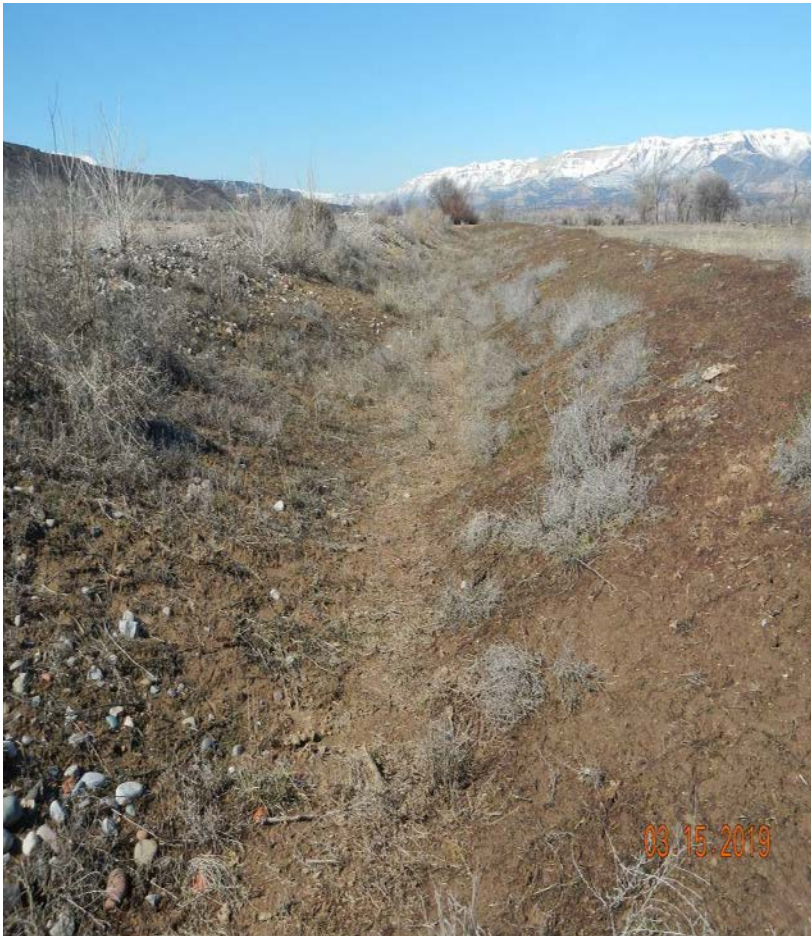
Photo#6: There is evidence of Annual Weed Growth that becomes Debris.