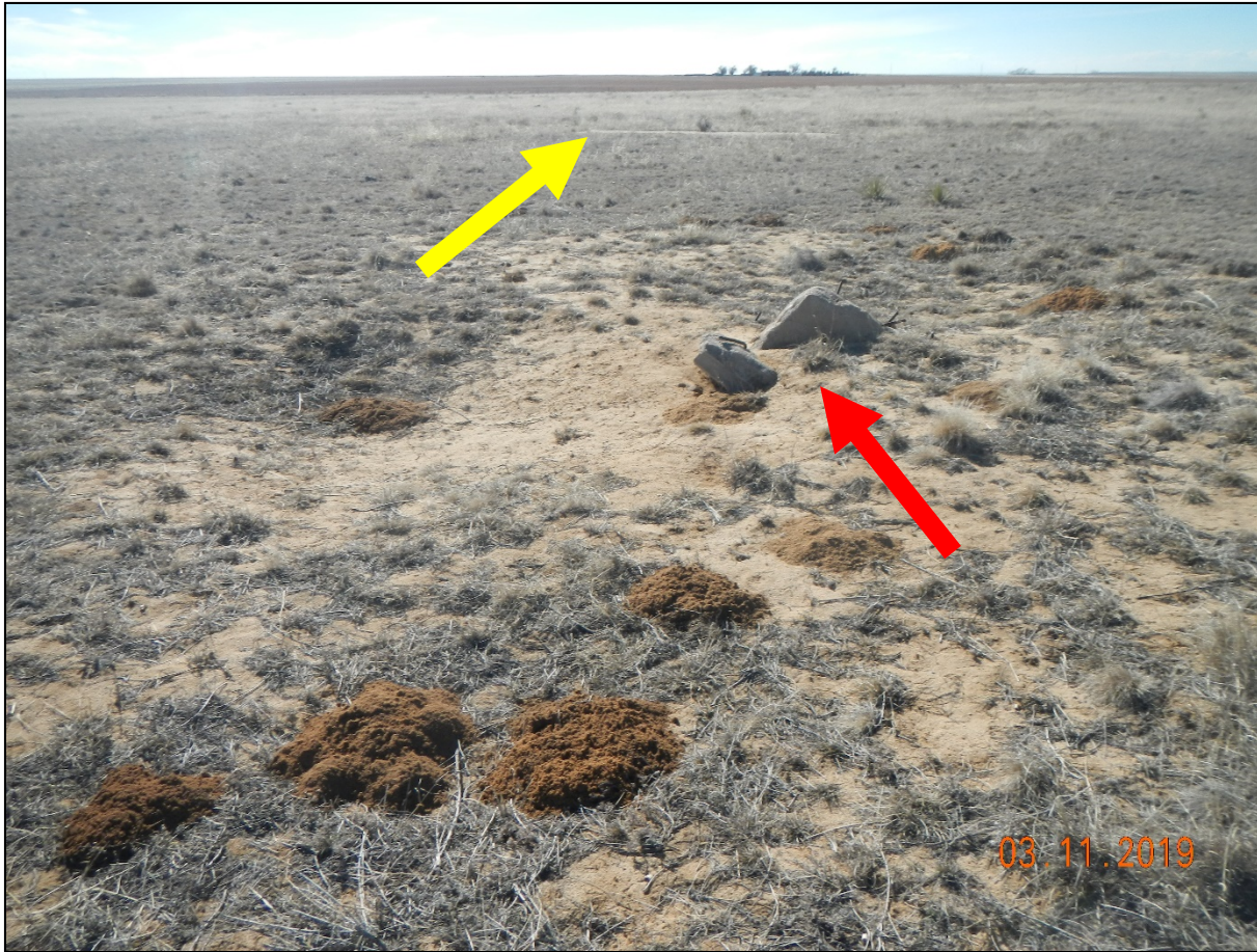
Photo 6. South of the location at:Lat/Long:38.79662,-103.65101. A chunk of cement remains (red arrow). This appears to be old battery site. A possible cement pad (yellow arrow) can be seen in aerial photo.