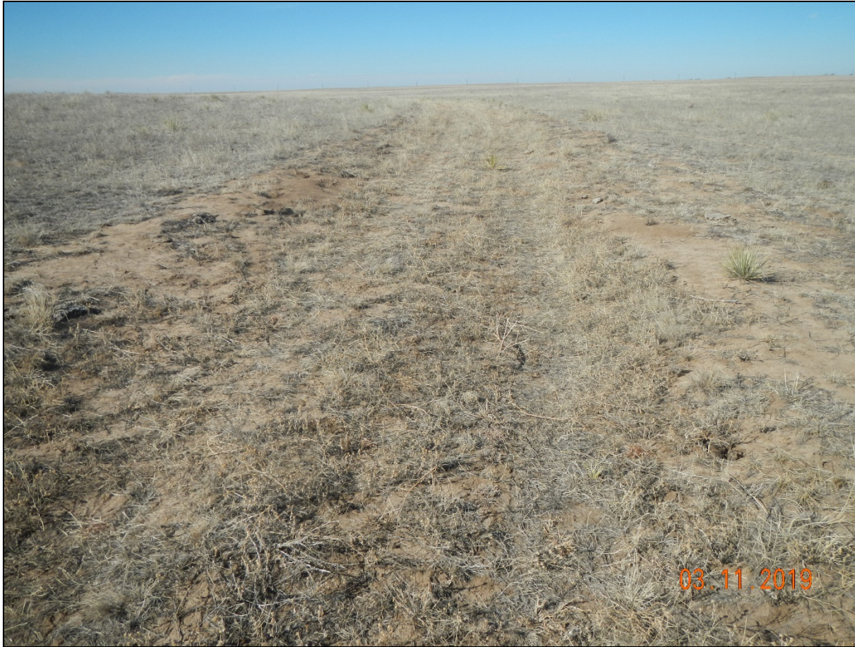
Photo 1. Facing north along the access road. Vegetation has established along areas of the road.