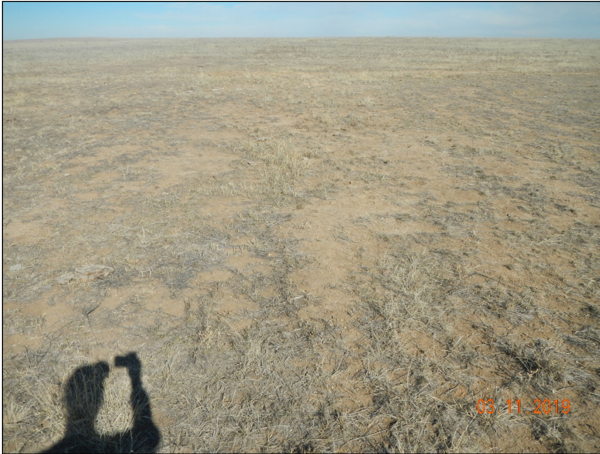
Photo 4. Facing east toward the location. Vegetation is establishing in areas of the location.