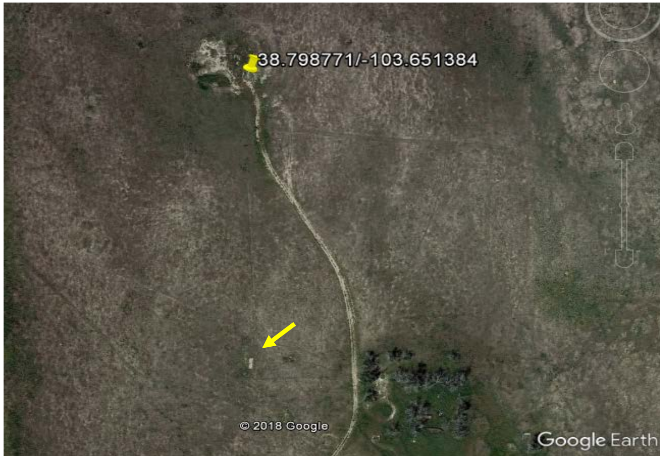
Photo 7. Yellow arrow points to possible cement pad at the battery site. Follow up inspection needs to be performed to evaluate.