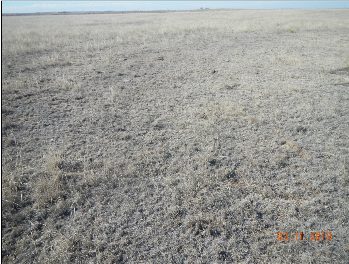
Photo 5. Facing north at the surrounding undisturbed pasture.