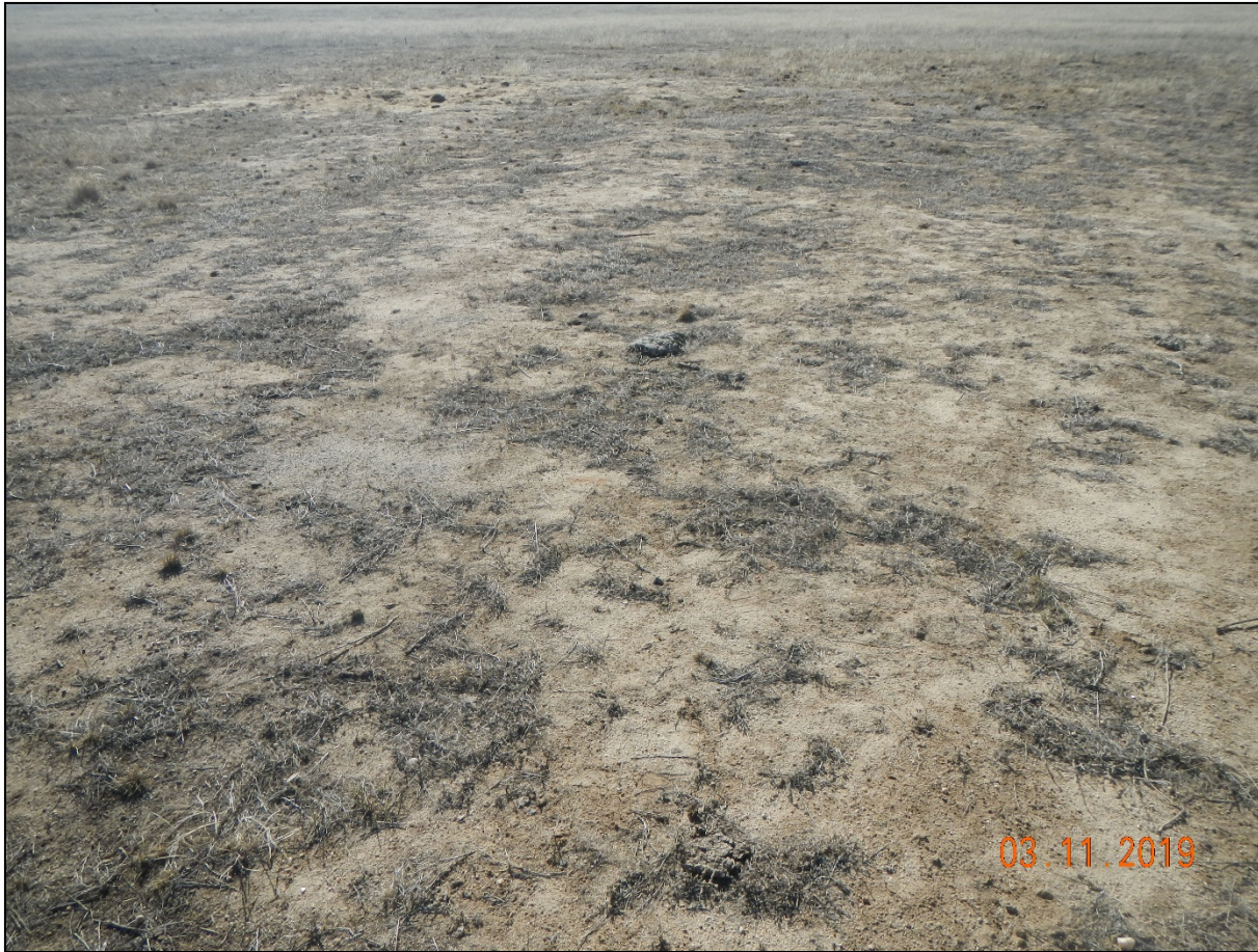
Photo 3. Facing west at the location. This area does not appear to have adequate vegetation cover.