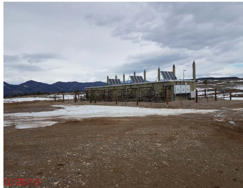
Location Photo #2