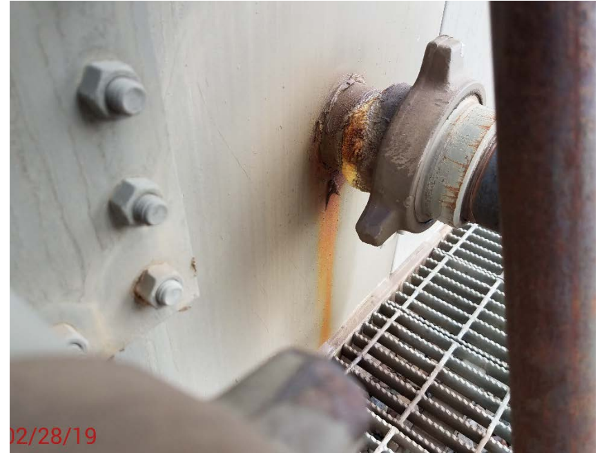
Location Photo #7, 44B leaking fitting.