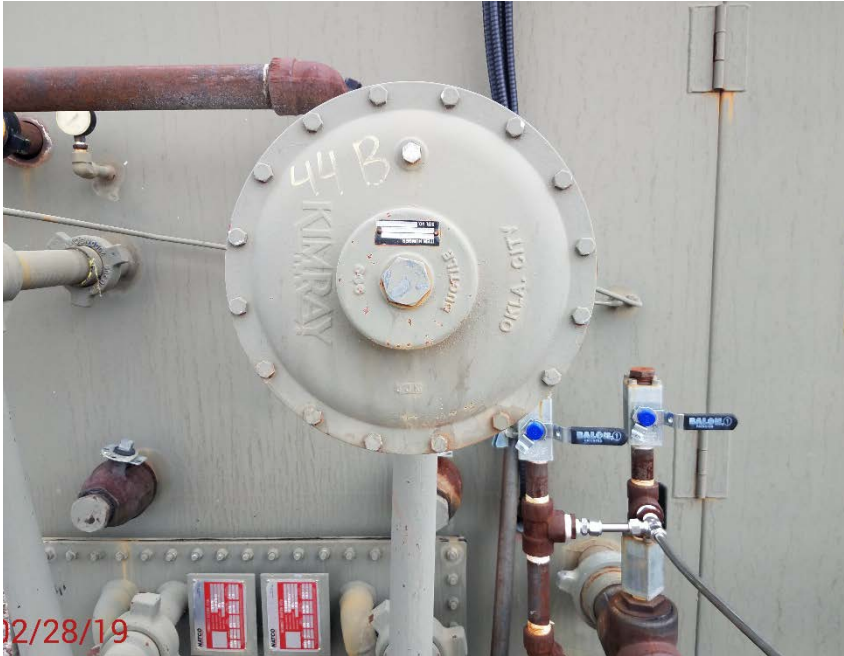
Location Photo #6, Separator 44B has a leaking fitting.