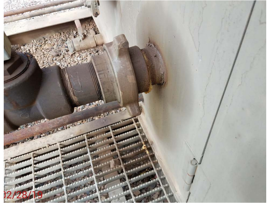
Location Photo #5, 11C-24 leaking fitting.