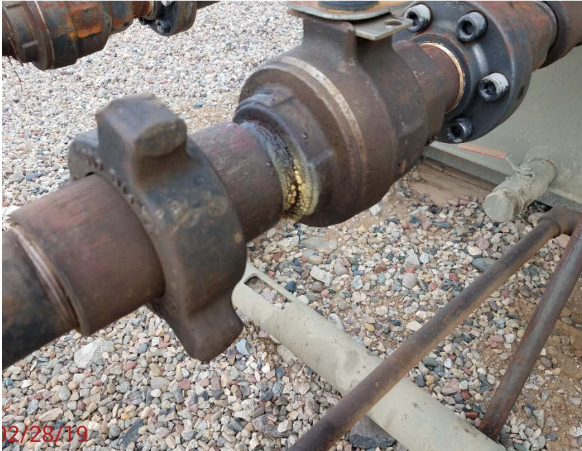
Location Photo #12, 41B 2 of 2 leaking fitting.