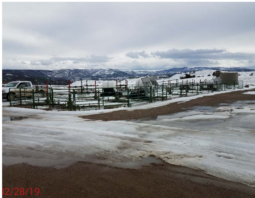
Location Photo #1