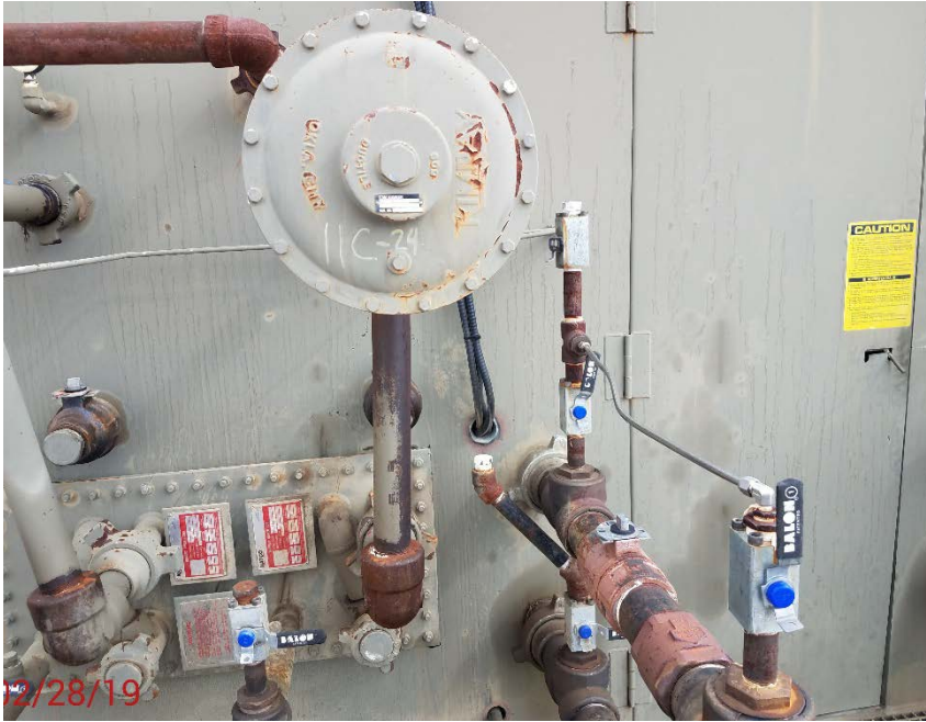
Location Photo #4, Separator 11C-24, has leaking fitting.