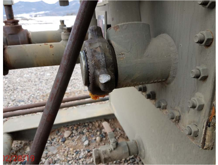
Location Photo #11, 41B 1 of 2 leaking fitting.