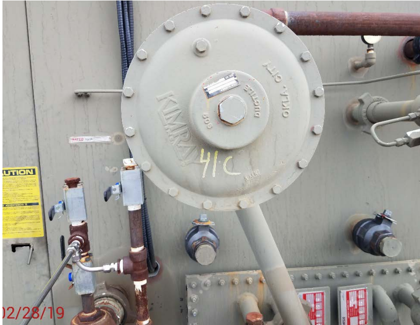
Location Photo #8, Separator 41C has a leaking fitting.