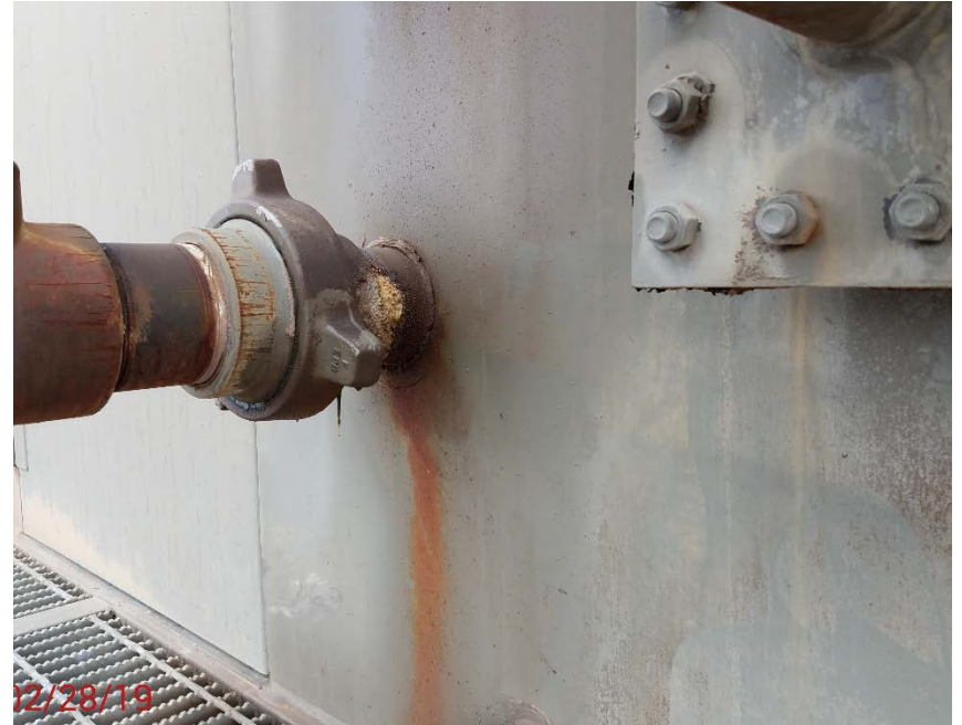
Location Photo #9, 41C leaking fitting.