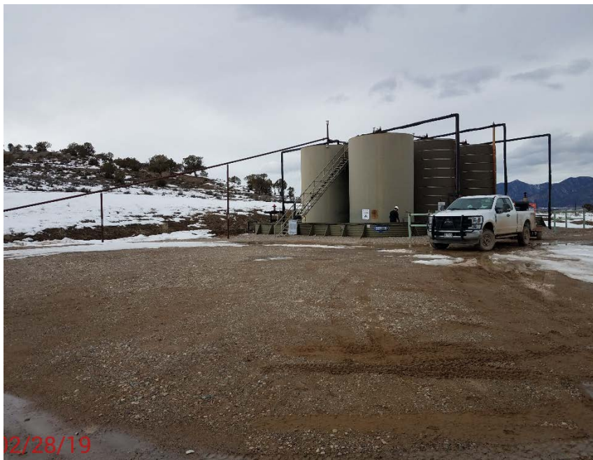
Location Photo #3