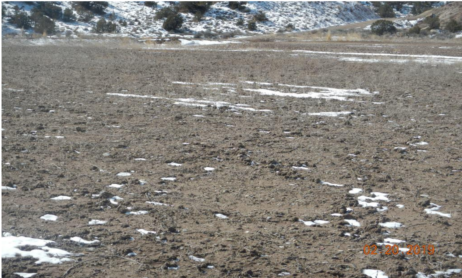
Photo#2: Areas of Location have not been Reclaimed for Interim Reclamation.