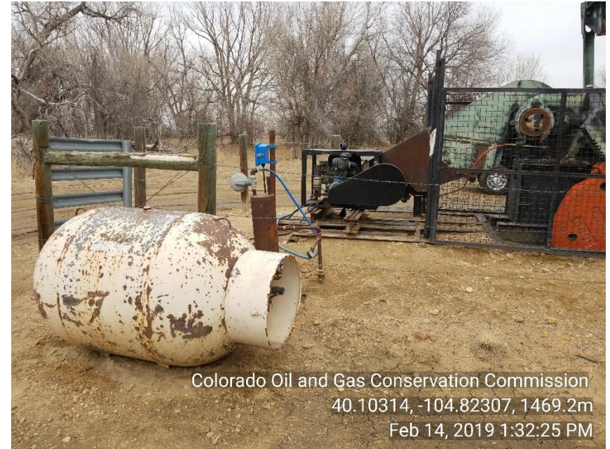
Photo 4 unused equipment propane tank