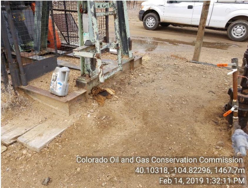
Photo 3 Trash oil jug and rag