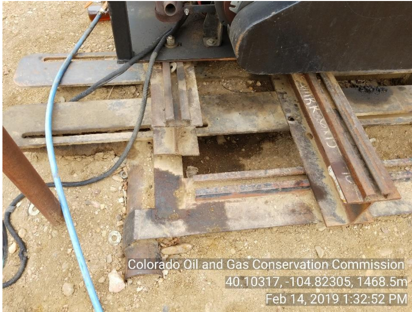
Photo 5 Stained soil under PU