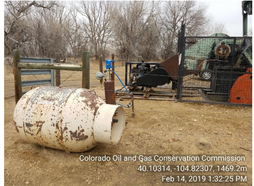
Photo 4 unused equipment propane tank