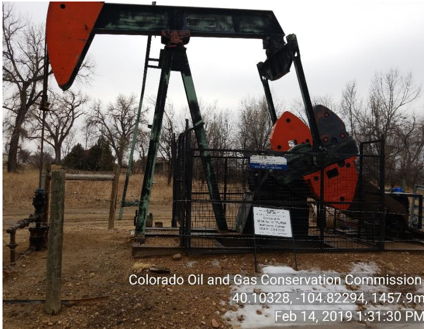
Photo 1 PU