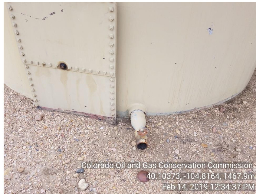
Photo 4 no bull plug on crude oil load line