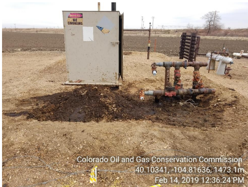
Photo 9 stained soil appeared to have leak in front of sep