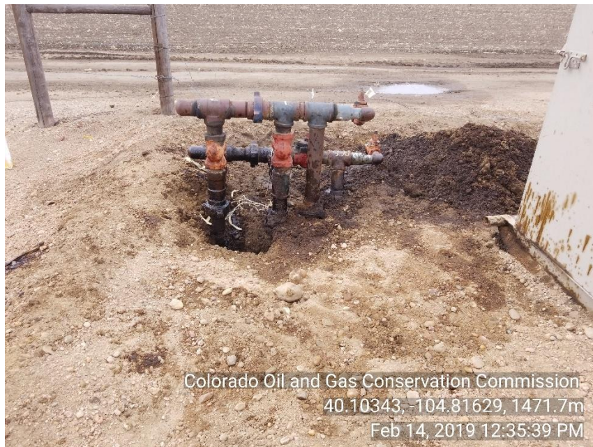
Photo 7 stained soil appeared to have leak in front of sep