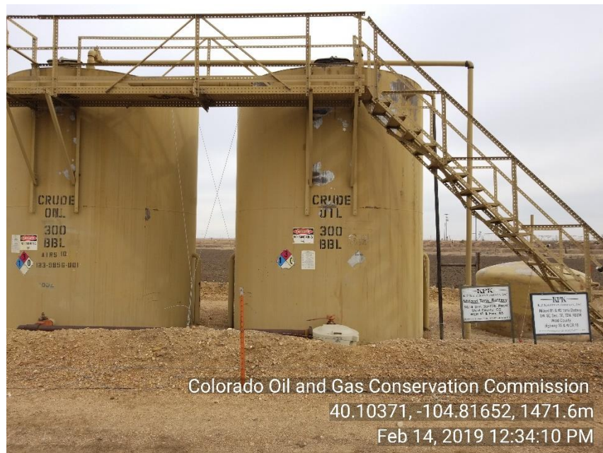
Photo 3 TNK BTRY