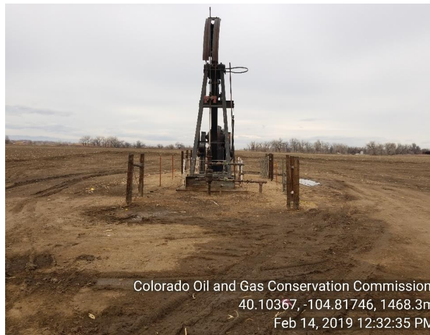
Colorado Oil and Gas Conservation Commission 40.10367, -104.81746, 1468.3m Feb 14, 2019 12:32:35 PM