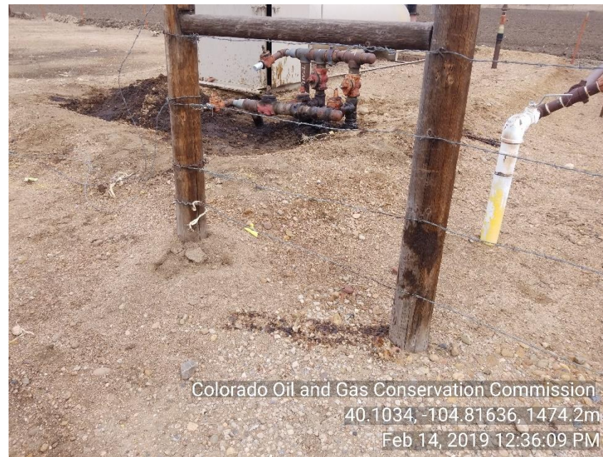
Photo 8 Stained soil in front of separator