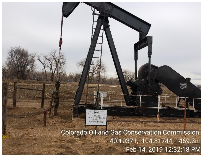
Colorado Oil and Gas Conservation Commission 40.10371, -104.81744, 1469.3m Feb 14, 2019 12:32:18 PM