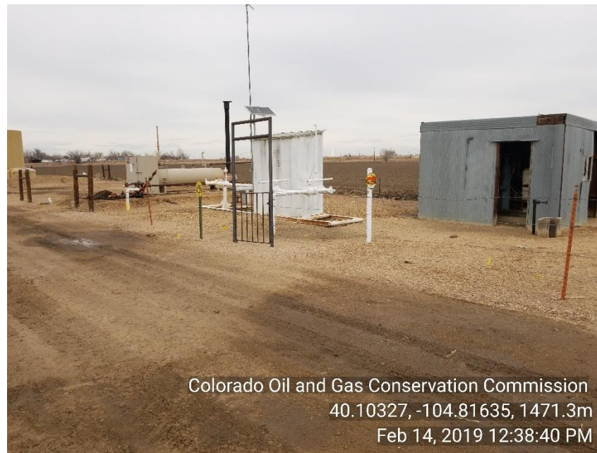
Photo 13 Unused equipment

Colorado Oil and Gas Conservation Commission 40.10327, -104.81635, 1471.3m Feb 14, 2019 12:38:40 PM