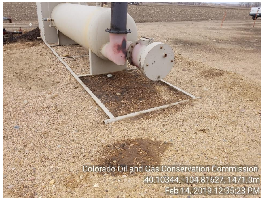
Photo 6 Stained soil horizontal separator