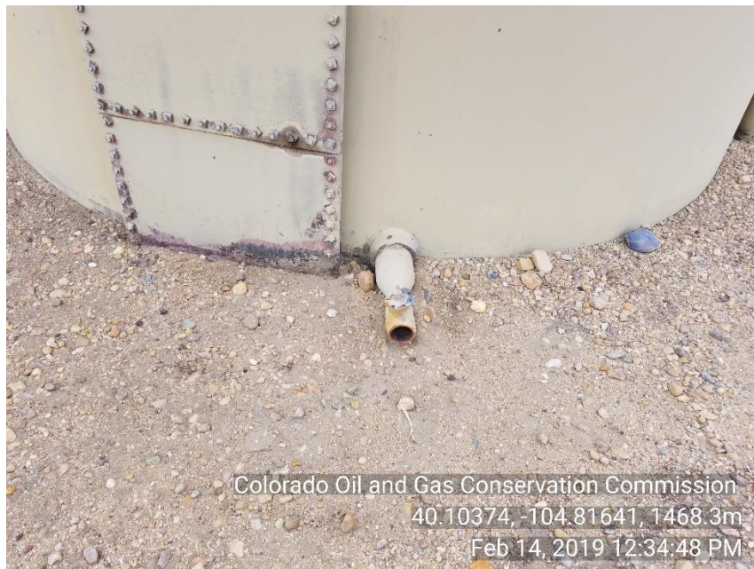
Photo 5 no bull plug crude oil tank load line