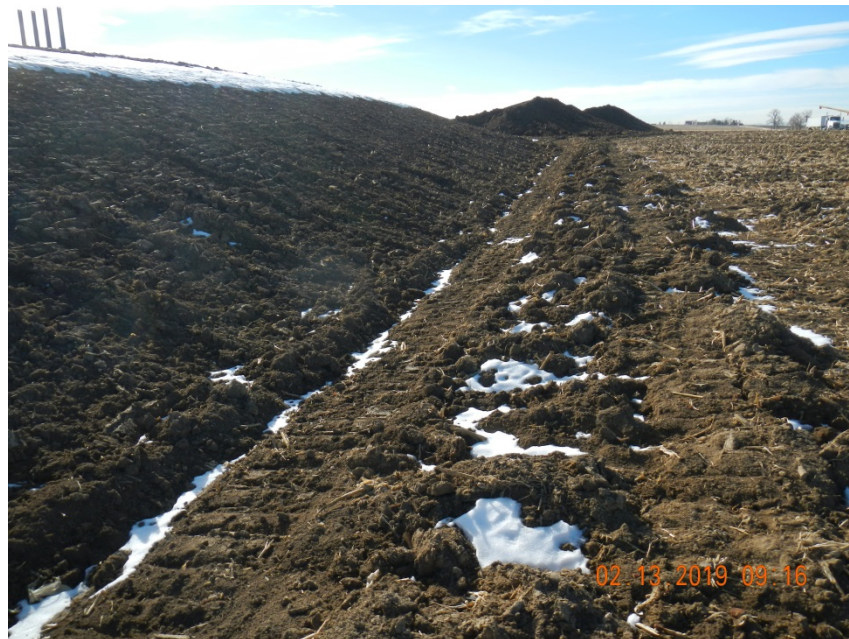
Photo 4. Photo taken from northwestern perimeter of the location, facing South. See comments from Photo 3.