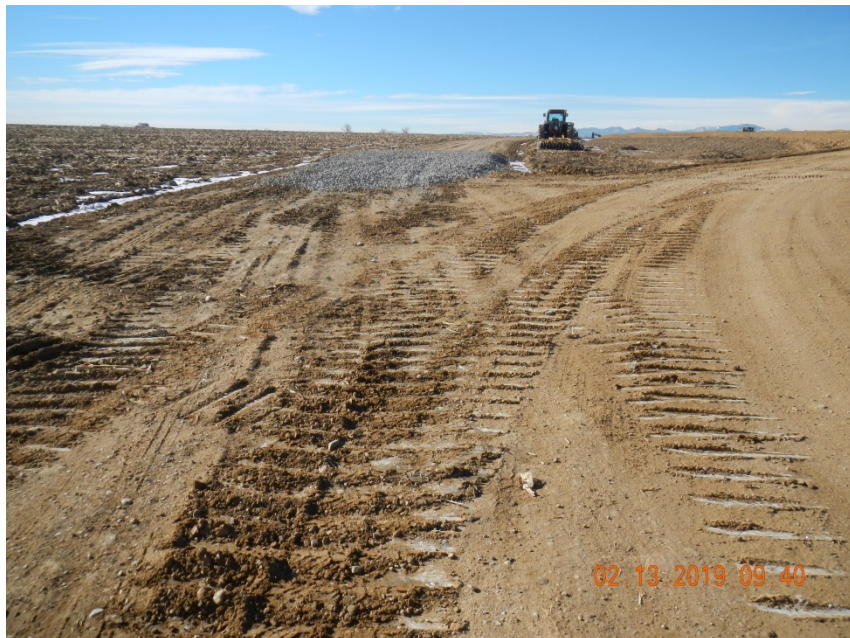
Photo 7. Photo taken from the access road looking Northwest into a new temporary access road built for the unpermitted area and the flowline work to the south. See comments from Photo 1.