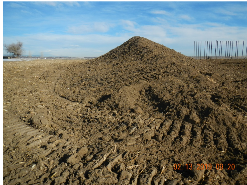
Photo 6. Photo taken from southwestern perimeter of the unpermitted disturbance area, facing North. See comment from Photo 5.