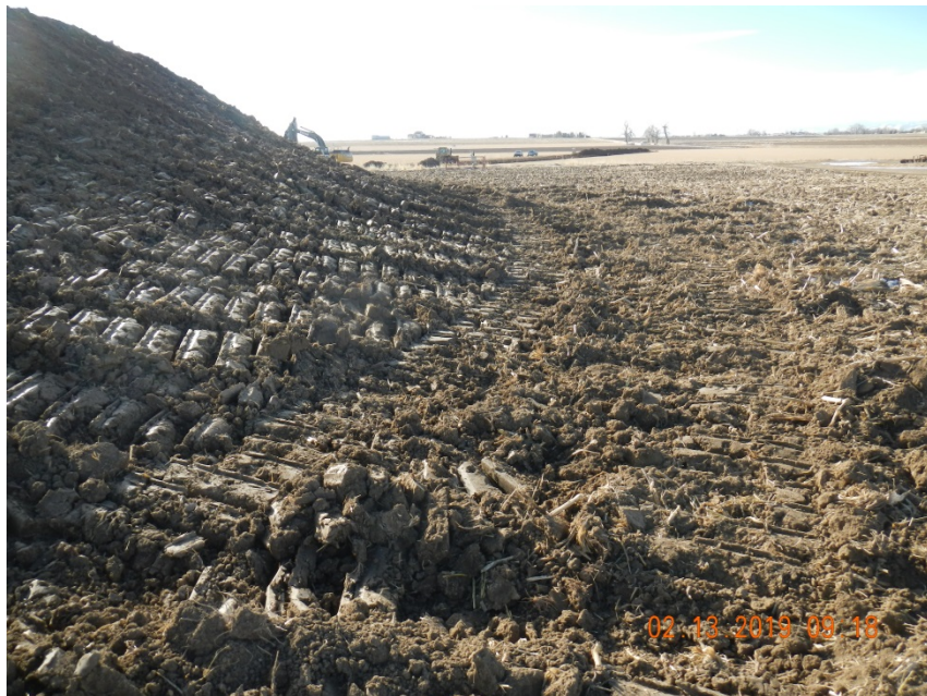
Photo 5. Photo taken from western perimeter of the unpermitted disturbance area, facing South. Stormwater BMPs have not been installed around the entire perimeter of the new unpermitted disturbance area.