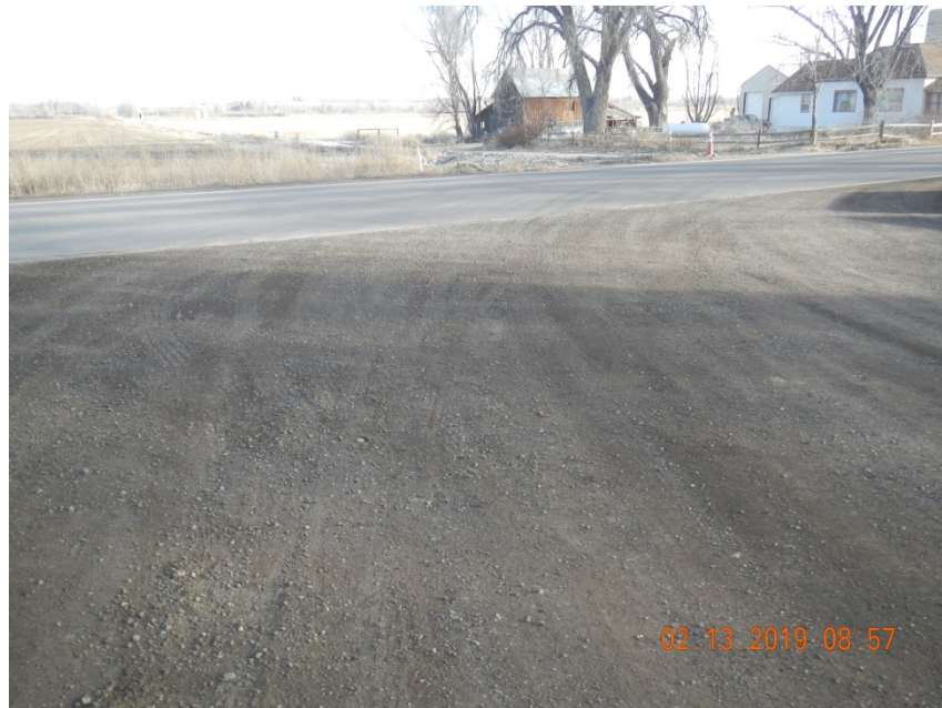
Photo 2. Photo taken from the entrance of the location off CR 20.5, facing North. See comments from Photo 1.