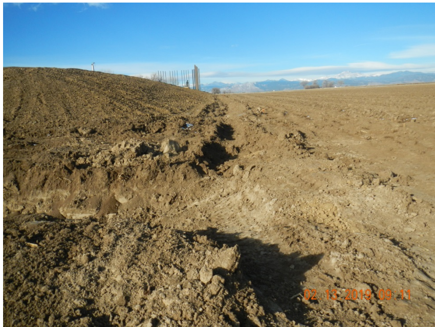
Photo 3. Photo taken from northeastern perimeter of the location, facing West. Photo illustrates the ditch and berm BMP that has been installed around the perimeter of the location. Appears the Operator is installing sediment traps with stabilized outlets around the original permitted location.