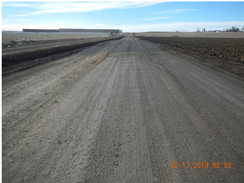
Photo 1. Photo taken from the access road near the entrance of the location off CR 20.5, facing South. Operator has installed a track pad and gravel potentially to limit tracking onto the county road.