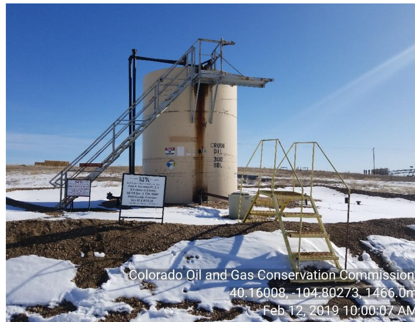
Photo 2 TNK BTRY