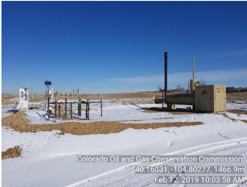
Photo 13 Sep and meter run pic