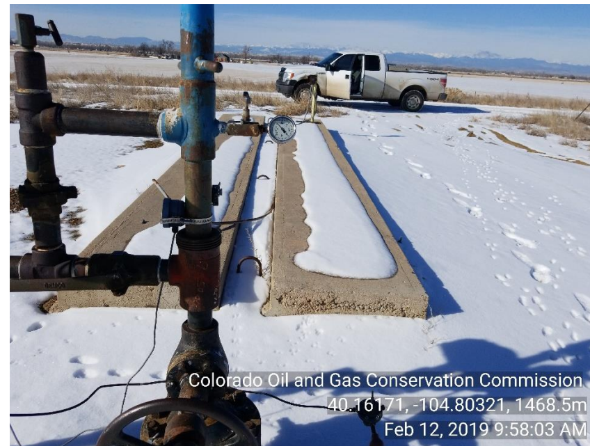
Photo 4 Unused equipment cement PU pad