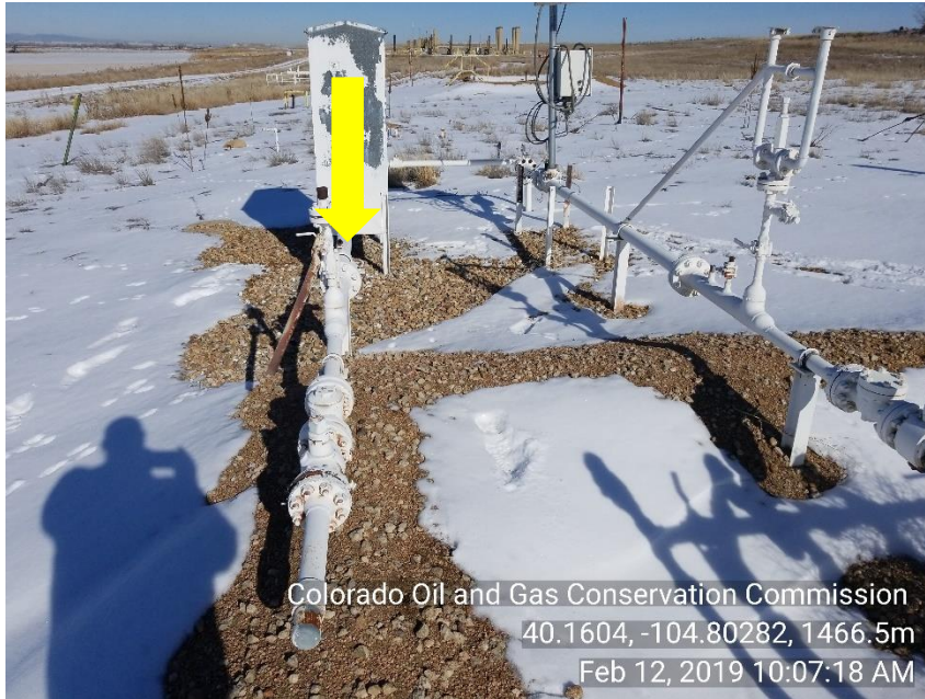
Photo 15 Unused equipment unused meter run