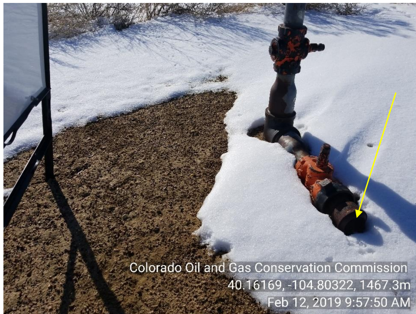
Photo 3 Unmarked riser not plugged or LOTO