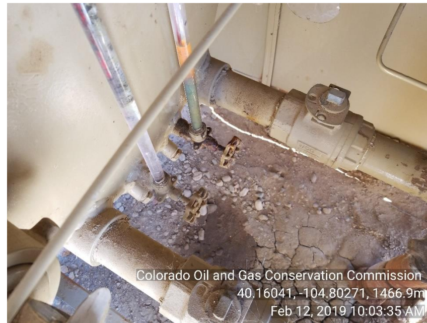
Photo 12 Leaking VLV on sight glass and stained soil inside SEP