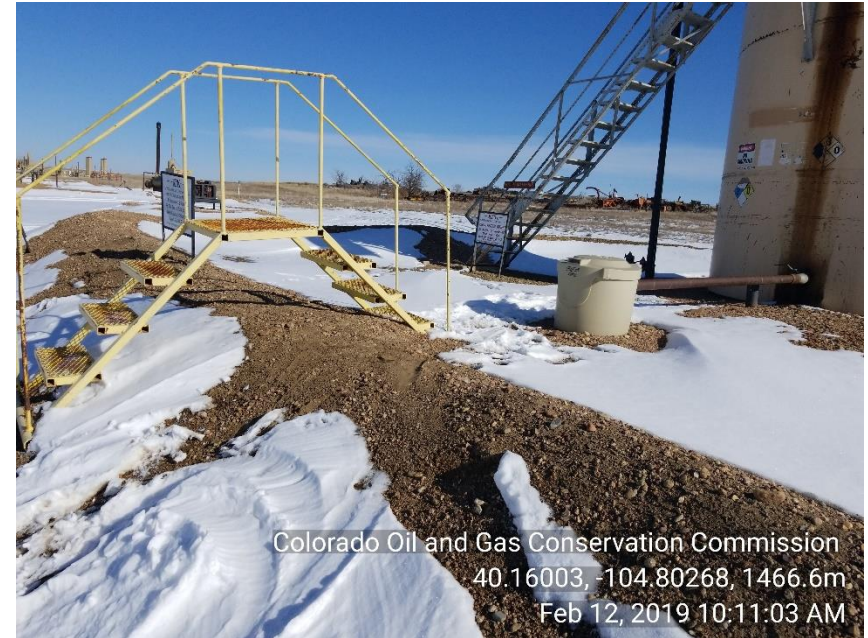
Photo 16 berms inadequate