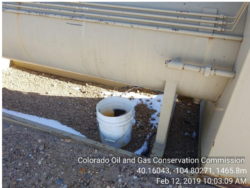
Photo 11 TRASH bucket with trash under sep