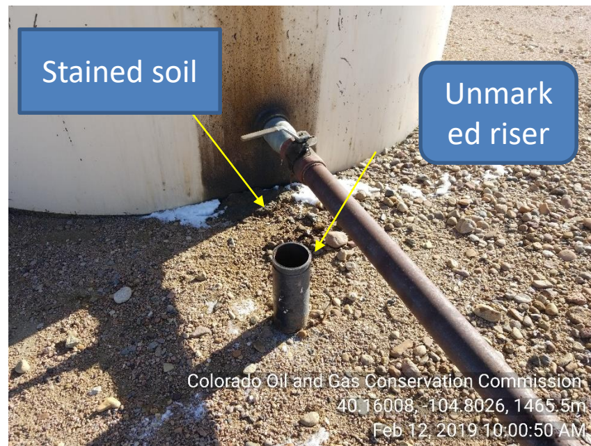
Photo 6 Stained soil. Unmarked riser not plugged or LOTO