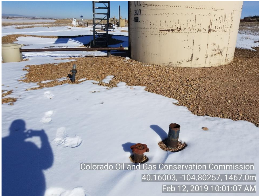
Photo 7 Unmarked riser's not plugged or LOTO