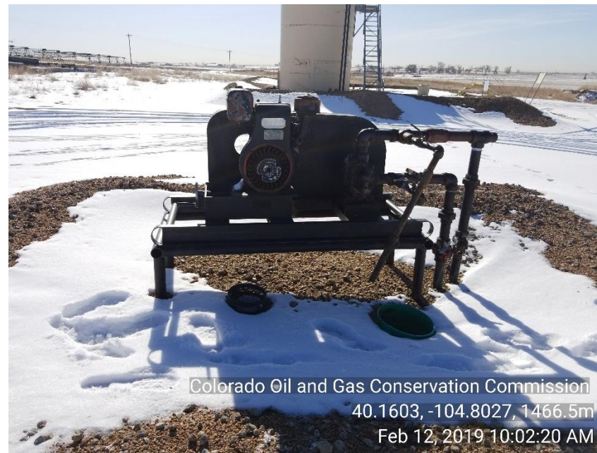
Photo 10 unused equipment