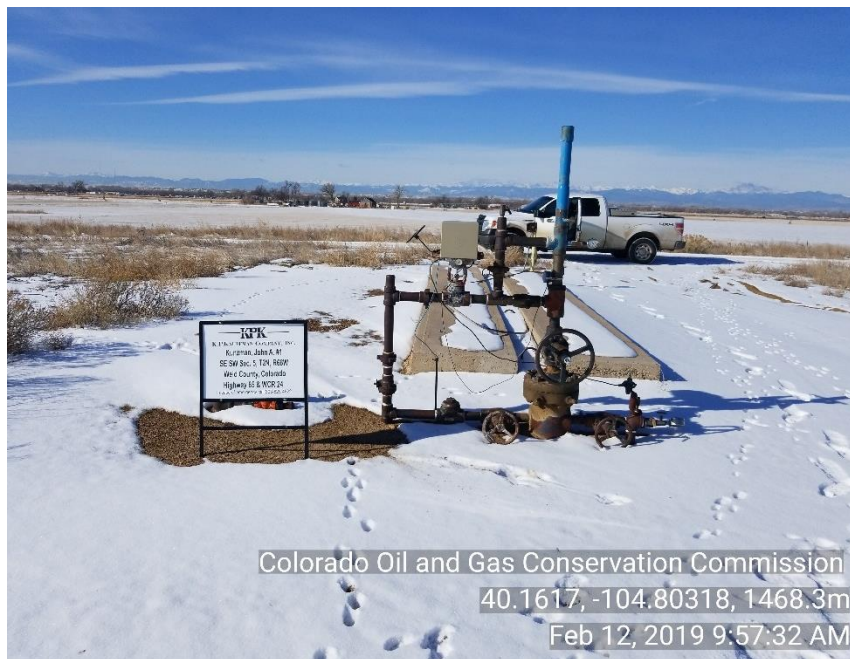
Photo 1 WH