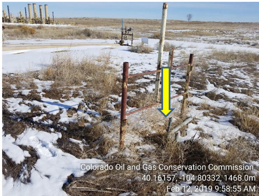
Photo 5 Unmarked riser not plugged or LOTO