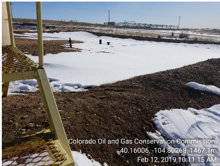
Photo 17 Berms inadequate