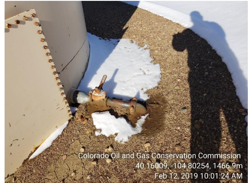
Photo 8 Stained soil in back of crude oil tank