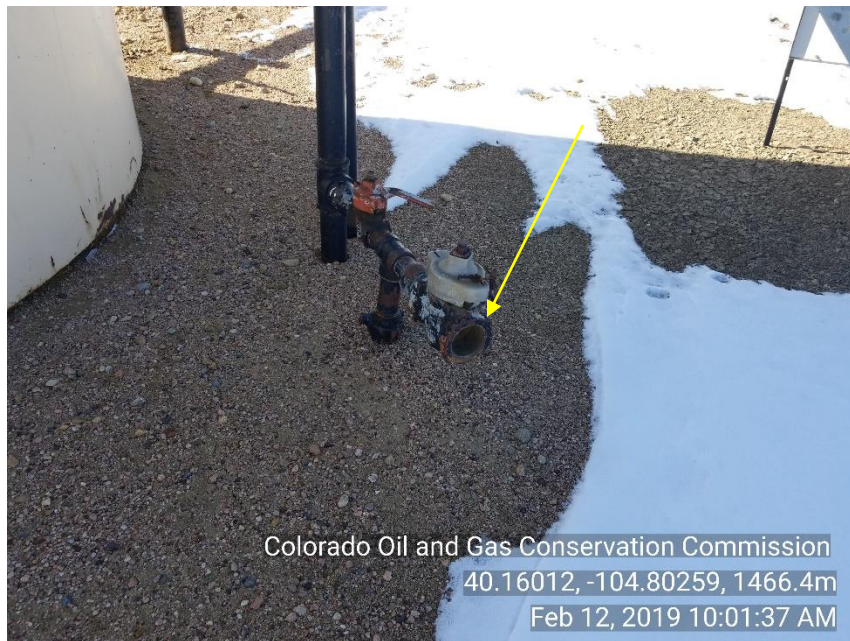
Photo 9 Load line to crude oil tank not bull plugged