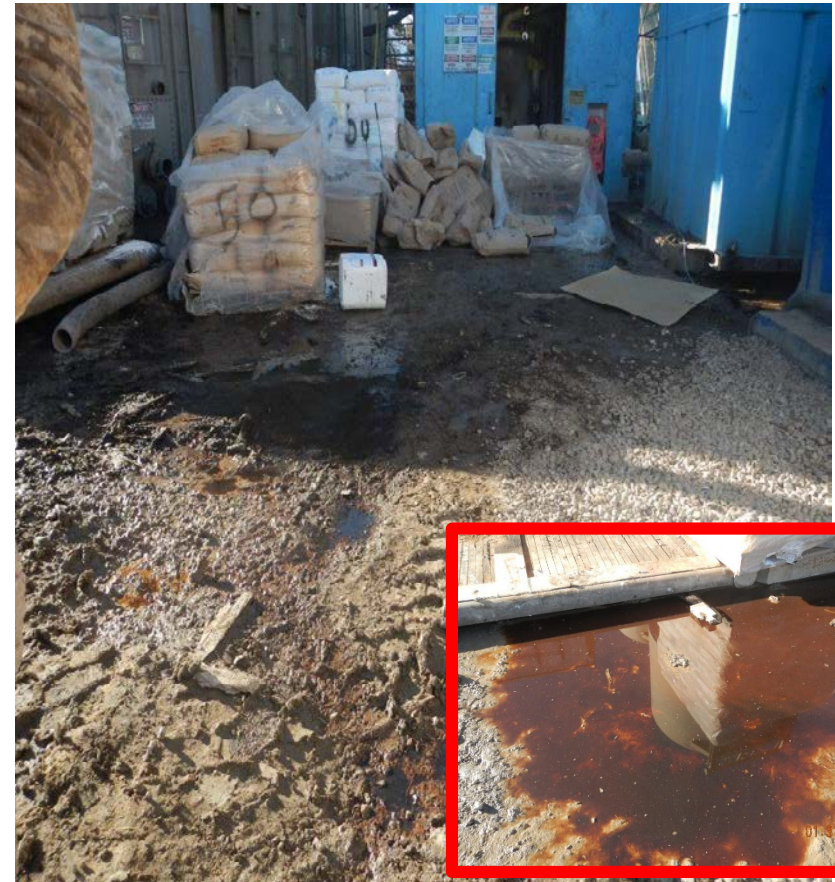
Photo#8: Material handling & Spill Prevention addressed in Environmental Inspection.