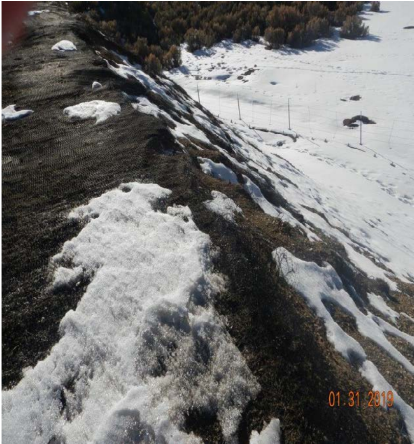
Photo#6: Vegetation establishment on slopes is largely unsuccessful. Netting has become Debris.