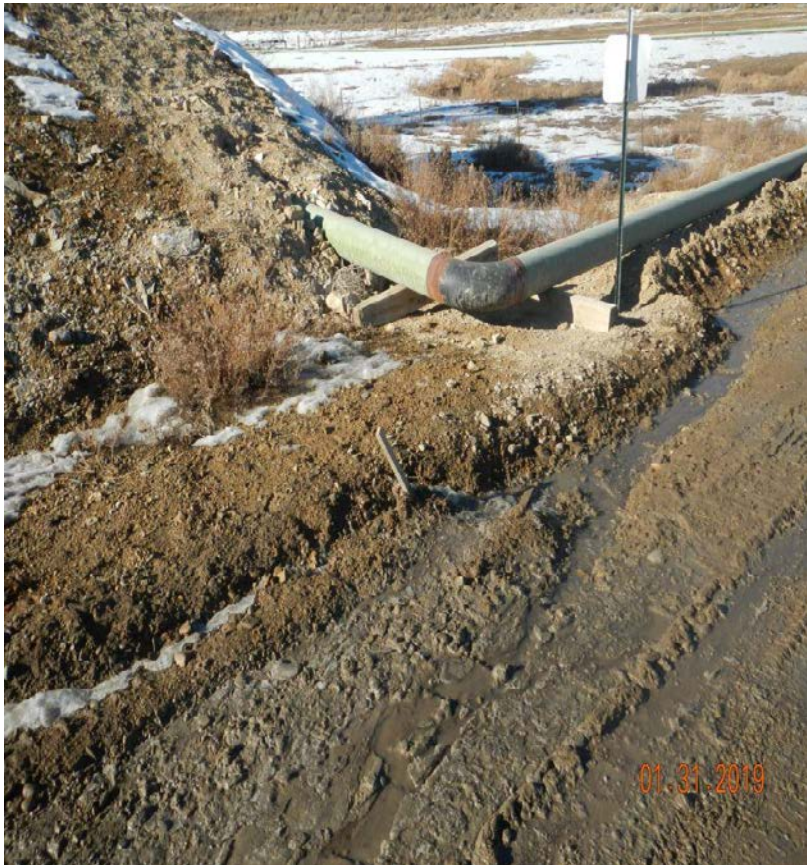
Photo#2: West Access road ditch from point where it exits location.