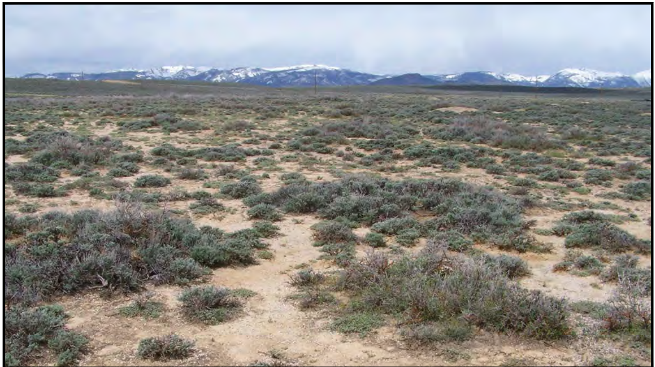
PHOTO: VIEW OF REFERENCE AREA