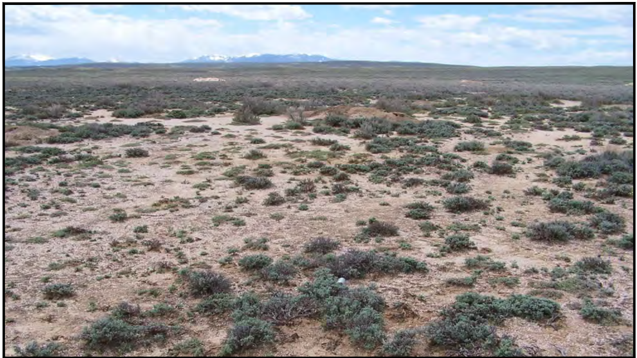
PHOTO: VIEW OF REFERENCE AREA