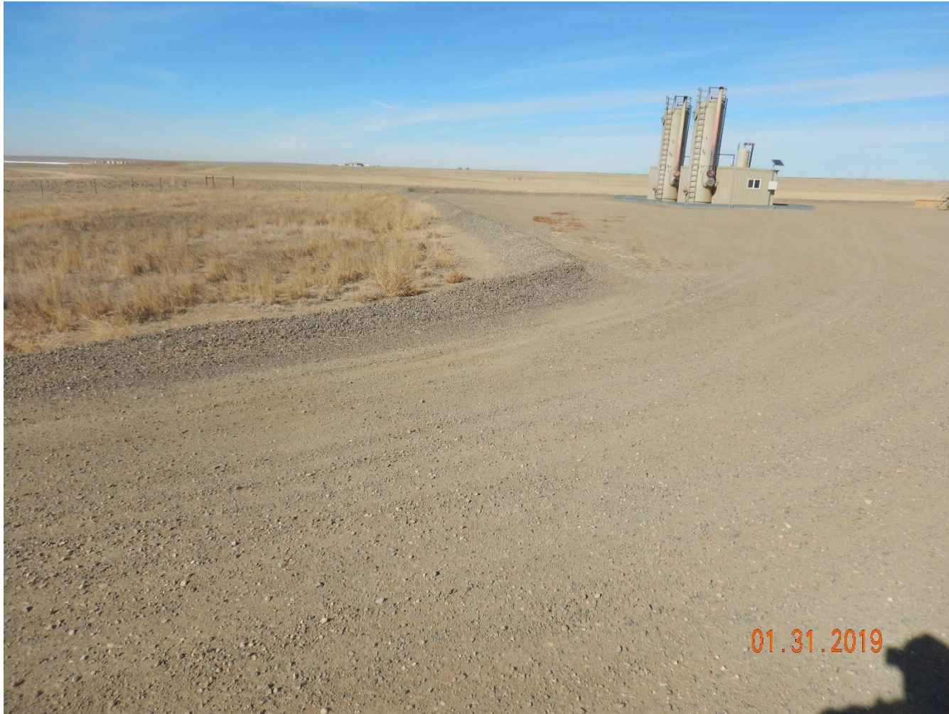
Photo 2: Photo taken from the south end of the location, facing west. Photos 2- 5 provide and overview of the location from west, northwest, northeast to east. Photos also show interim reclamation has not been conducted in accordance with COGCC rule 1003.