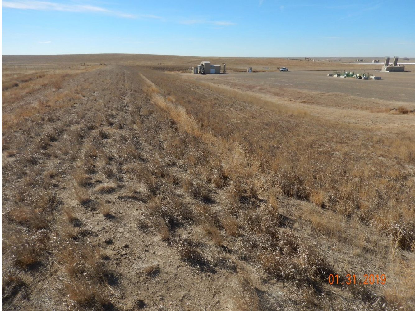
Photo 8: Photo taken from the northeast corner of the location, facing south. Photo shows interim reclamation has not been conducted in accordance with COGCC rule 1003