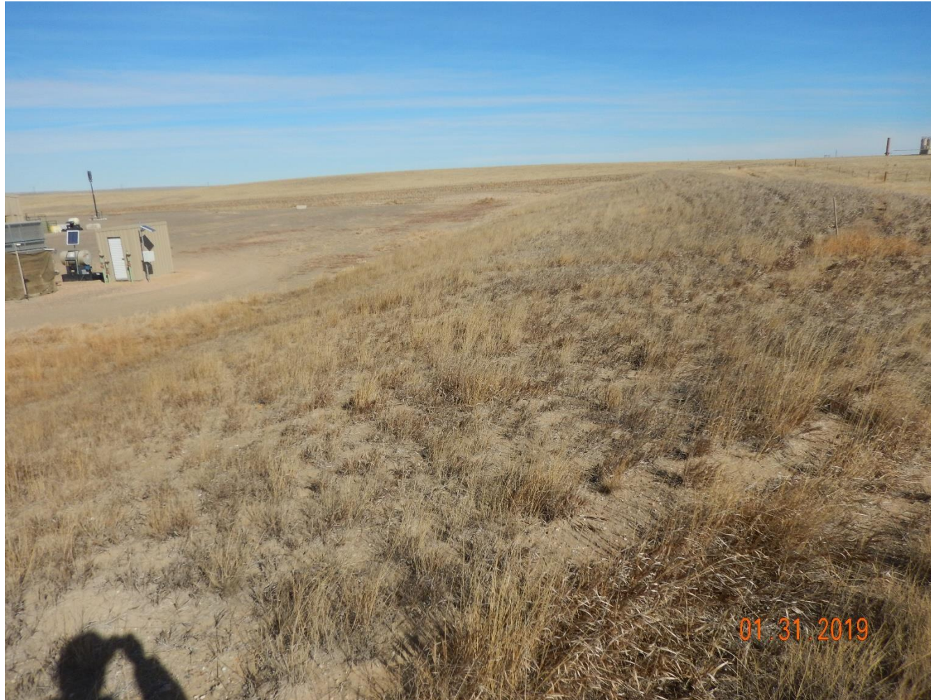
Photo 7: Photo taken from the southeast corner of the location, facing north. Photo shows interim reclamation has not been conducted in accordance with COGCC rule 1003