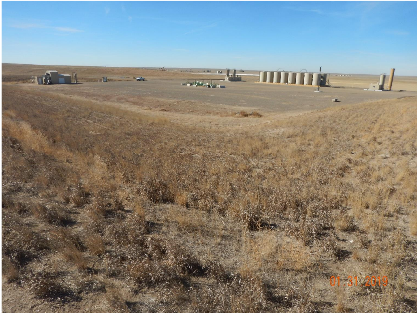
Photo 9: Photo taken from the northeast corner of the location, facing southwest. Photo shows interim reclamation has not been conducted in accordance with COGCC rule 1003