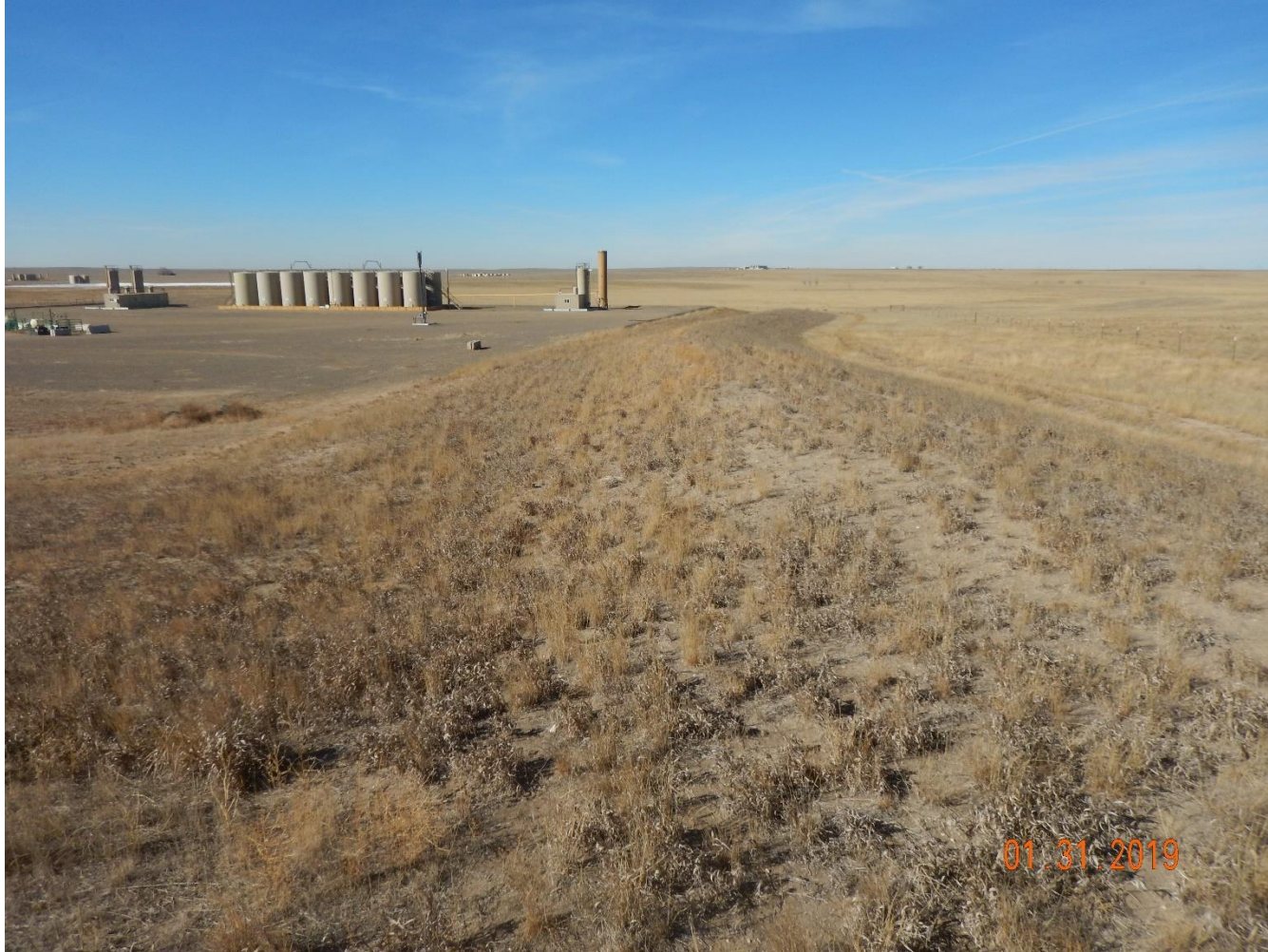
Photo 10: Photo taken from the northeast corner of the location, facing west. Photo shows interim reclamation has not been conducted in accordance with COGCC rule 1003