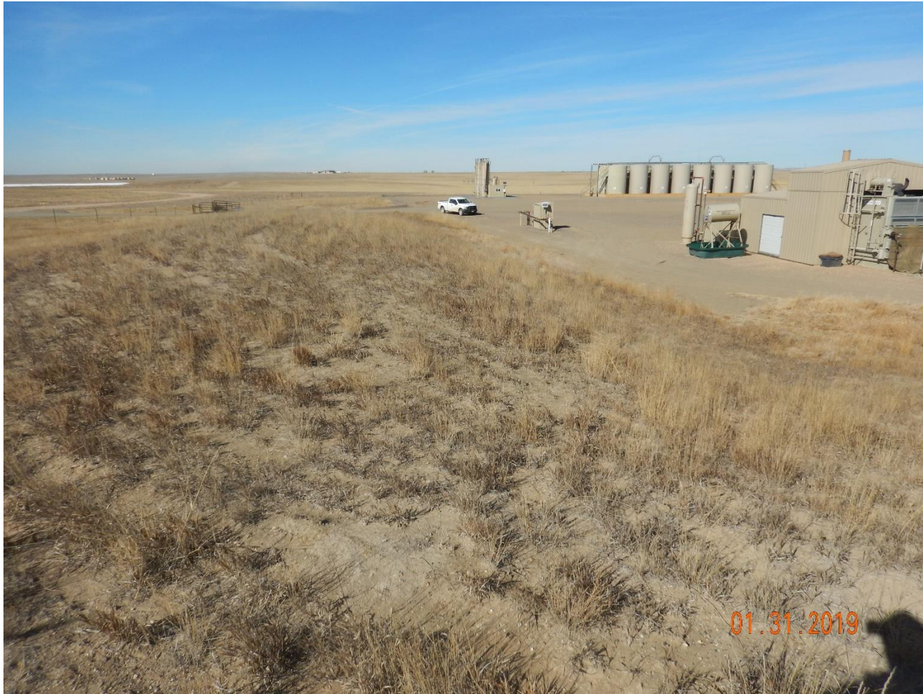
Photo 6: Photo taken from the southeast corner of the location, facing northwest. Photo shows interim reclamation has not been conducted in accordance with COGCC rule 1003