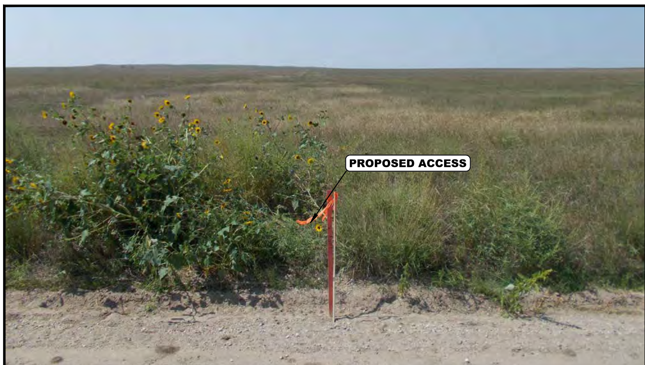
PHOTO: VIEW FROM BEGINNING OF PROPOSED ACCESS FOR CASTOR 7-59 11 PAD