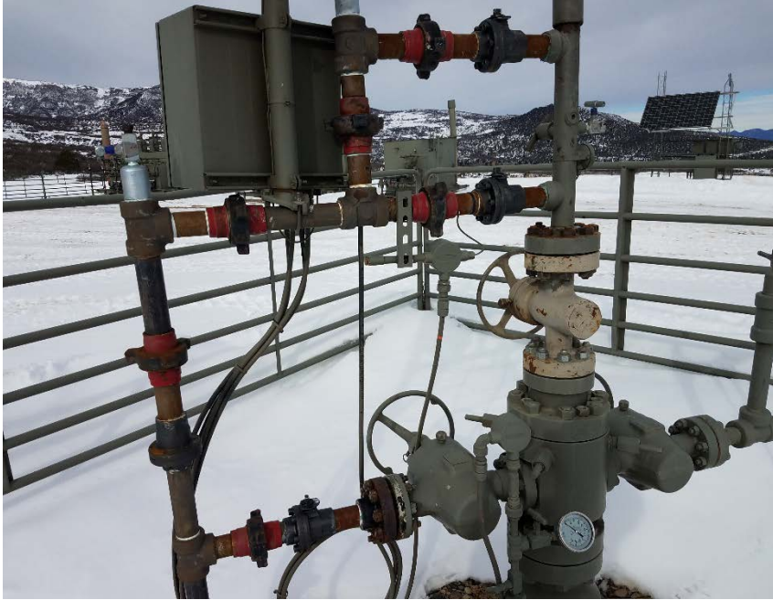
Location Photo #3, Missing wellhead information.