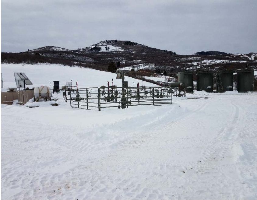
Location Photo #1