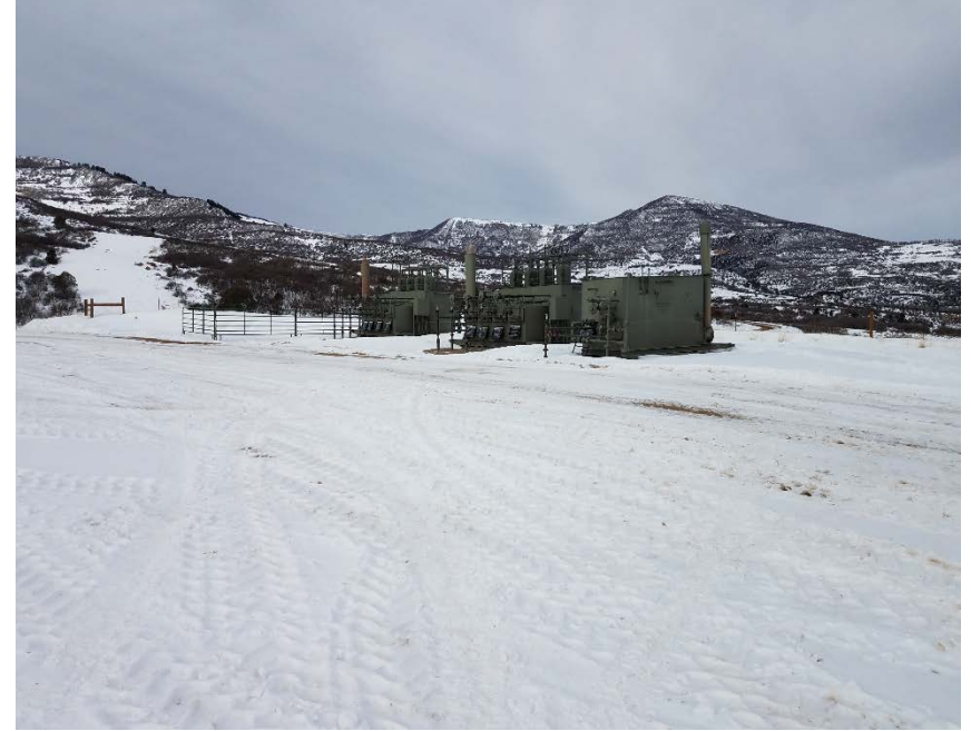
Location Photo #2