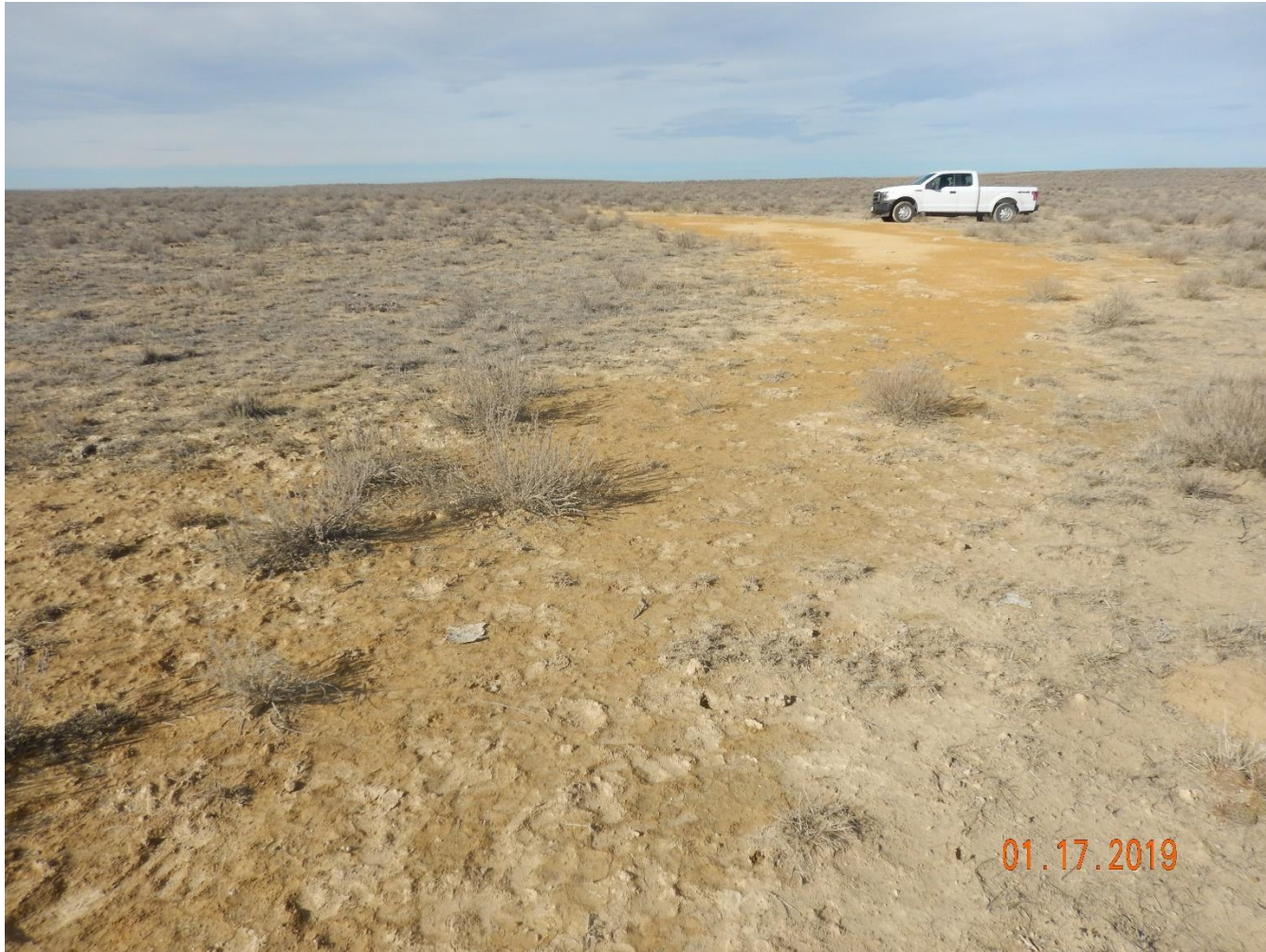
Photo 6: Photo taken from access road, facing north. Photo shows section of access road that has not achieve uniform vegetation.