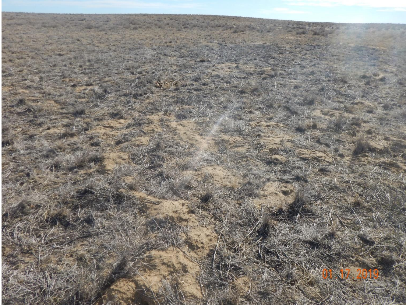
Photo 3: Photo taken from the location, facing south. Photo shows vegetation over the reclamation area.