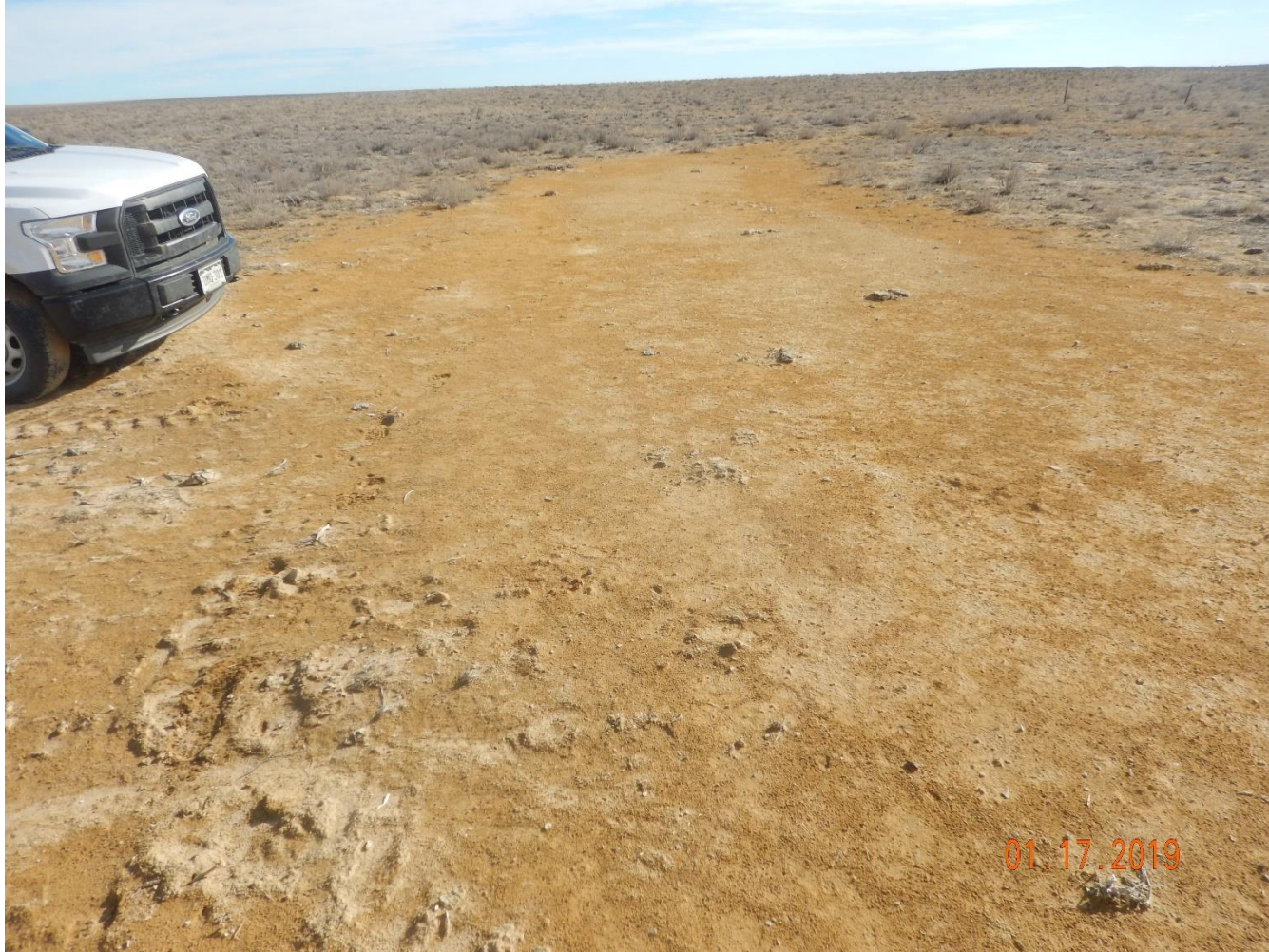
Photo 7: Photo taken from access road, facing south. Photo shows section of access road that has not achieve uniform vegetation.