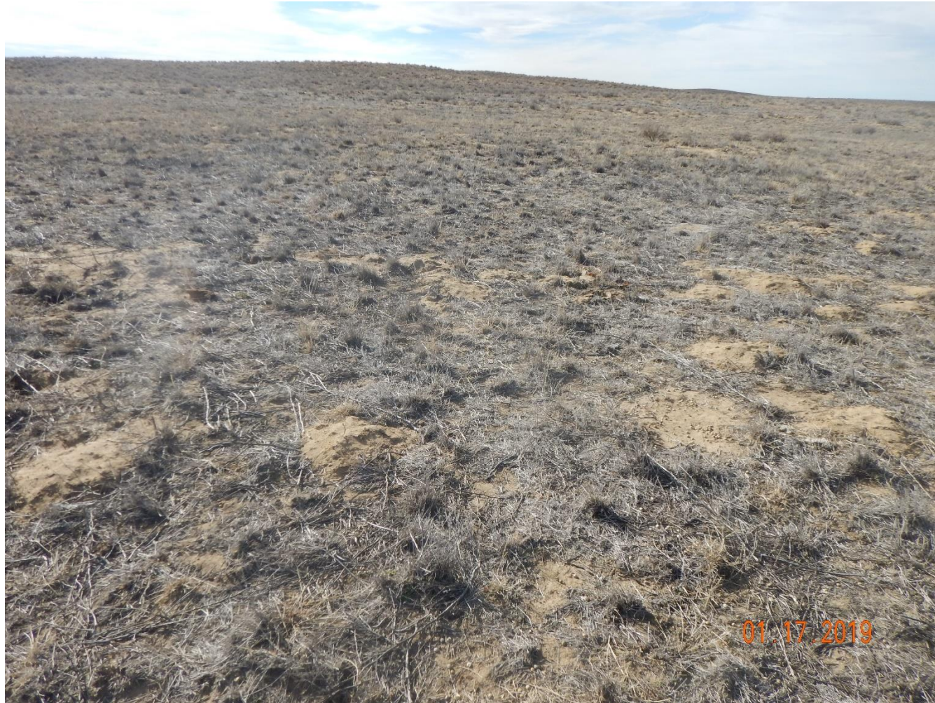
Photo 4: Photo taken from the location, facing west. Photo shows vegetation over the reclamation area.