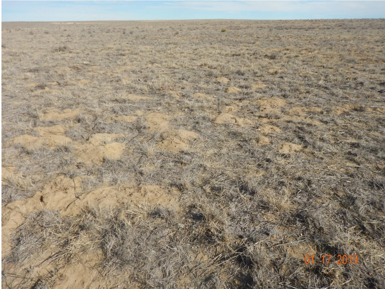
Photo 2: Photo taken from the location, facing east. Photo shows vegetation over the reclamation area.