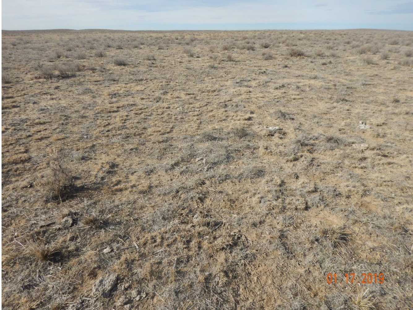
Photo 5: Photo taken from the adjacent reference area. Photo shows reference area vegetation.