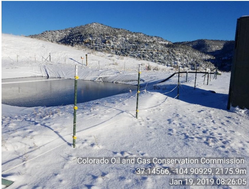
Photo 3 Electric fence in disrepair