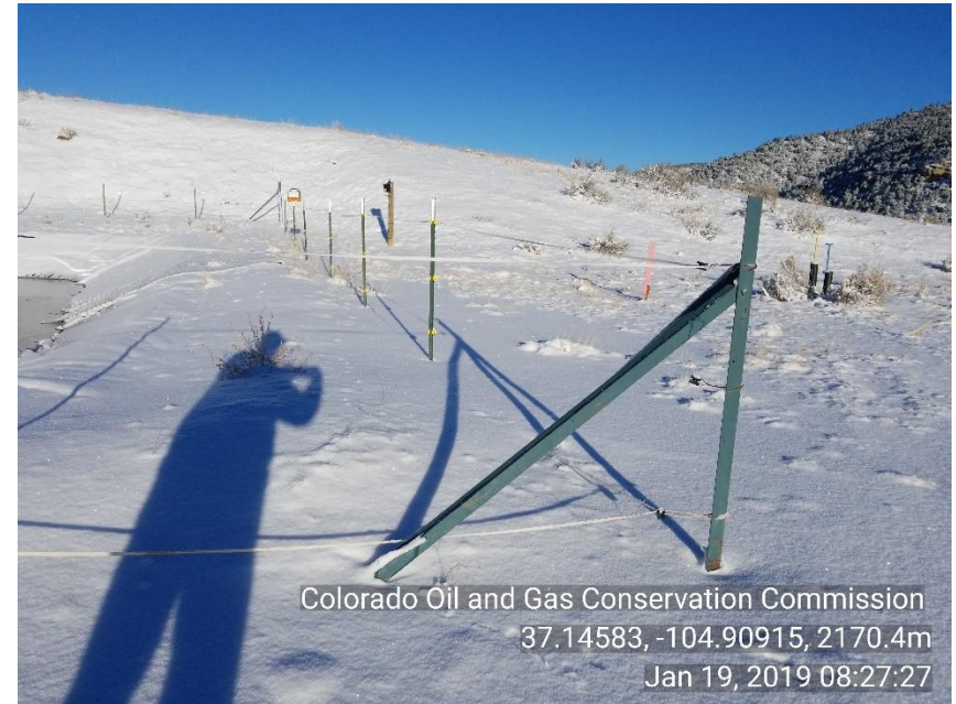
Photo 4 electric fence in disrepair