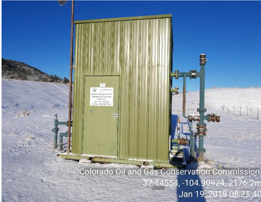
Colorado Oil and Gas Conservation Commission 37.14554, -104.90924, 2176.2m Jan 19, 2019 08:25:40