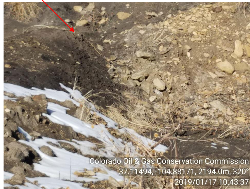
PHOTO 6: BERM AROUND PIT ON SOUTH WEST CORNER HAS BEEN BREACHED AND STORM RUNOFF IS ABLE TO ENTER PRODUCTION PIT.