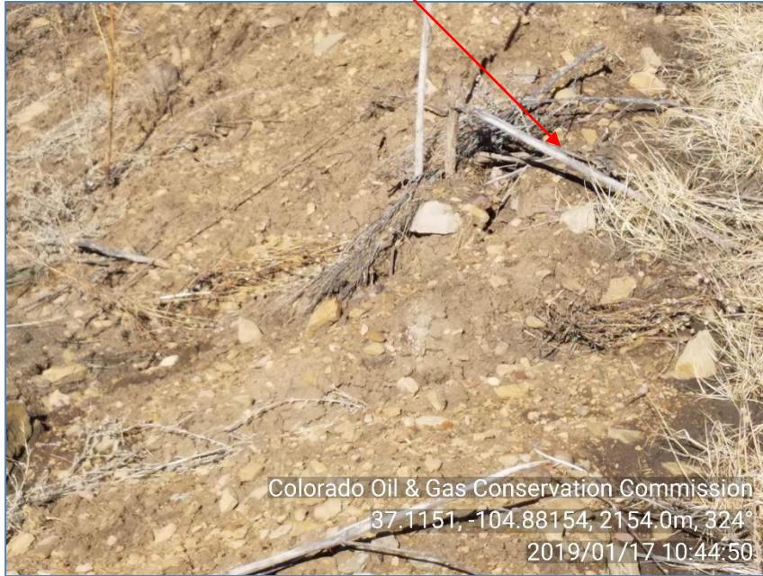
PHOTO 7: BERM AROUND PIT ON NORTH SIDE OF PIT HAS BEEN BREACHED AND STORM RUNOFF IS ABLE TO ENTER PRODUCTION PIT.