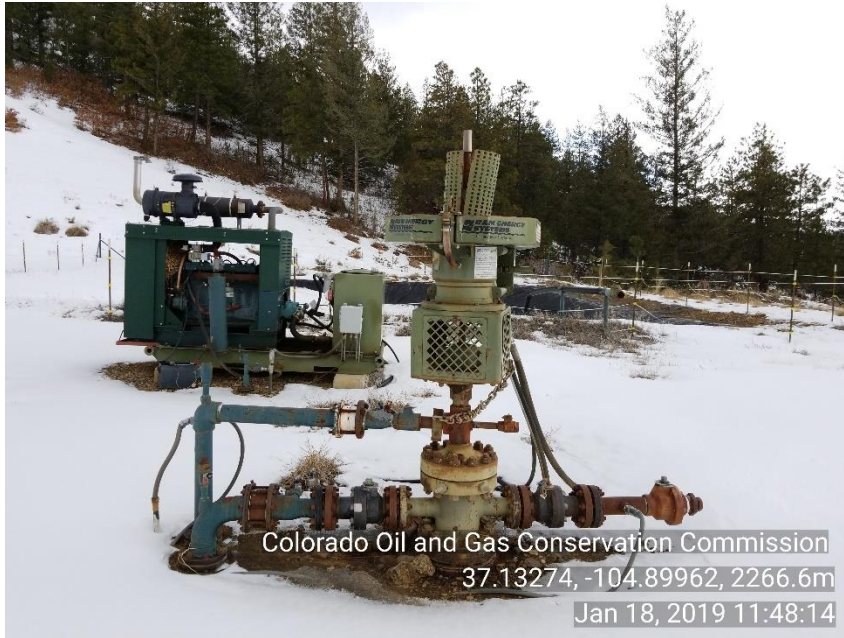
Photo 7 WH and motor skid