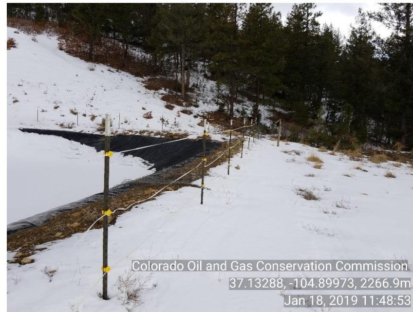
Photo 6 electric fence around lined pit in disrepair