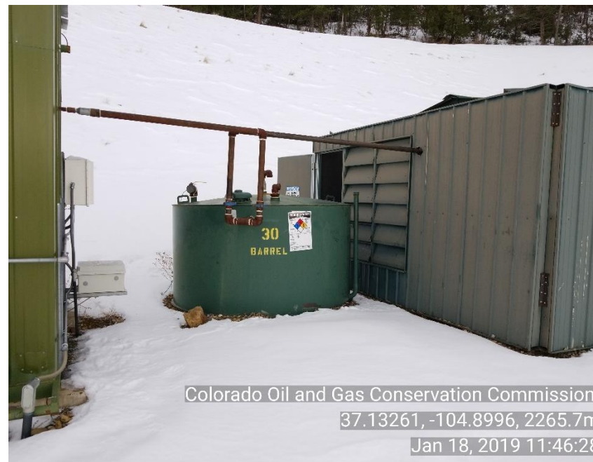
Photo 2 sound walls for liquid ring compressor and 30 BBL production tank