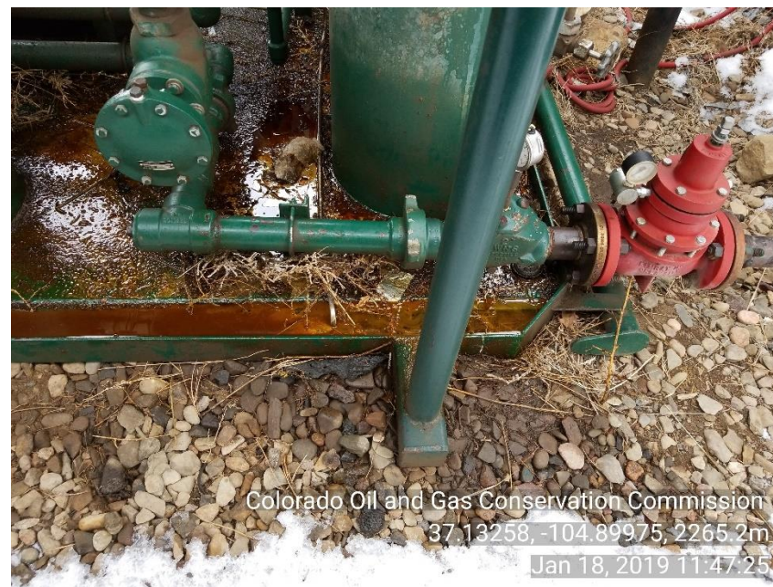
Photo 4 Stained soil and fluid dripping out of liquid ring skid