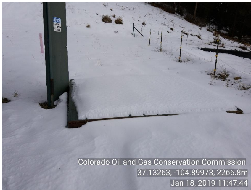
Photo 5 sound wall panel laying on ground