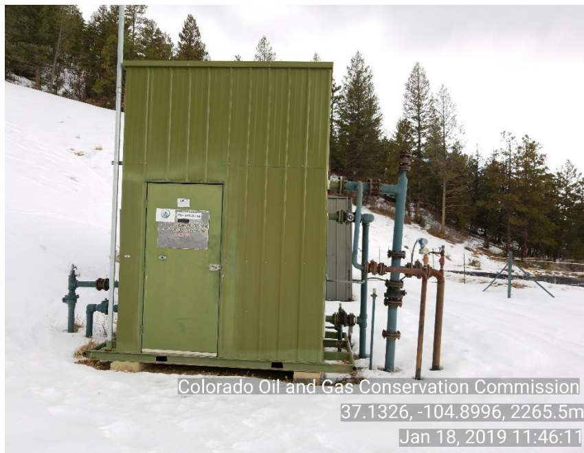
Photo 1 sep. Location sign is faded needs to be replaced