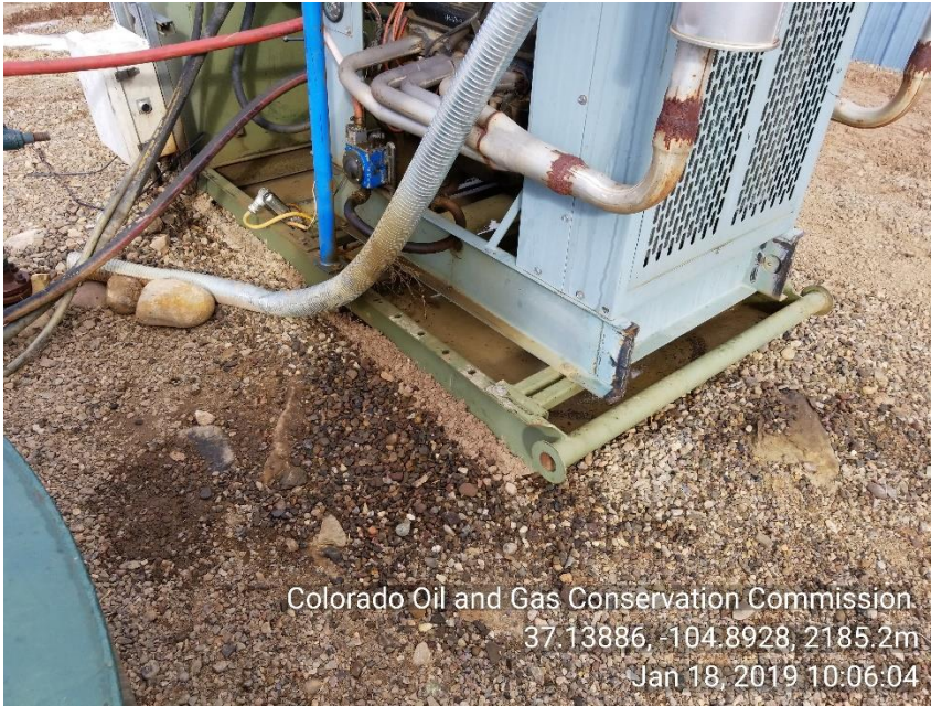
Photo 5 stained soil around HYD motor skid