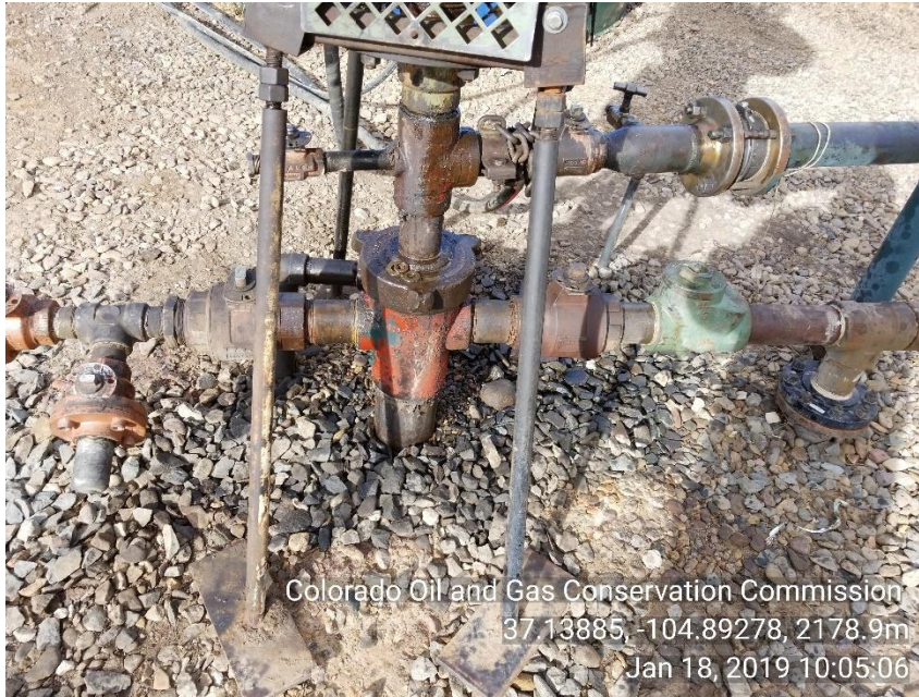
Photo 3 stained soil around WH