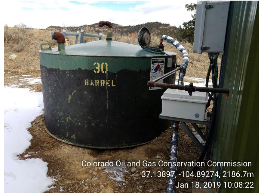
Colorado Oil and Gas Conservation Commission 37.13897, -104.89274, 2186.7m Jan 18, 2019 10:08:22