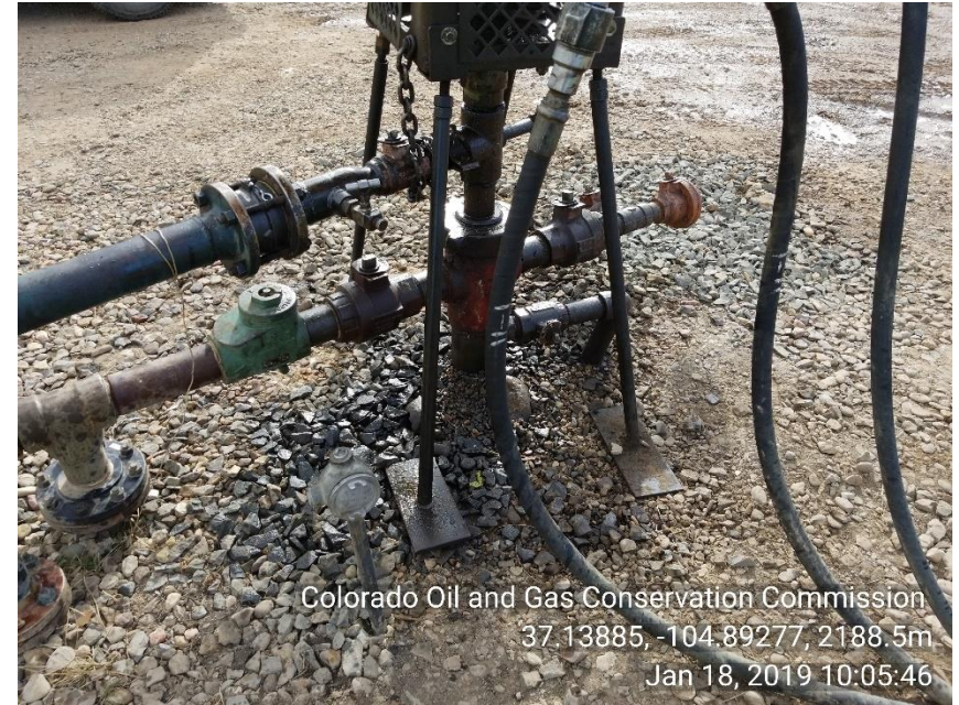
Photo 4 stained soil around WH