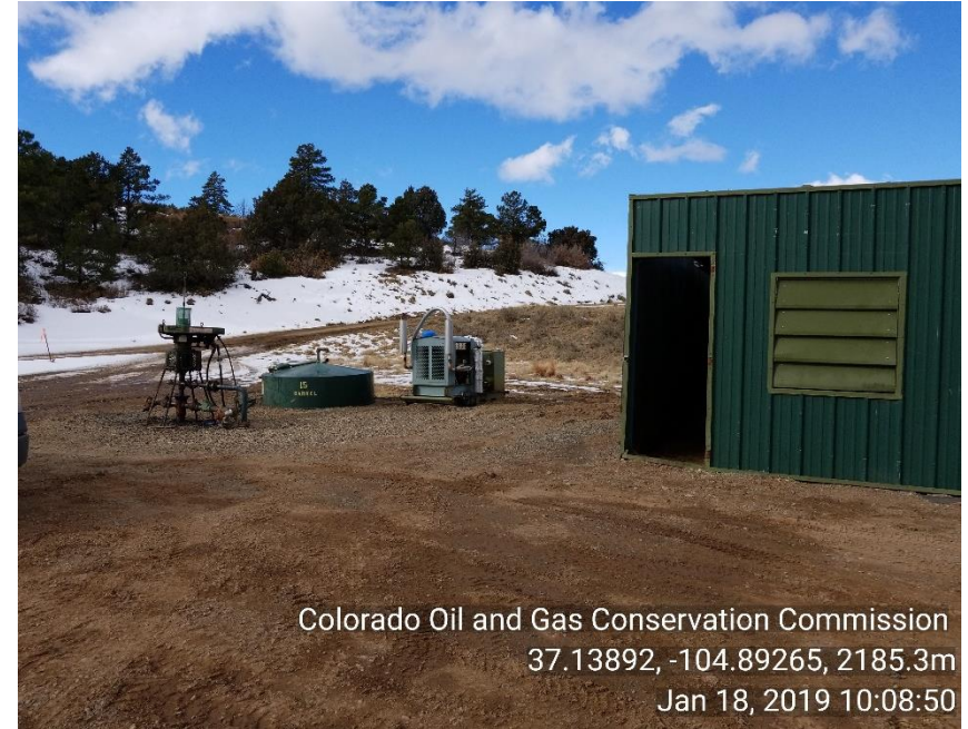
Photo 2 loc pic and unused equipment 15 BBL tank