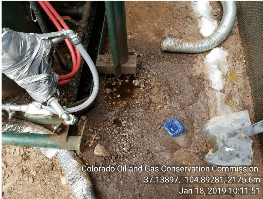
Colorado Oil and Gas Conservation Commission 37.13897, -104.89281, 2175.6m Jan 18, 2019 10:11:51