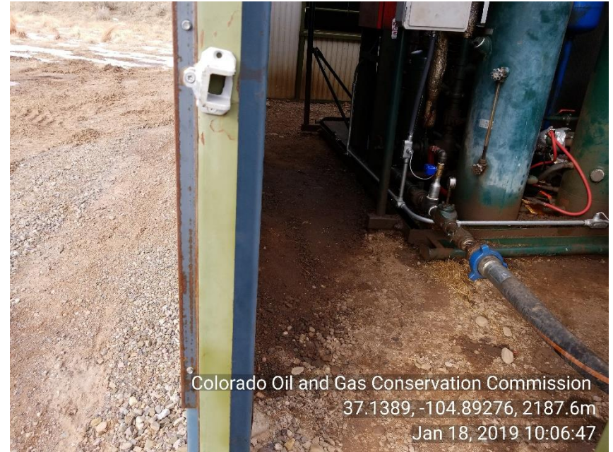
Photo 6 Stained soil around liquid ring skid