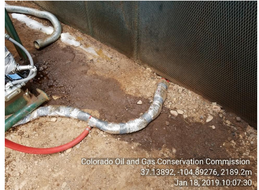
Photo 8 Stained soil around liquid ring skid