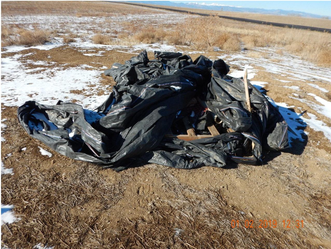
Photo 3. Photo taken from the PA well location. Operator shall remove the trash per Rule 603.f.