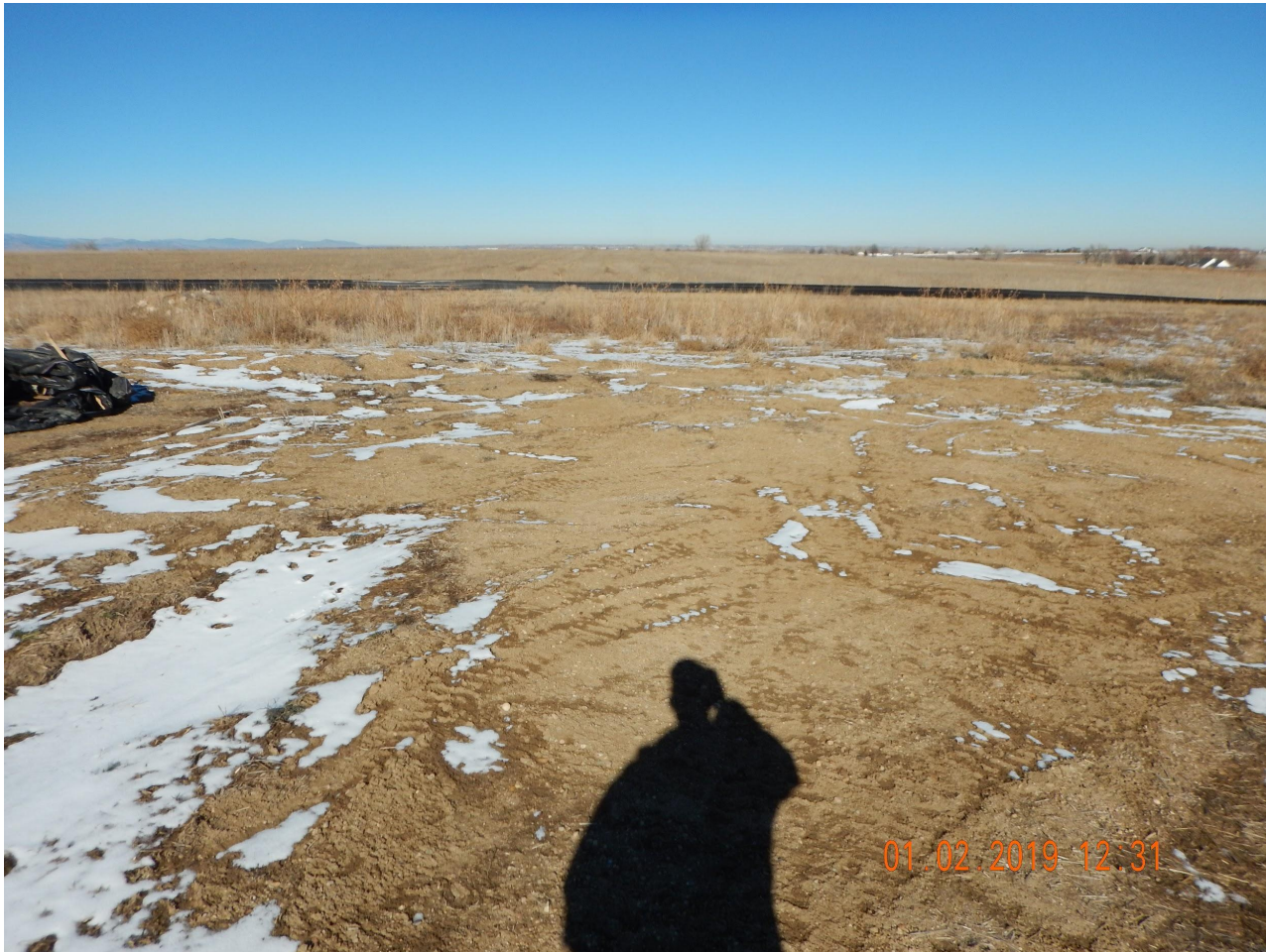
Photo 1. Photo taken from the PA well location, facing North. See comments under Photo 1.