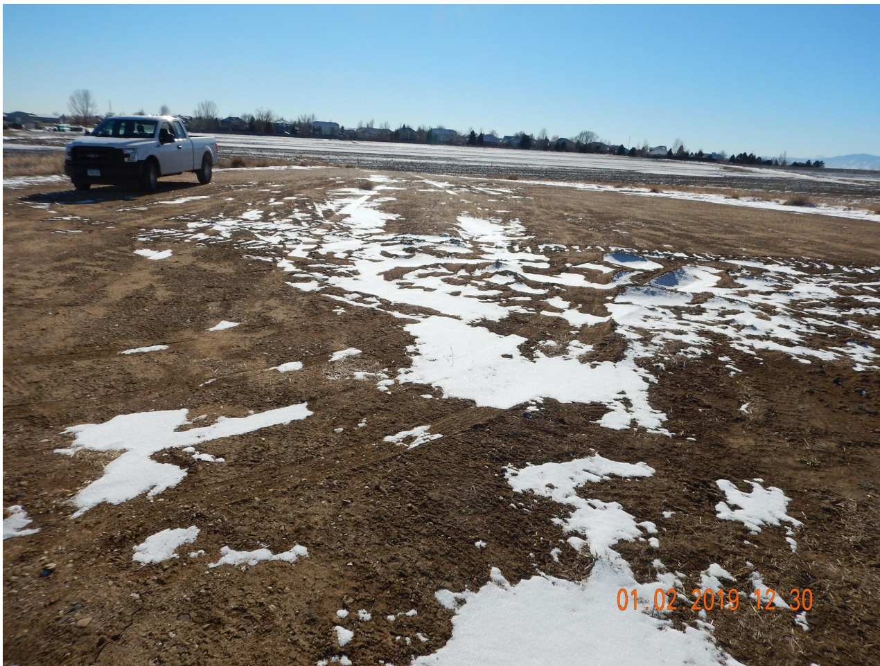
Photo 1. Photo taken from the PA well location, facing South. Operator has failed to perform final reclamation activities (i.e., remove gravel, decompaction, seedbed prep, ect.) Reference areas are cropland and appear to be planted with winter wheat.