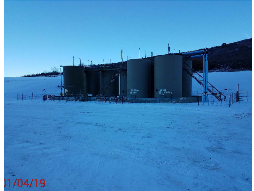
Location Photo #2