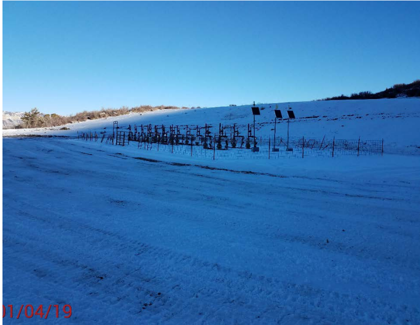
Location Photo #1