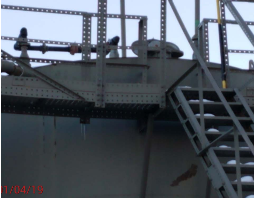
Location Photo #5, open gauge hatch