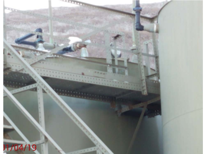
Location Photo #4 open gauge hatch.