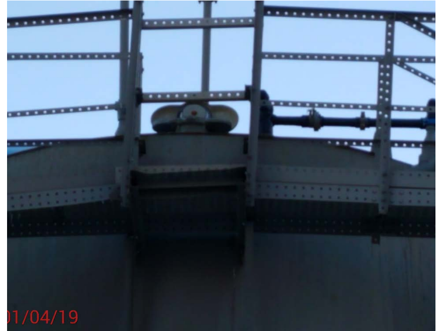
Location Photo #6, open gauge hatch