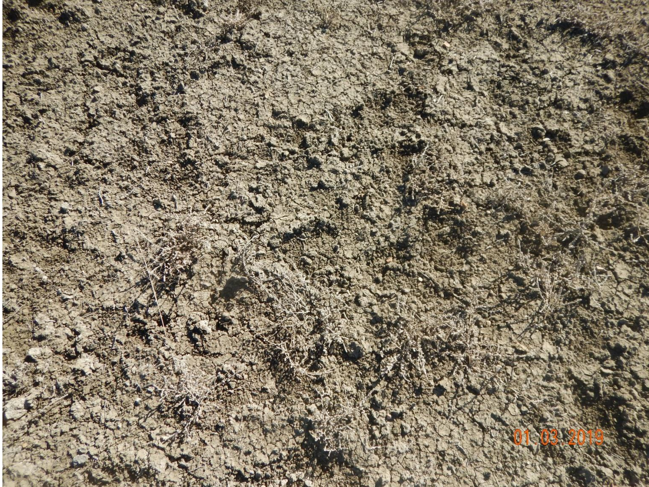
Photo 7: Photo taken from location. Photo shows location remains predominantly bare and exposed soil.