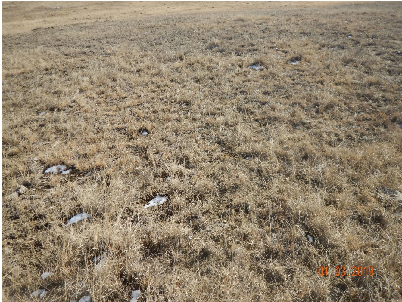
Photo 8: Photo taken from the adjacent reference area. Photo shows reference vegetation. Vegetation observed includes Blue grama, Buffalo grass, Wester wheat, Purple threeawn, sand dropseed, etc...