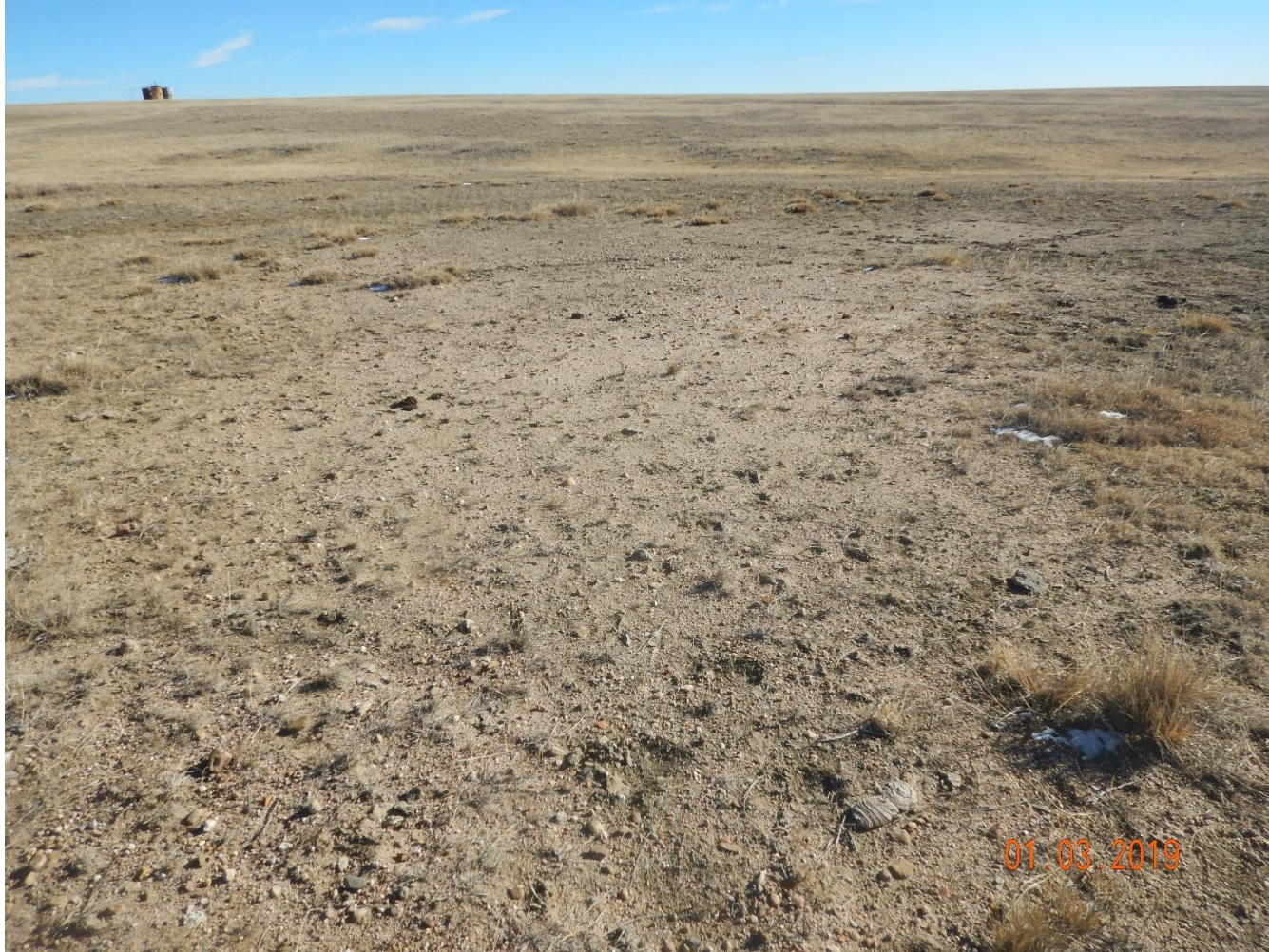
Photo 5: Photo taken from the southwest end of the location, facing east. Photo shows location remains predominantly bare and exposed soil; location does not meet reclamation requirements.