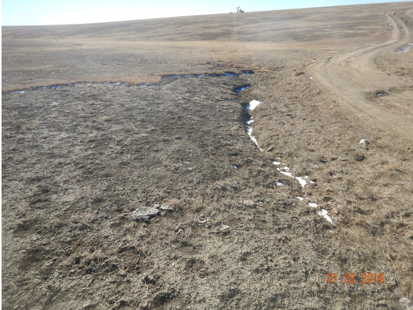
Photo 6: Photo taken from the southwest end of the location, facing southwest. Photo shows stormwater runoff from location causing erosion degradation.