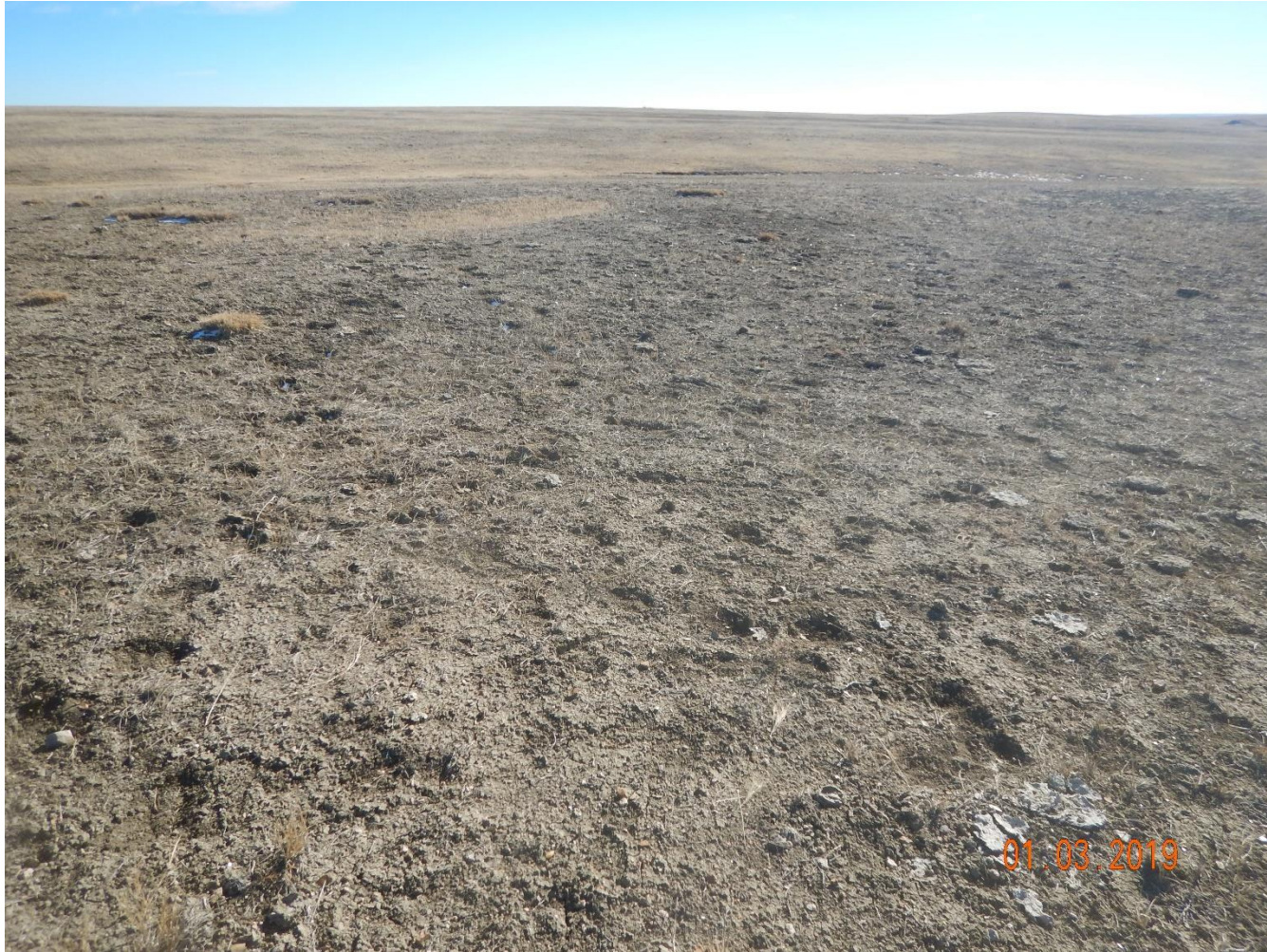
Photo 2: Photo taken from the northwest end of the location, facing south. Photo 1-3 provide an overview of the location. Photo shows location remains predominantly bare and exposed soil; location does not meet reclamation requirements.