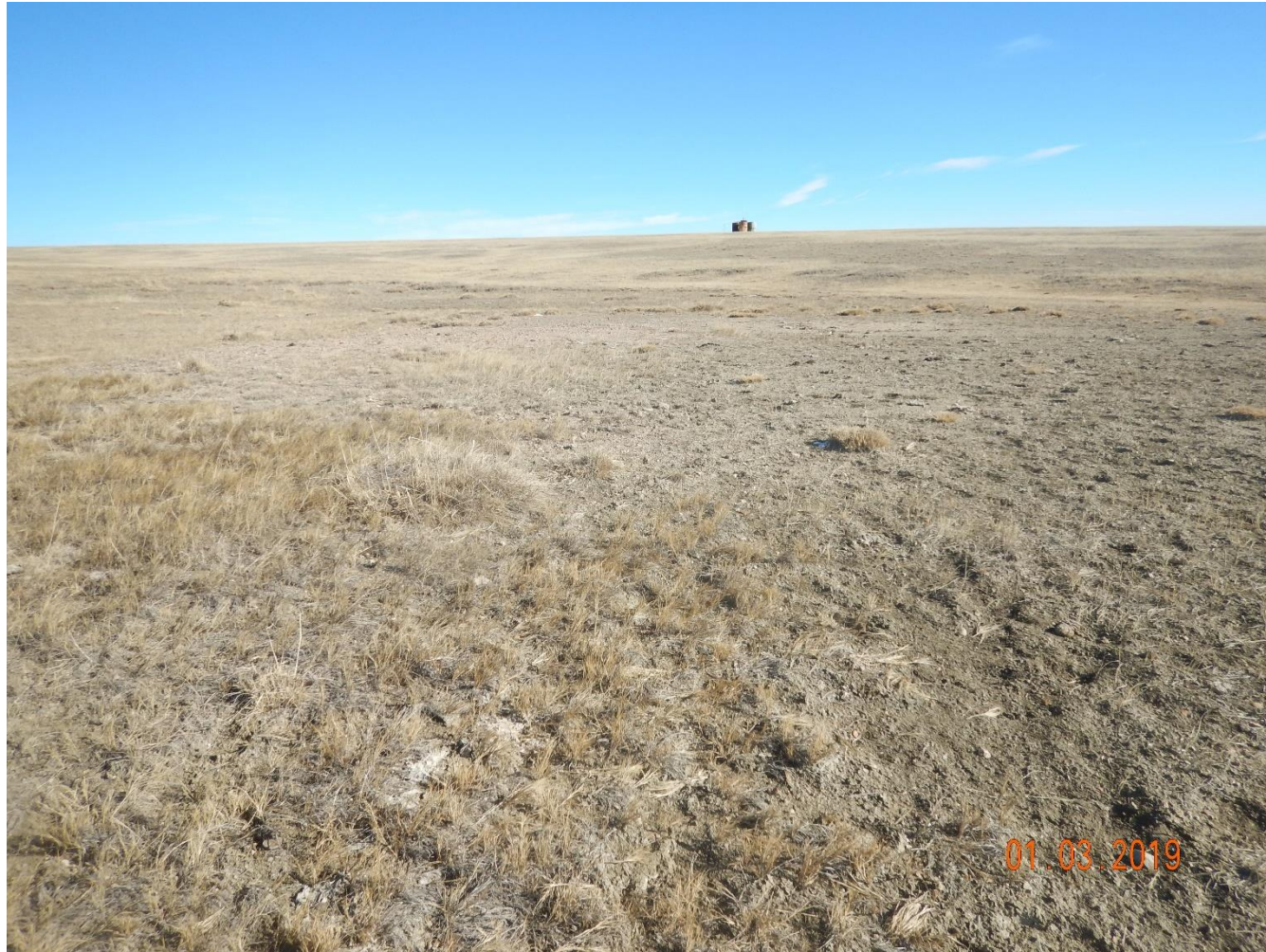
Photo 3: Photo taken from the northwest end of the location, facing east. Photo 1-3 provide an overview of the location. Photo shows location remains predominantly bare and exposed soil; location does not meet reclamation requirements.