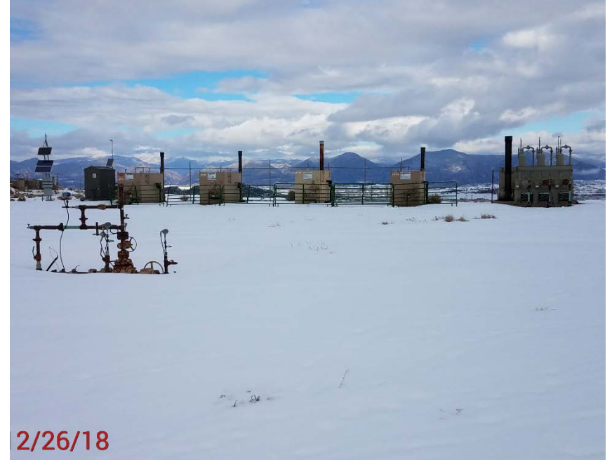
Location Photo #2