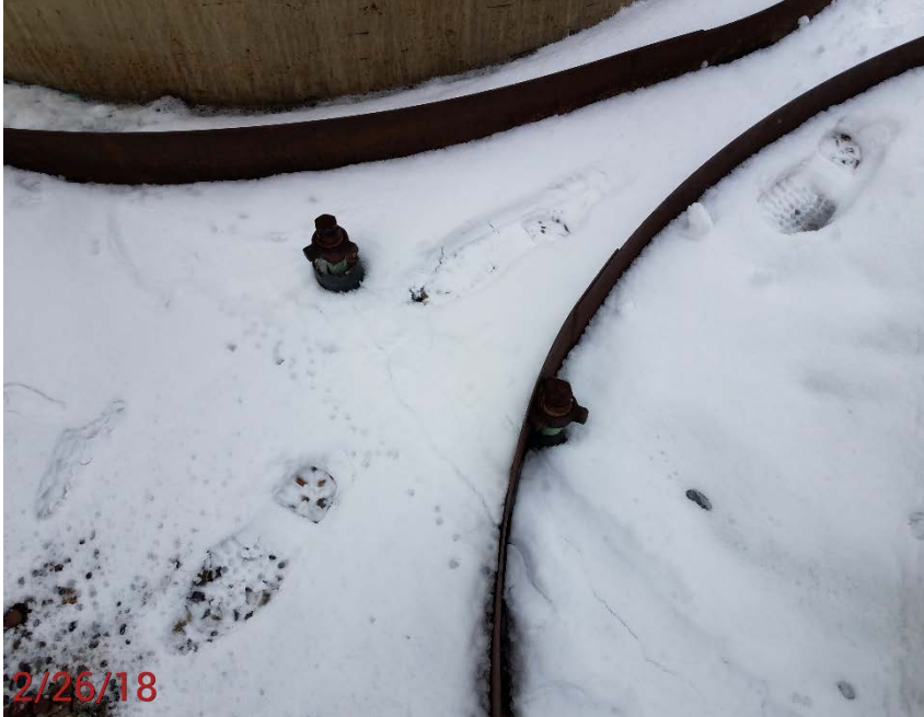
Location Photo #3, Unmarked, unused flow lines in battery containment.