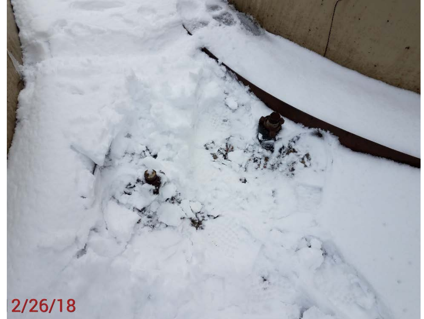
Location Photo #4, Unmarked, unused flow lines in battery containment