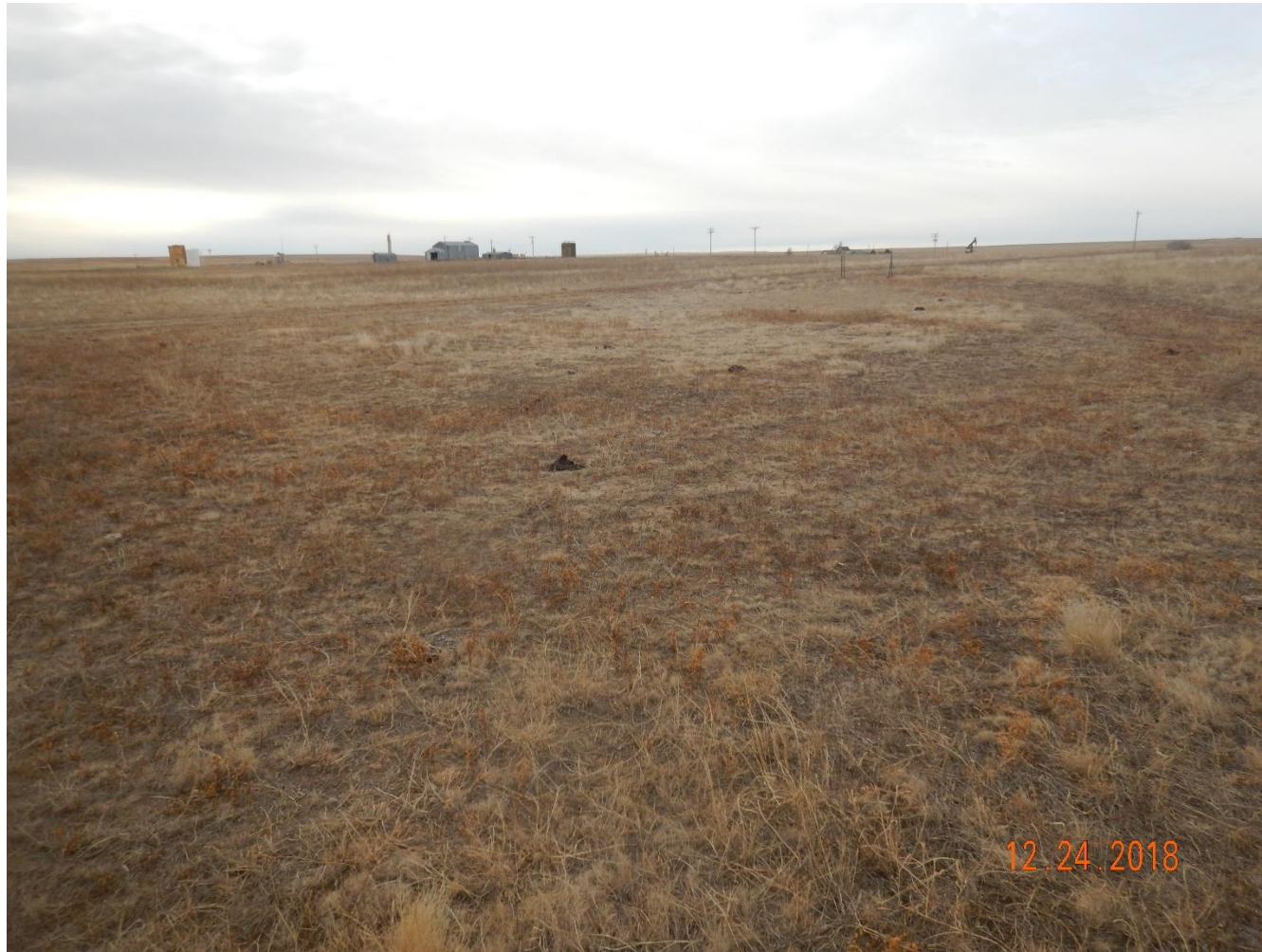
Photo 4: Photo taken from the northeast end of the location, facing southwest. Photo shows the turn-around portion of the access road. Photo shows no additional reclamation appears to have been conducted. Vegetation observed in photo is predominantly undesirable weedy plant species.