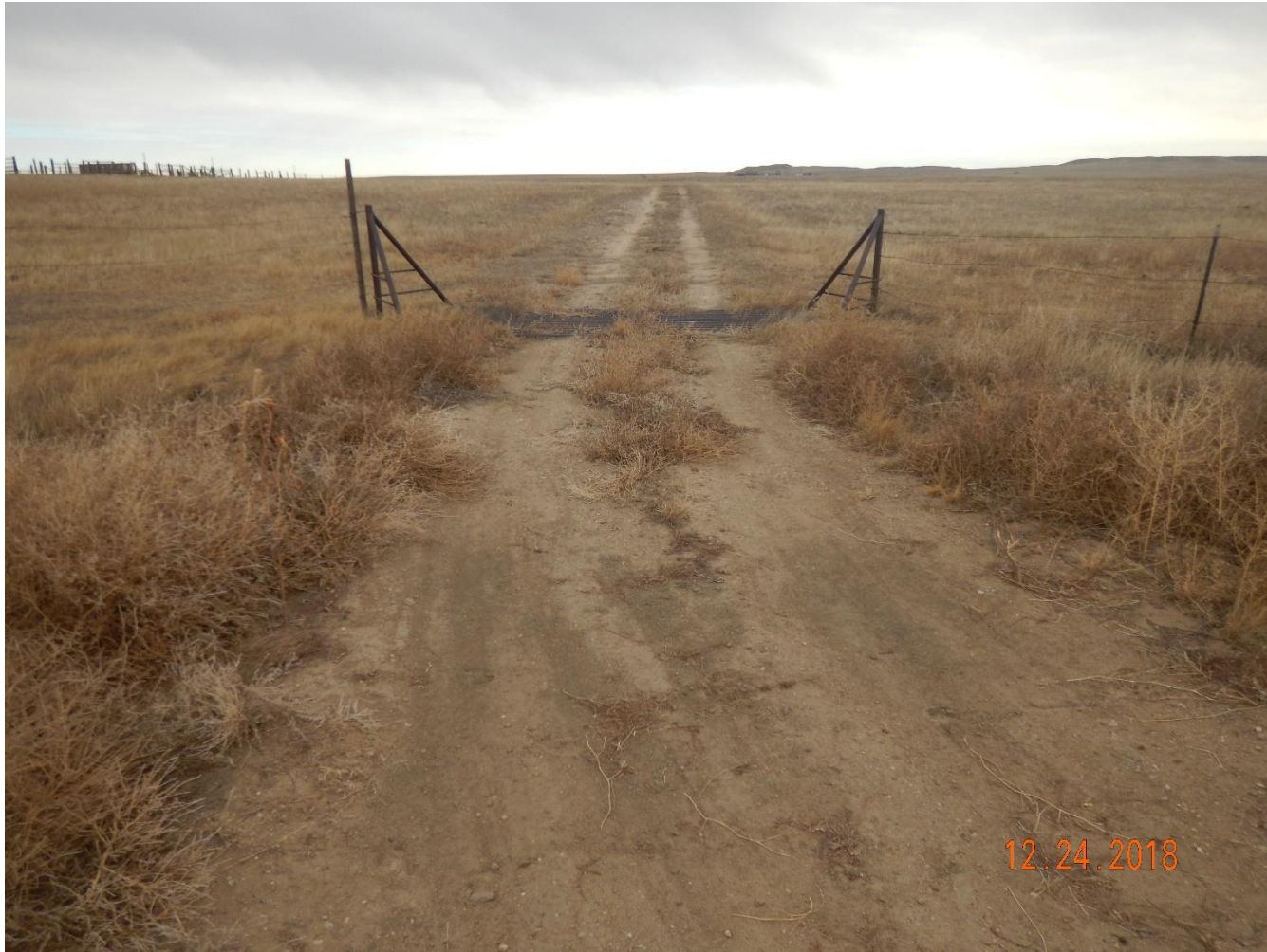
Photo 1: Photo taken from the access road entrance, facing east. Photo shows that access road and cattle guard have not been reclaimed.