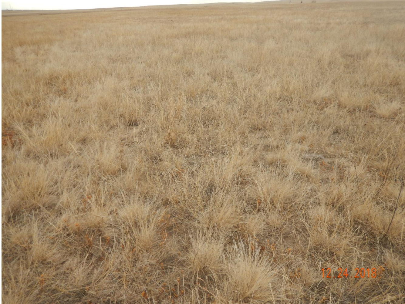
Photo 6: Photo taken from the adjacent reference area. Photo shows reference vegetation. Vegetation observed included Purple threeawn, Sand dropseed, Blue Grama Western wheat.