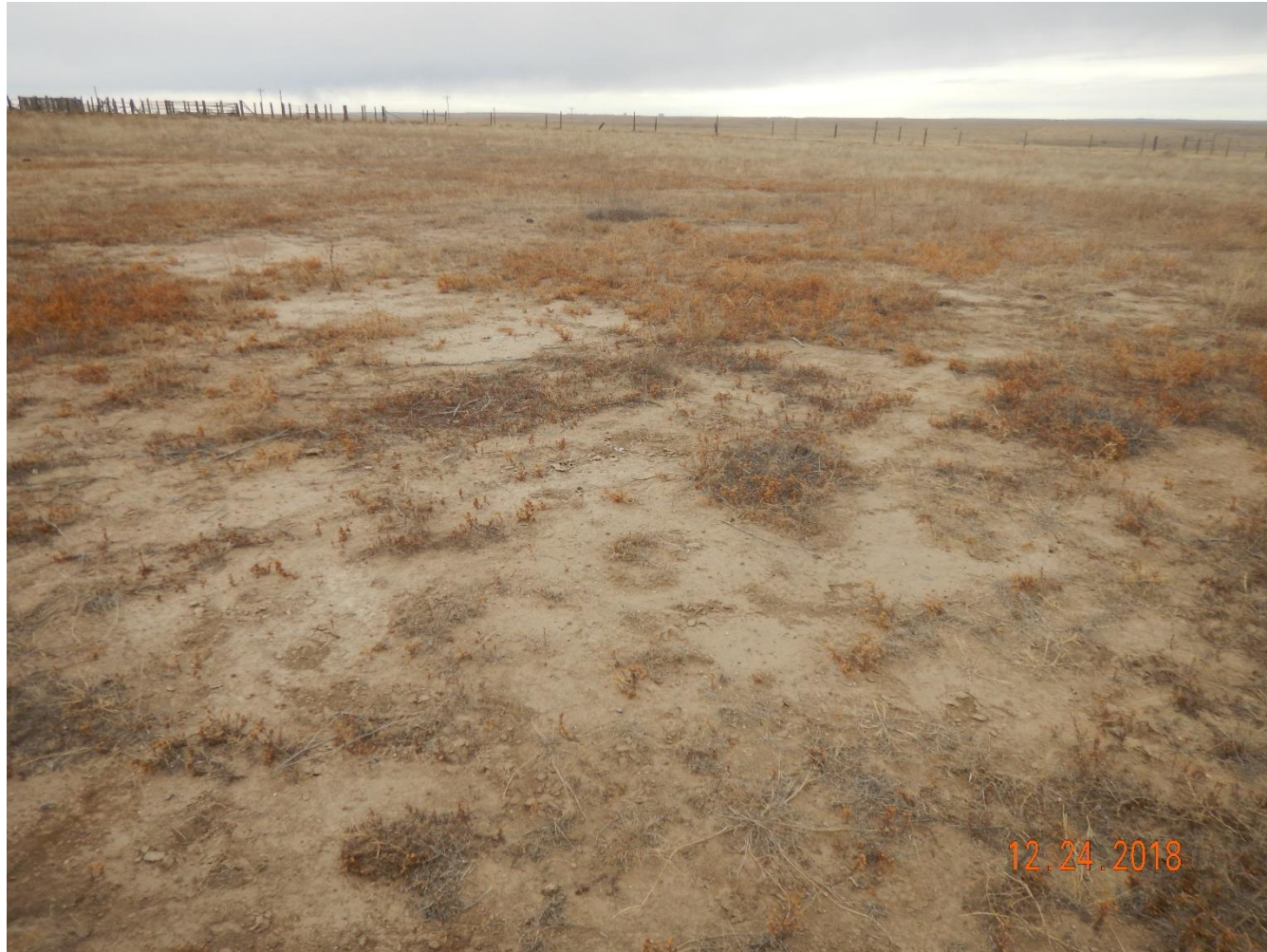
Photo 3: Photo taken from the southeast end of location, facing northwest. Photo shows location and access road remain predominantly bare and exposed soil. Unable to find evidence that reclamation activities have been conducted.