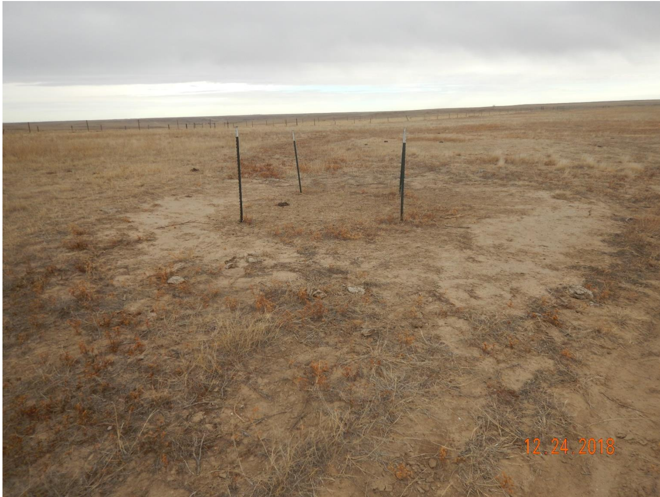
Photo 2: Photo taken from the southwest end of location, facing northeast. Photo shows location and access road remain predominantly bare and exposed soil. Unable to find evidence that reclamation activities have been conducted.