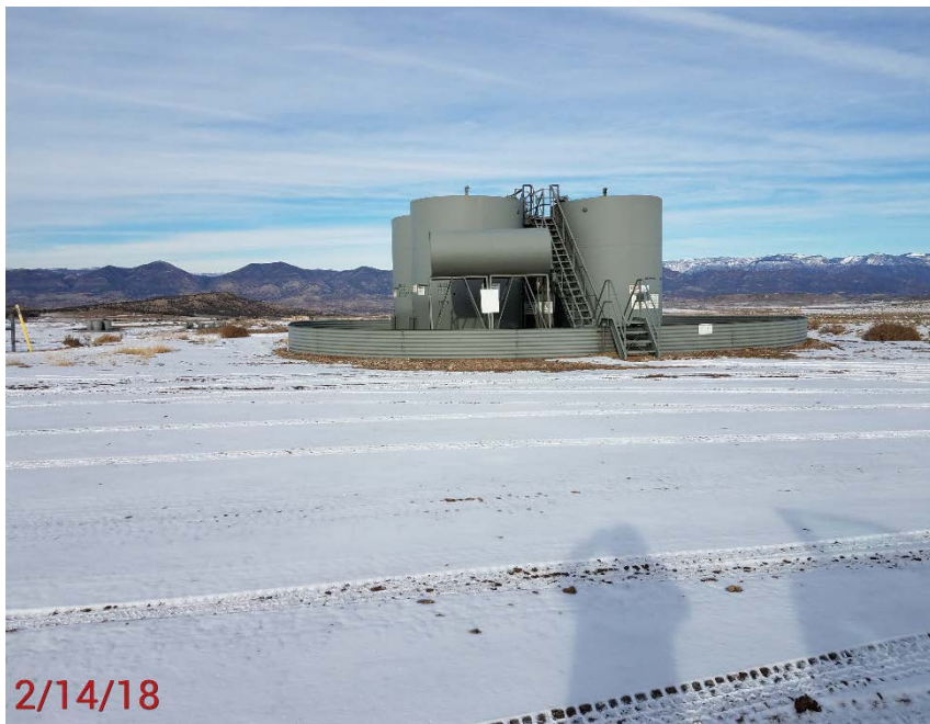
Location Photo #3