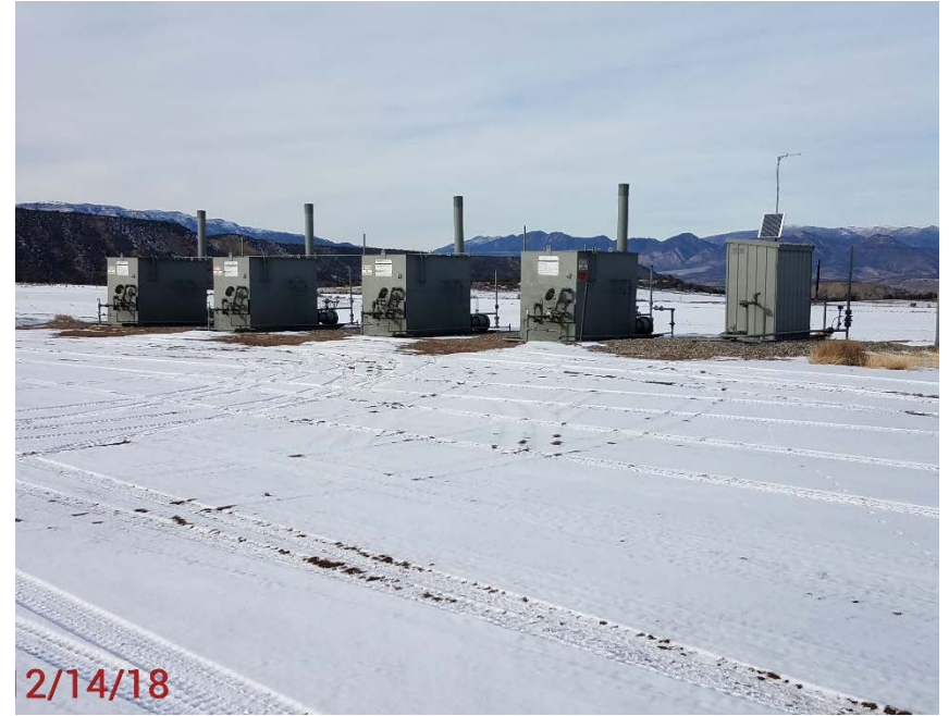
Location Photo #2