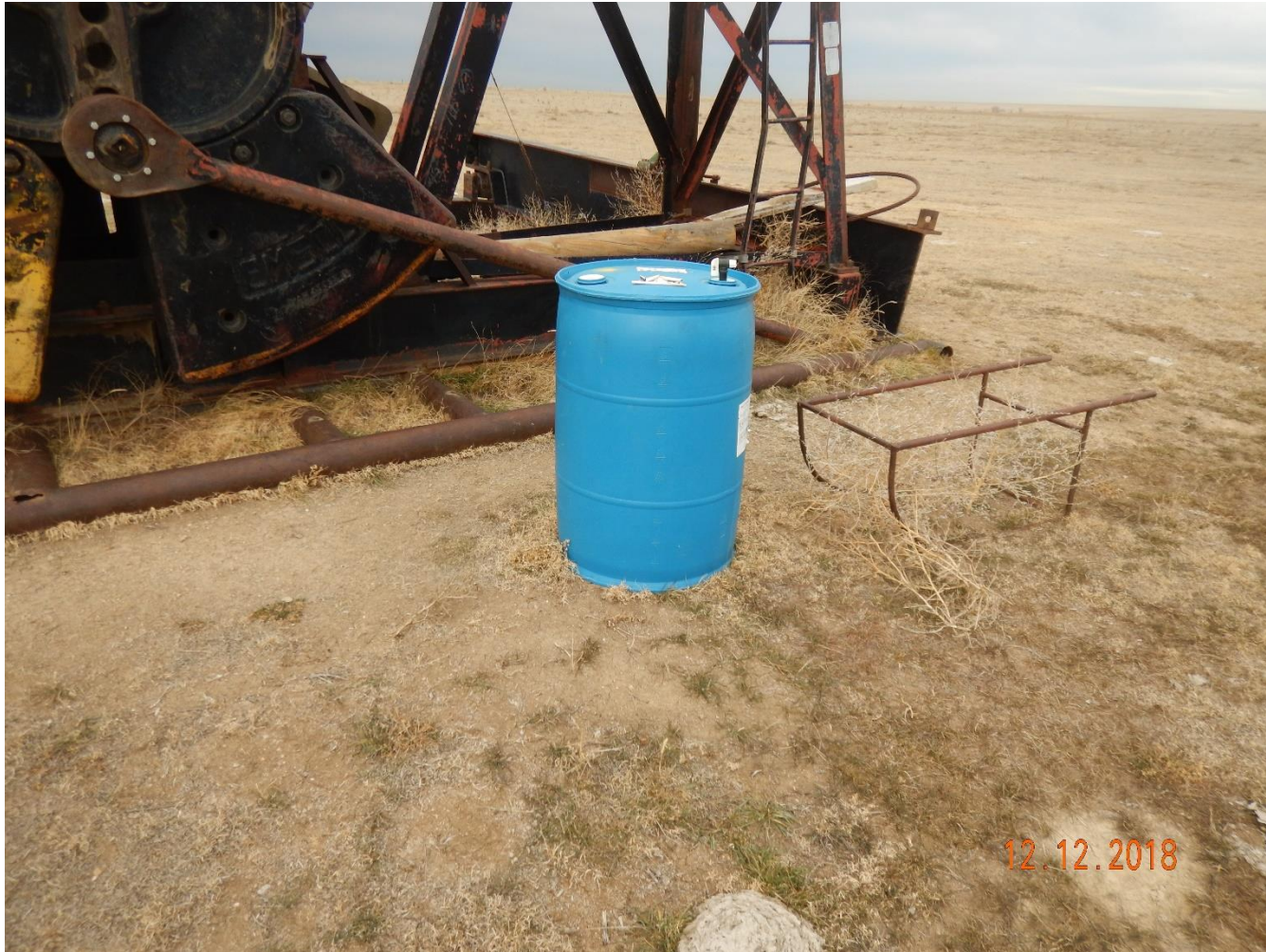
Photo 6: Photo taken from the north end of the pump unit, facing north. Photo shows a barrel being stored on the location without secondary containment. This is improper materials management.