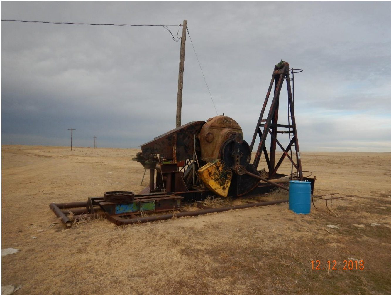
Photo 8: Photo taken from the north end of the pump unite, facing north. Photo shows various unused equipment being stored on the interim areas. This is equipment not needed for production and needs to be removed and properly stored.