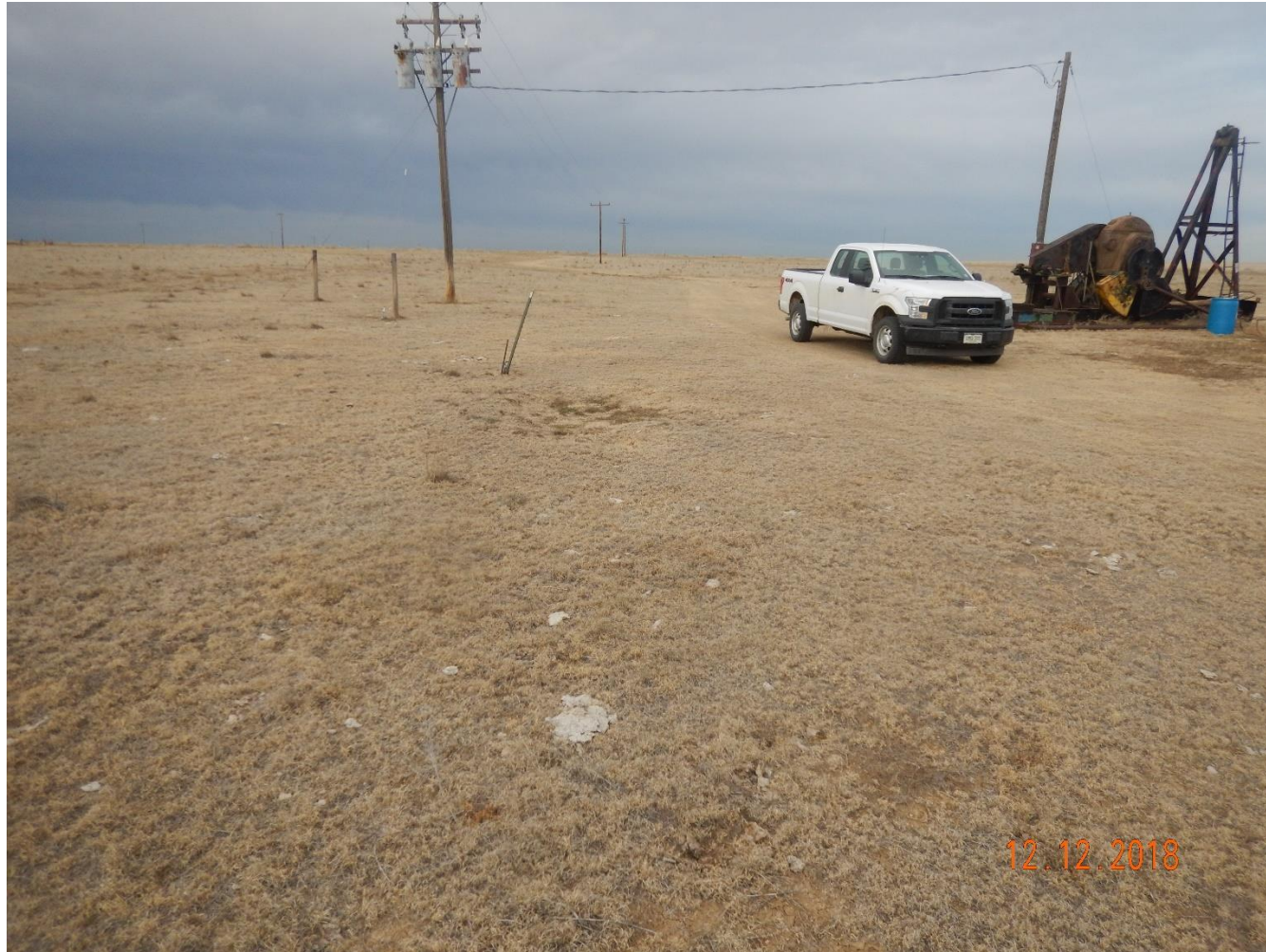
Photo 1: Photo taken from the southwest end of the location, facing north. Photos 1-3 provide an overview of the location and interim areas from north, northeast to east.