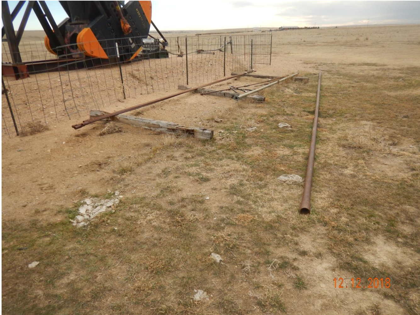
Photo 5: Photo taken from the north end of the pump unite, facing southwest. Photo shows various unused equipment being stored on the interim areas. This is equipment not needed for production and needs to be removed and properly stored.