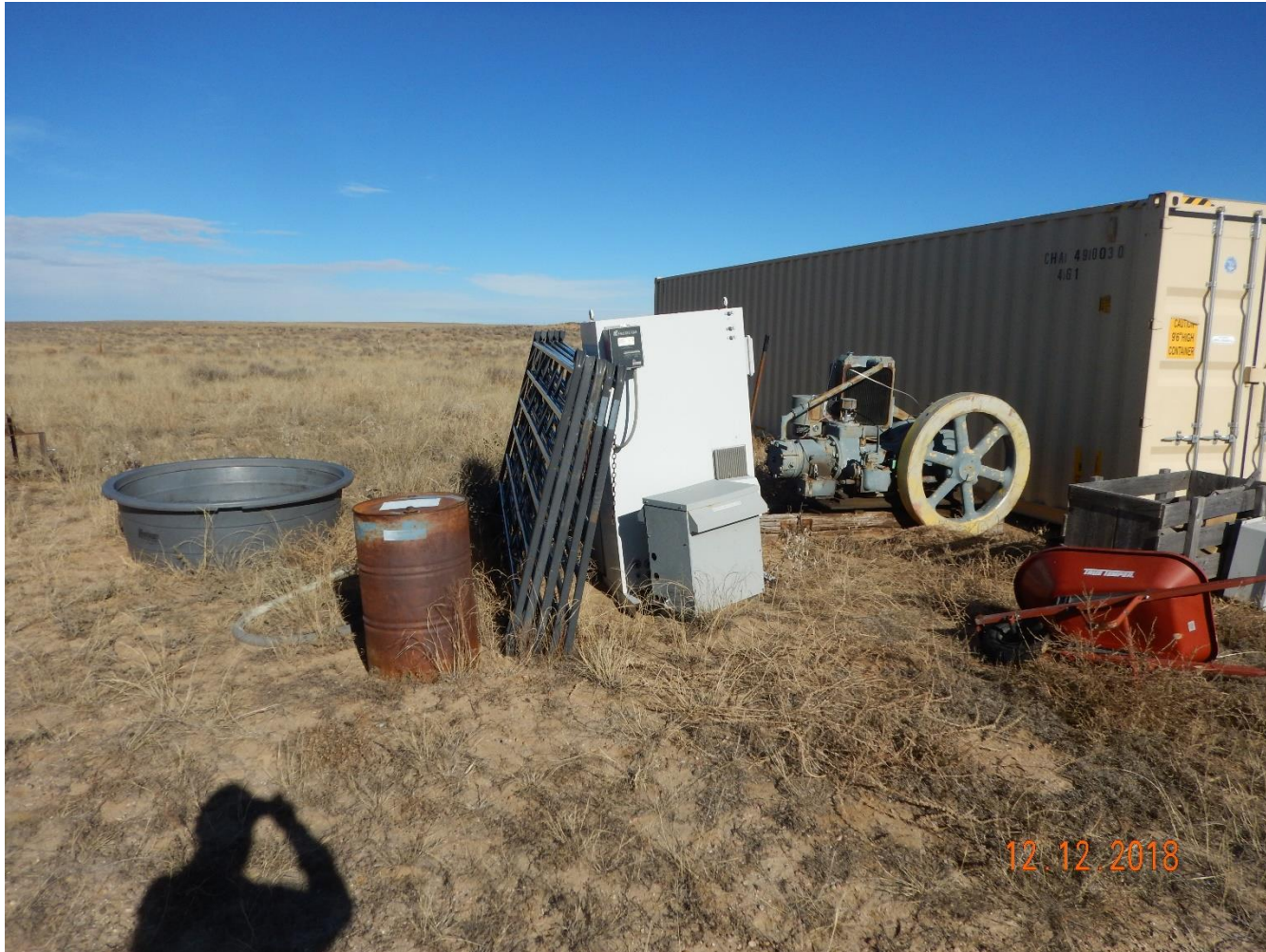
Photo 17: Photo taken from the north end of the location, facing north. Photo shows unused equipment not needed for production remains on location.