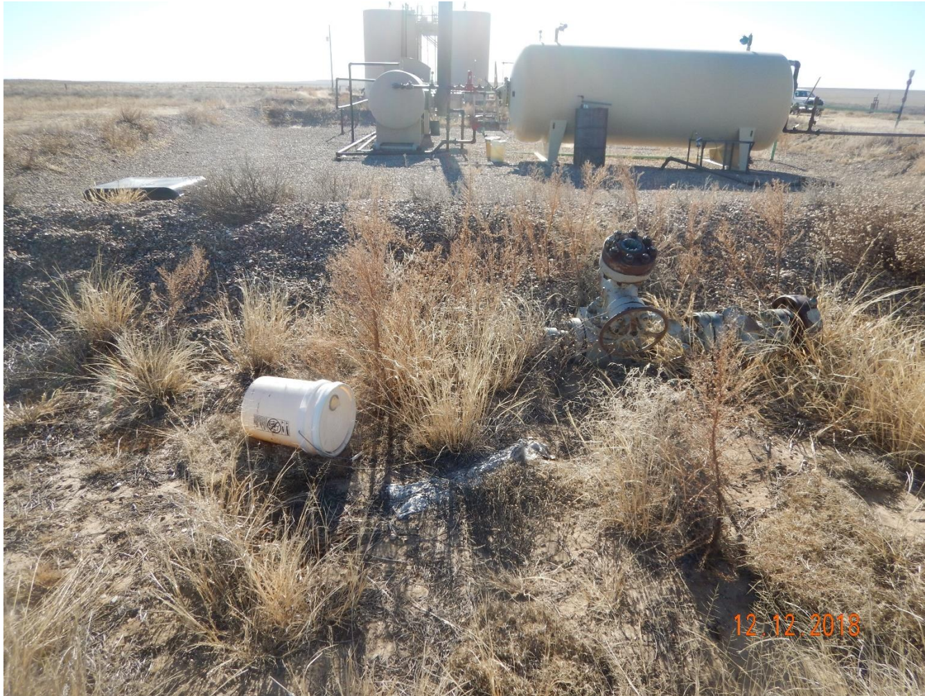
Photo 16: Photo taken from the north end of the location, facing southwest. Photo shows unused equipment not needed for production, and various trash debris remains on location.