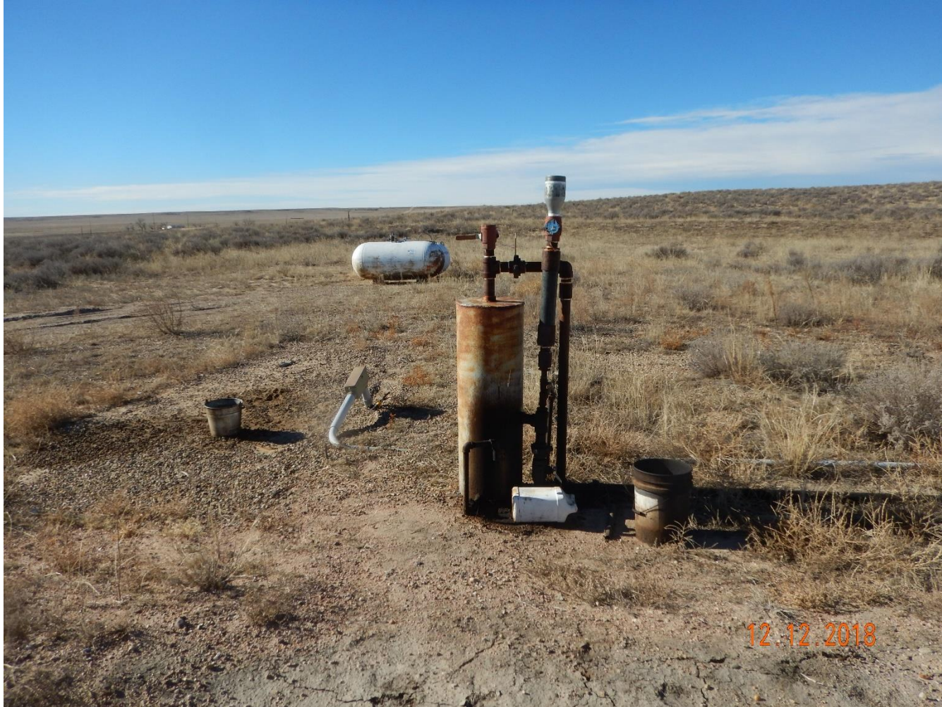
Photo 1: Photo taken from the west end of the location. Previous inspections documented this 5 gallon bucket being used to collect chemicals from equipment and stained soils at the base. Inspections required that equipment needs to be repaired to fix leaks, and bucket needs to be removed and properly disposed or placed in containment. Photo shows bucket and stained soils remain.