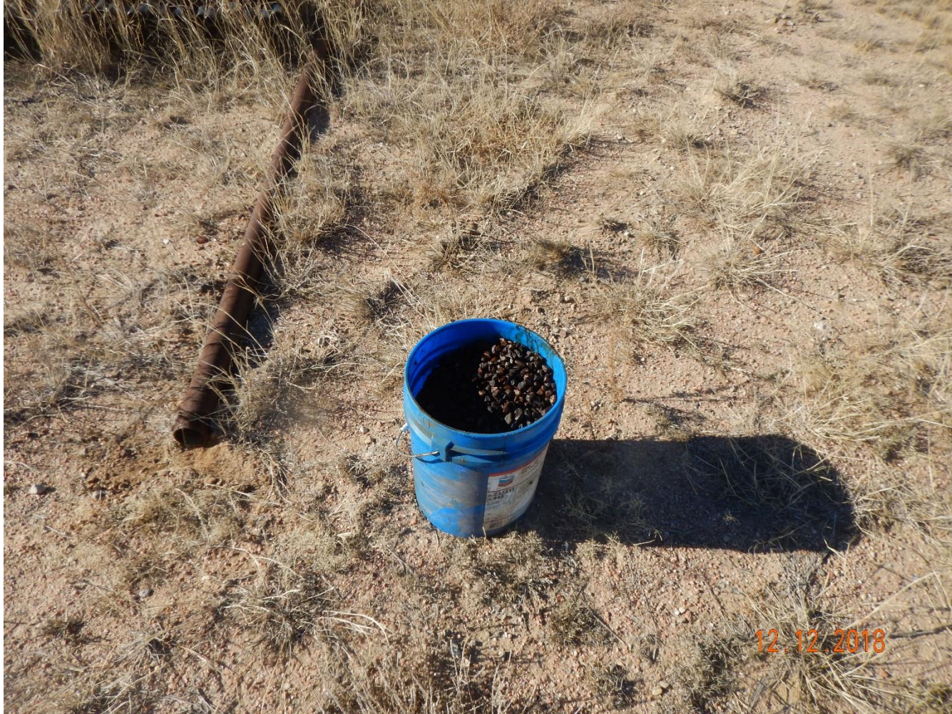
Photo 10: Continued from photo 9. Photo shows bucket with contaminated materials.