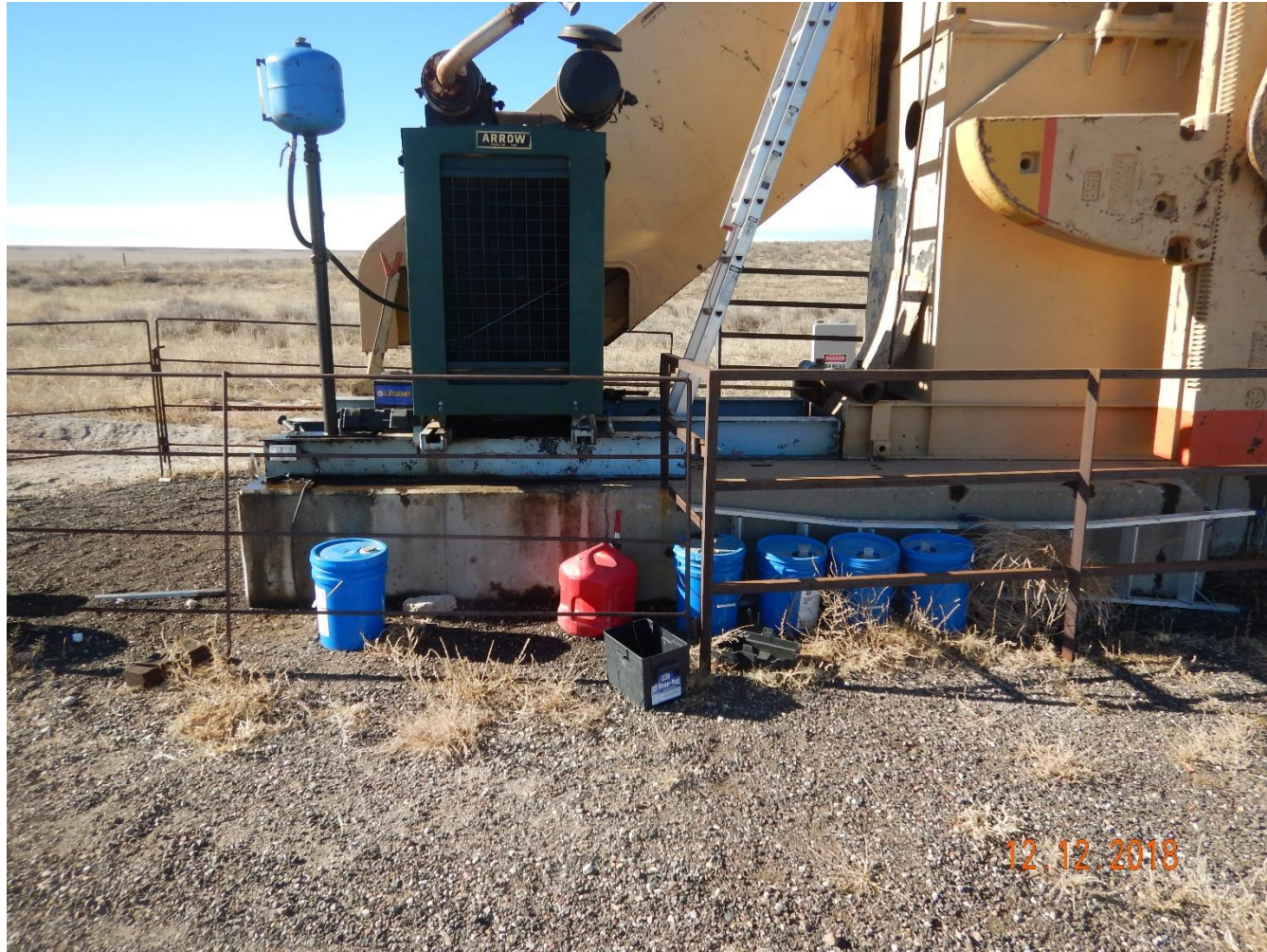
Photo 7: Photo taken from the east end of the pump jack, facing west. Previous inspections documented numerous 5 gallon buckets w/ chemical and oil jugs found around pump jack, and required containers to be properly removed and disposed, or placed into containment. Photo shows containers have not been removed or placed into containment.