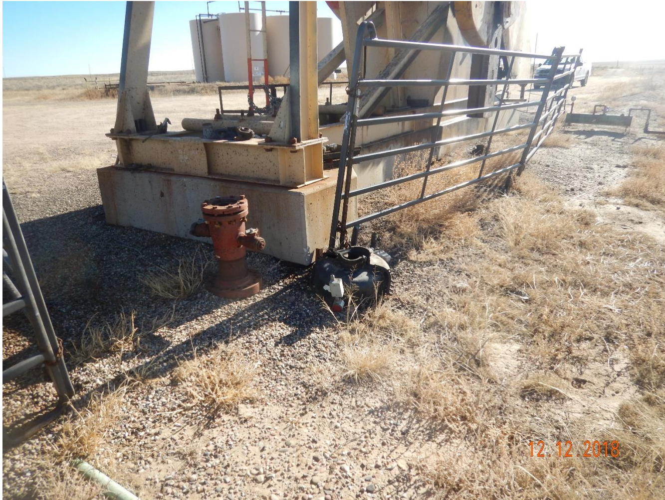
Photo 13: Photo taken from the north end of the well, facing south. Photo shows unused equipment not needed for production remains on location.