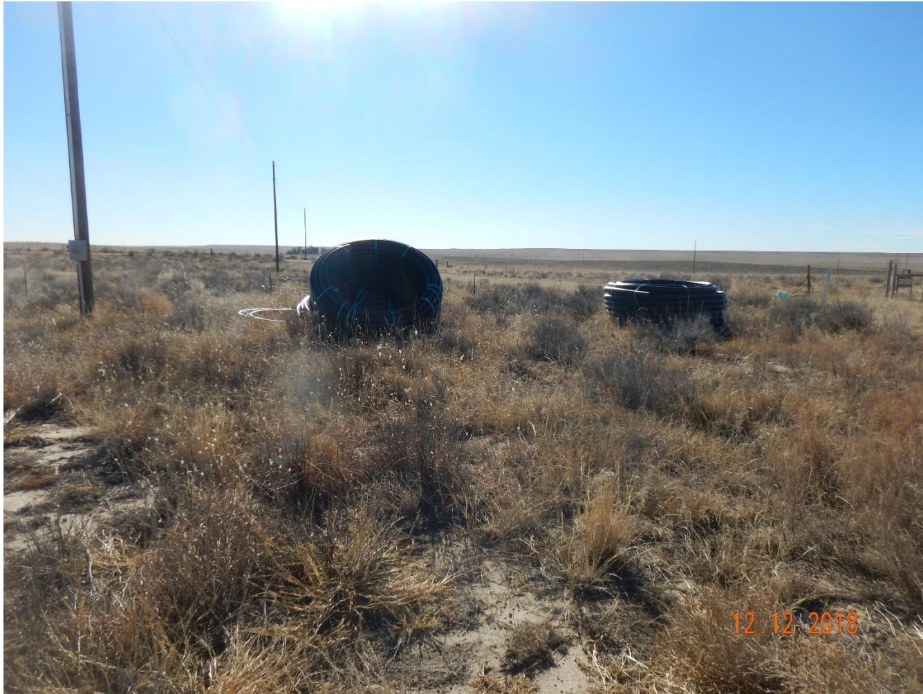
Photo 28: Photo taken from the south end of the location, facing south. Photo shows what appears to be four (4) bundles of pipe stored on the southern interim area. Previous inspections documented that this is unused equipment not needed for production and that needs to be removed from location. Photo shows equipment has not been removed.