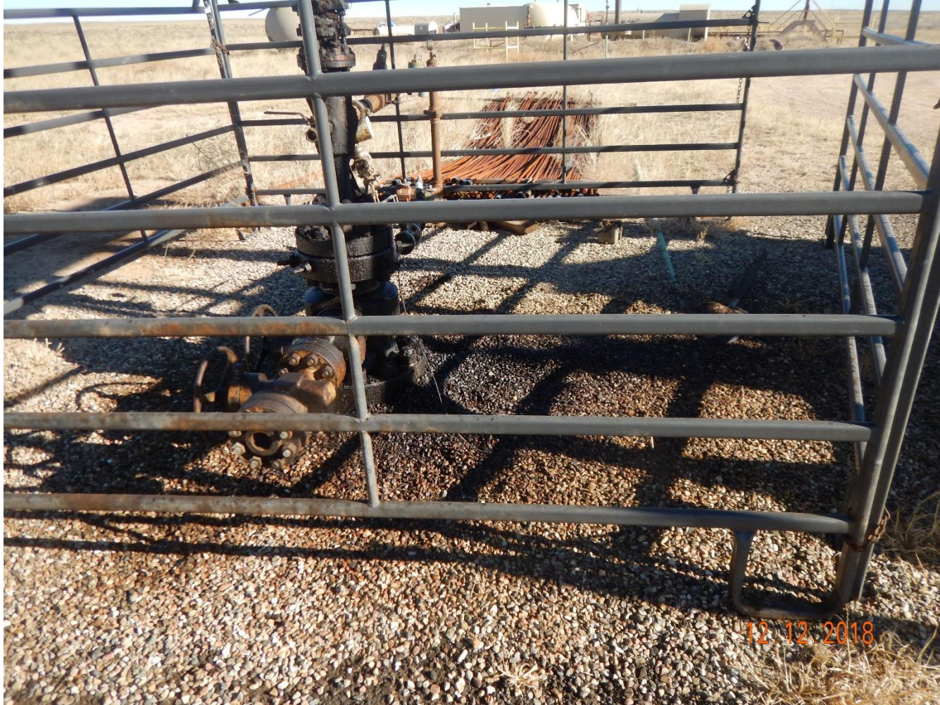
Photo 12: Photo taken from the north end of the well, facing west. Previous inspections documented contaminated soils around well and required stained soils to be cleaned. Photo shows contaminated soils remain.