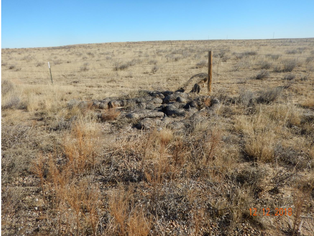
Photo 21: Photo taken from the north end of the location, facing southwest. Photo shows trash debris remains on location.