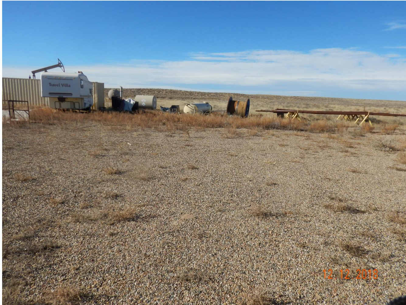
Photo 22: Photo taken from the north end of the location, facing west. Photo shows various unused equipment not needed for production remains stored on location