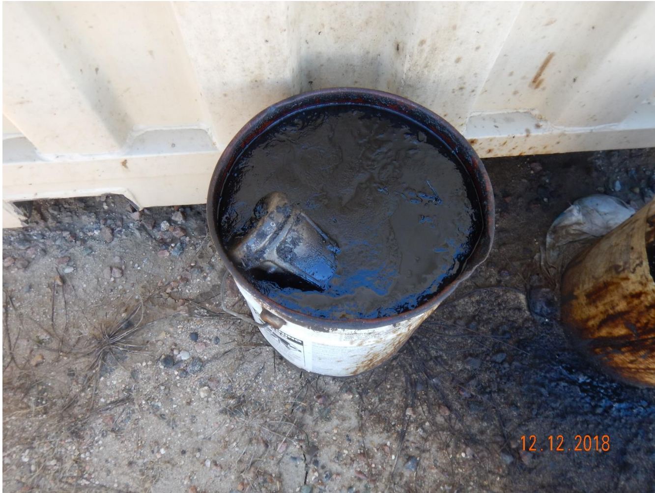
Photo 25: Photo taken from the north end of the location. Previous inspections documented 5 gallon buckets w/ chemical and stained soils and required buckets to be properly removed and disposed, or placed into containment and soil cleaned. Photo shows buckets and contaminated soils remain.