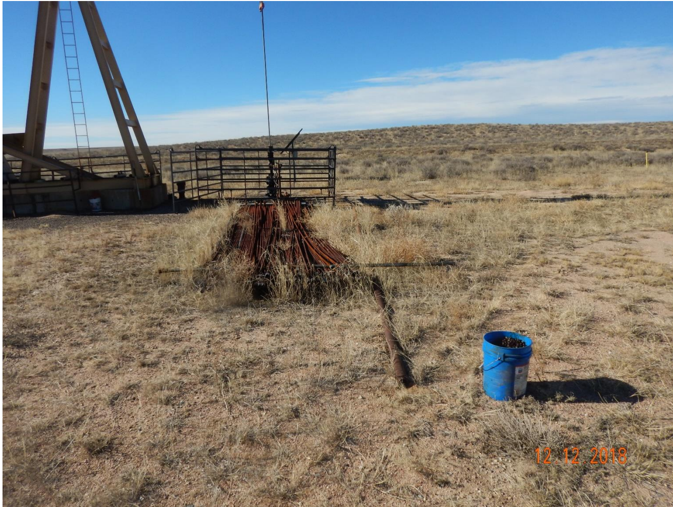
Photo 9: Photo taken from the east end of the pump, facing northwest. Photo shows unused equipment stored on location and a 5 gallon buckets w/ contaminated material. Previous inspections documented required equipment not needed for production needs to be removed, and containers placed within secondary containment.