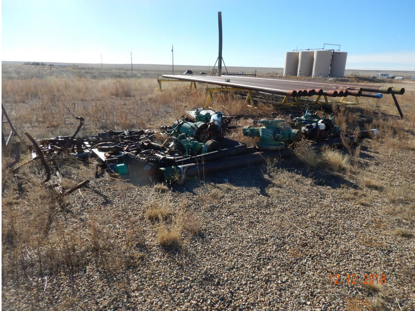
Photo 19: Photo taken from the north end of the location, facing southwest. Photo shows various unused equipment not needed for production remains stored on location.