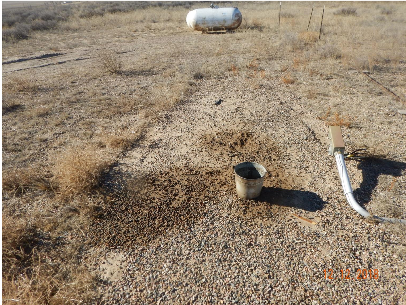
Photo 3: Photo taken from the west end of the location facing west. Photo shows stained soil and a bucket with various contaminated soils without secondary containment.