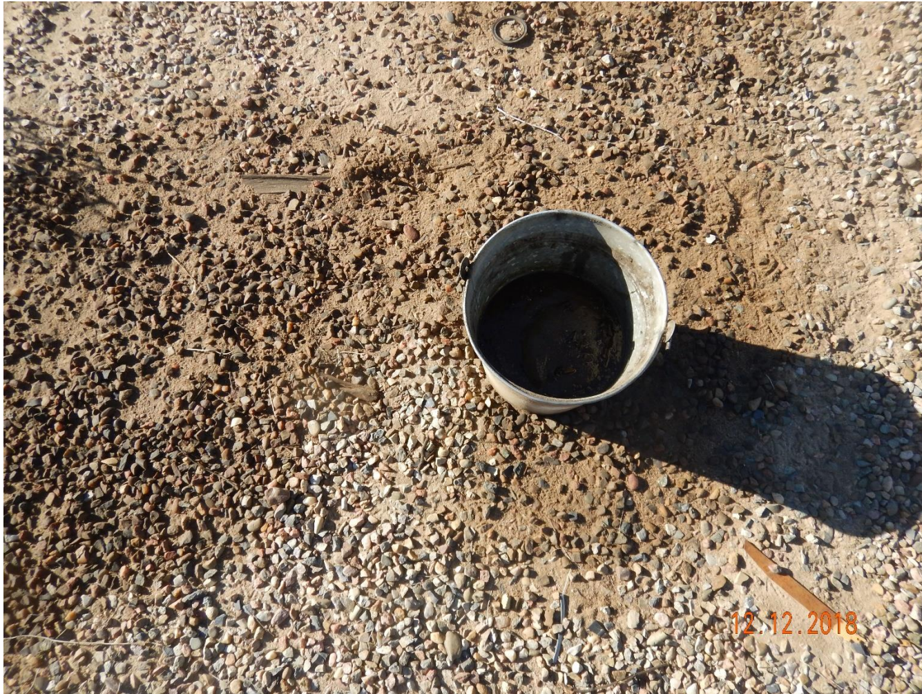
Photo 4: Photo taken from the west end of the location facing west. Photo shows stained soil and a bucket with various contaminated soils without secondary containment.