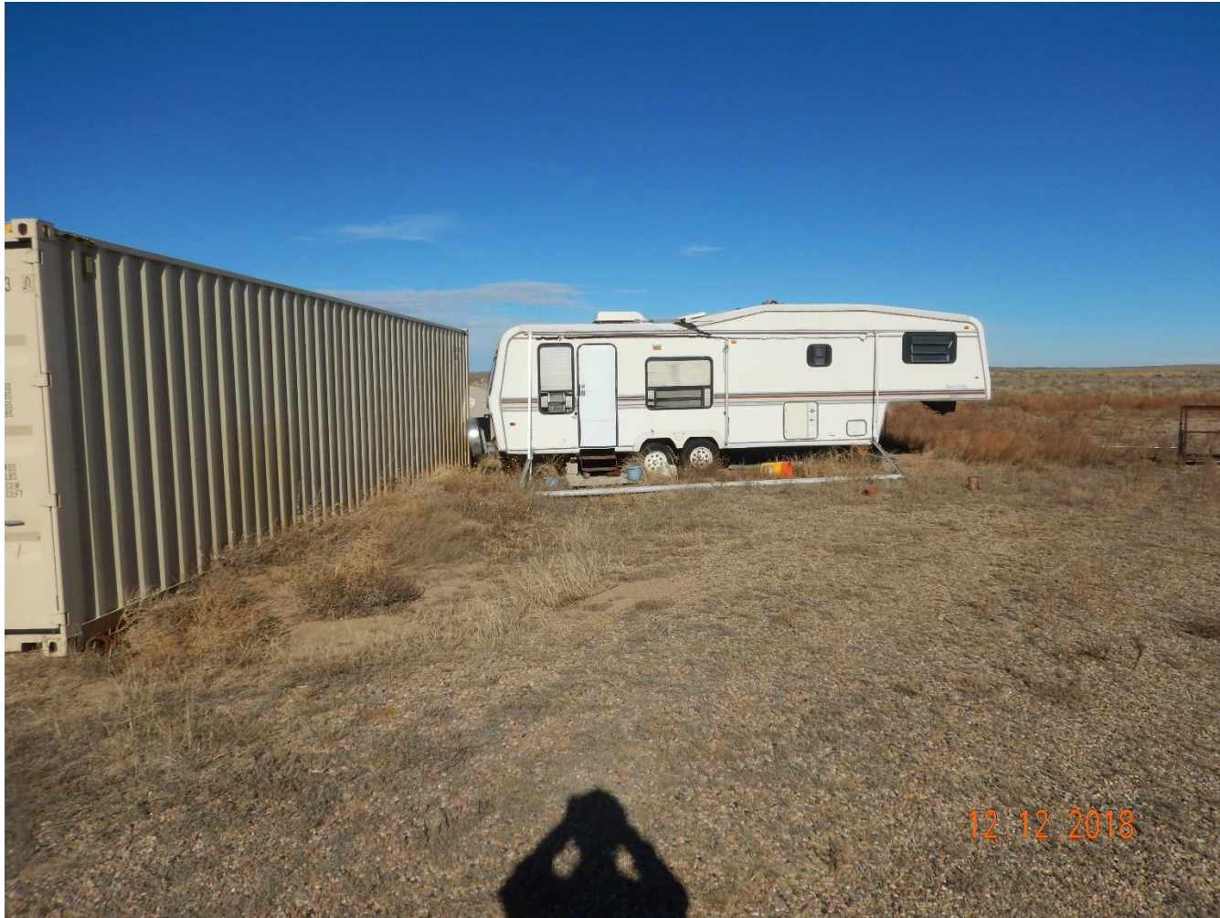
Photo 18: Photo taken from the north end of the location, facing north. Previous inspection documented camper trailer being stored on location. Trailer is not needed for production and was required to be removed. Camper trailer remains. Photo also shows various trash debris around camper trailer.