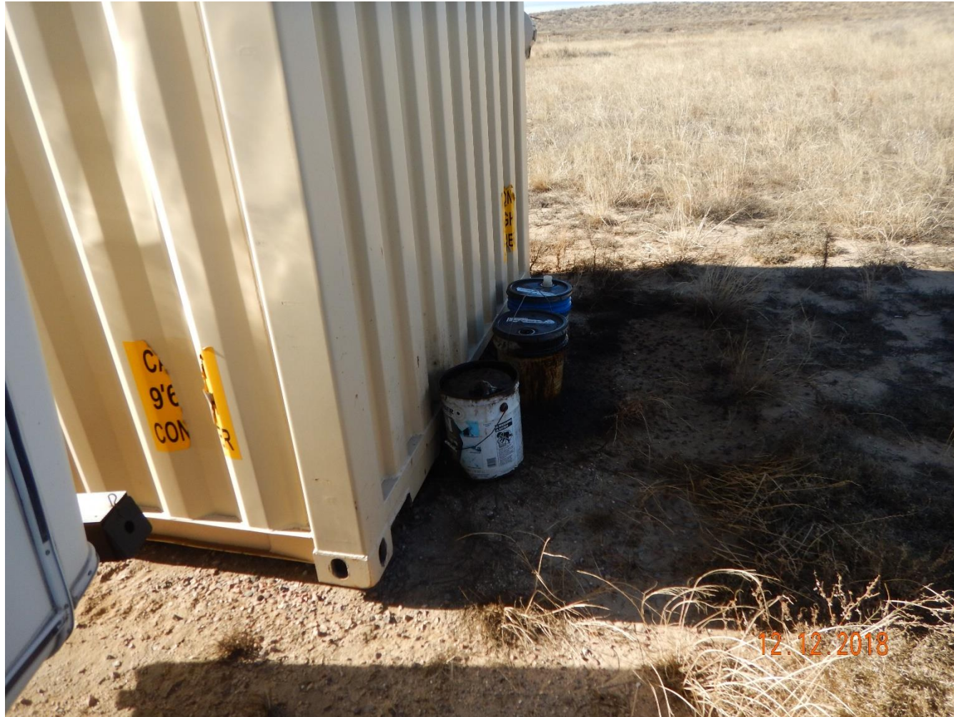
Photo 24: Photo taken from the north end of the location. Previous inspections documented 5 gallon buckets w/ chemical and stained soils and required buckets to be properly removed and disposed, or placed into containment and soil cleaned. Photo shows buckets and contaminated soils remain.