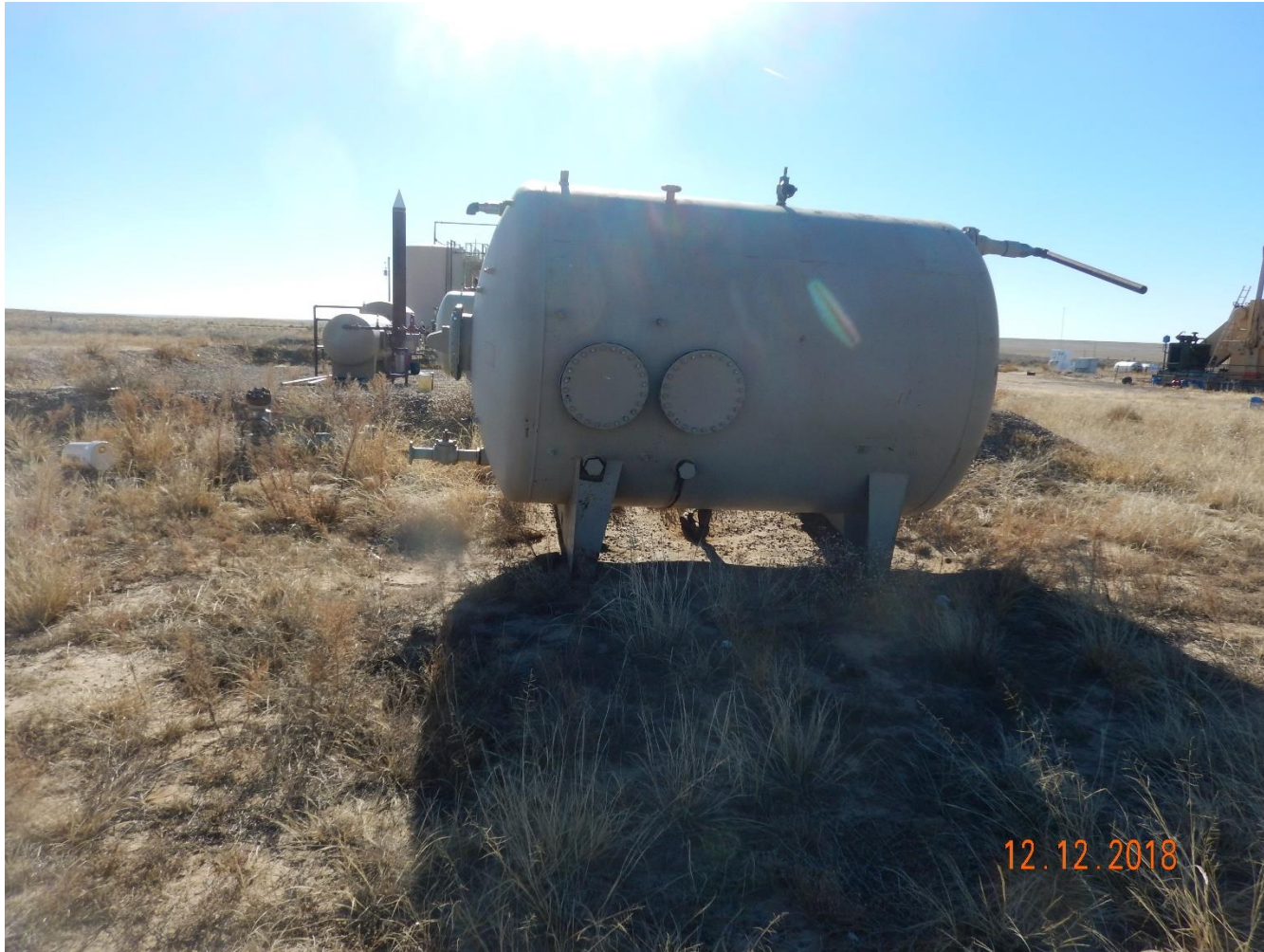
Photo 15: Photo taken from the north end of the location, facing southwest. Photo shows unused equipment not needed for production remains on location.