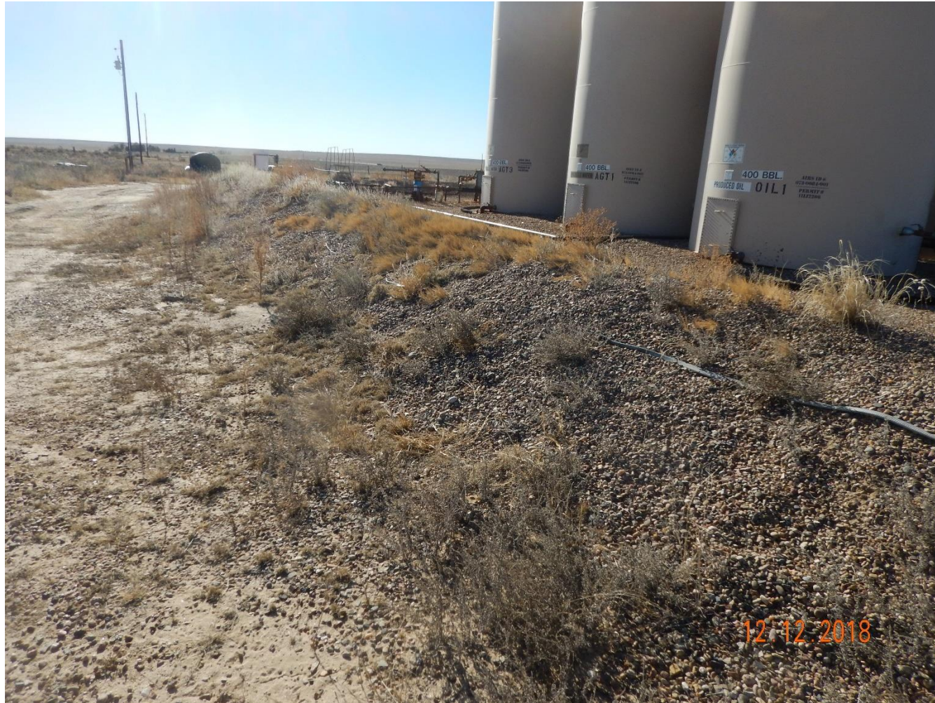
Photo 26: Photo taken from the northeast corner of the tank battery, facing south. Previous inspections required operator to remove vegetation from the berms of the battery and production equipment; vegetation compromises the integrity of the containment berms. Photo shows vegetation has not been removed.