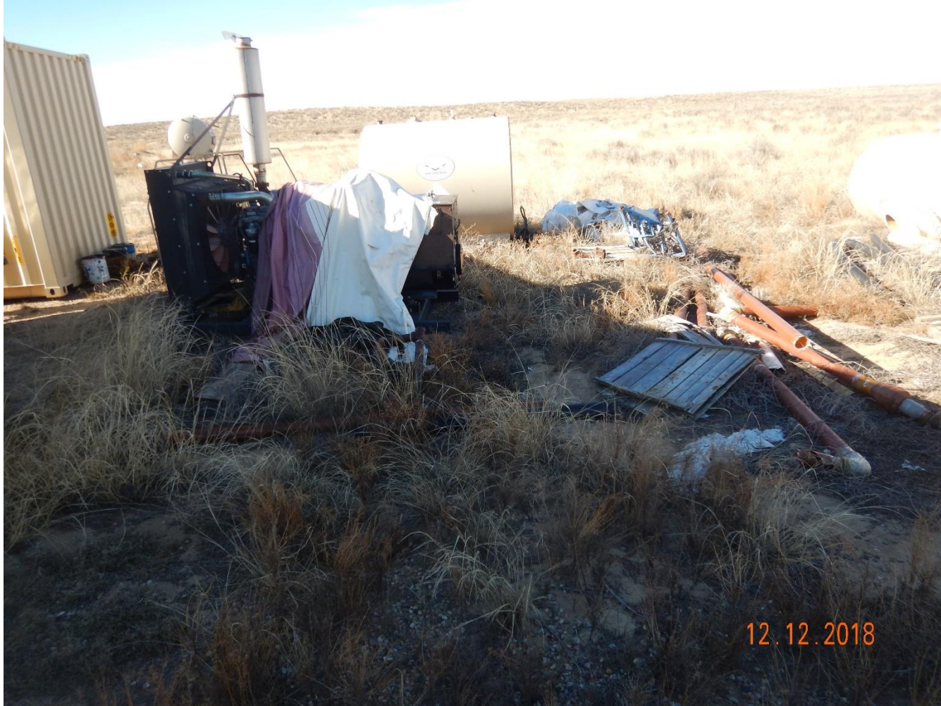
Photo 23: Photo taken from the north end of the location, facing west. Photo shows various unused equipment not needed for production, and trash debris remains stored on location.