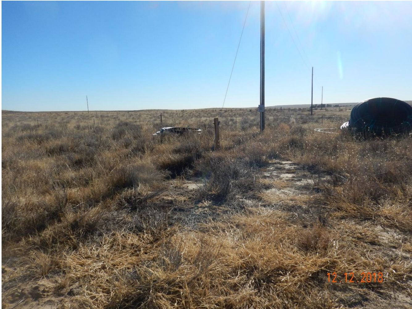
Photo 27: Photo taken from the south end of the location, facing south. Photo shows what appears to be four (4) bundles of pipe stored on the southern interim area. Previous inspections documented that this is unused equipment not needed for production and that needs to be removed from location. Photo shows equipment has not been removed.