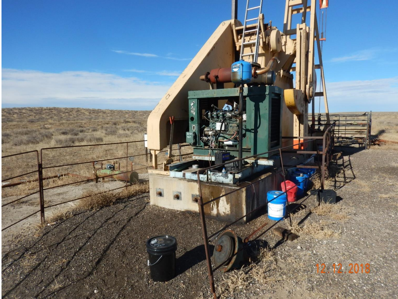
Photo 6: Photo taken from the southeast end of the pump jack, facing northwest. Previous inspections documented numerous 5 gallon buckets w/ chemical and oil jugs found around pump jack, and required containers to be properly removed and disposed, or placed into containment. Photo shows containers have not been removed or placed into containment.