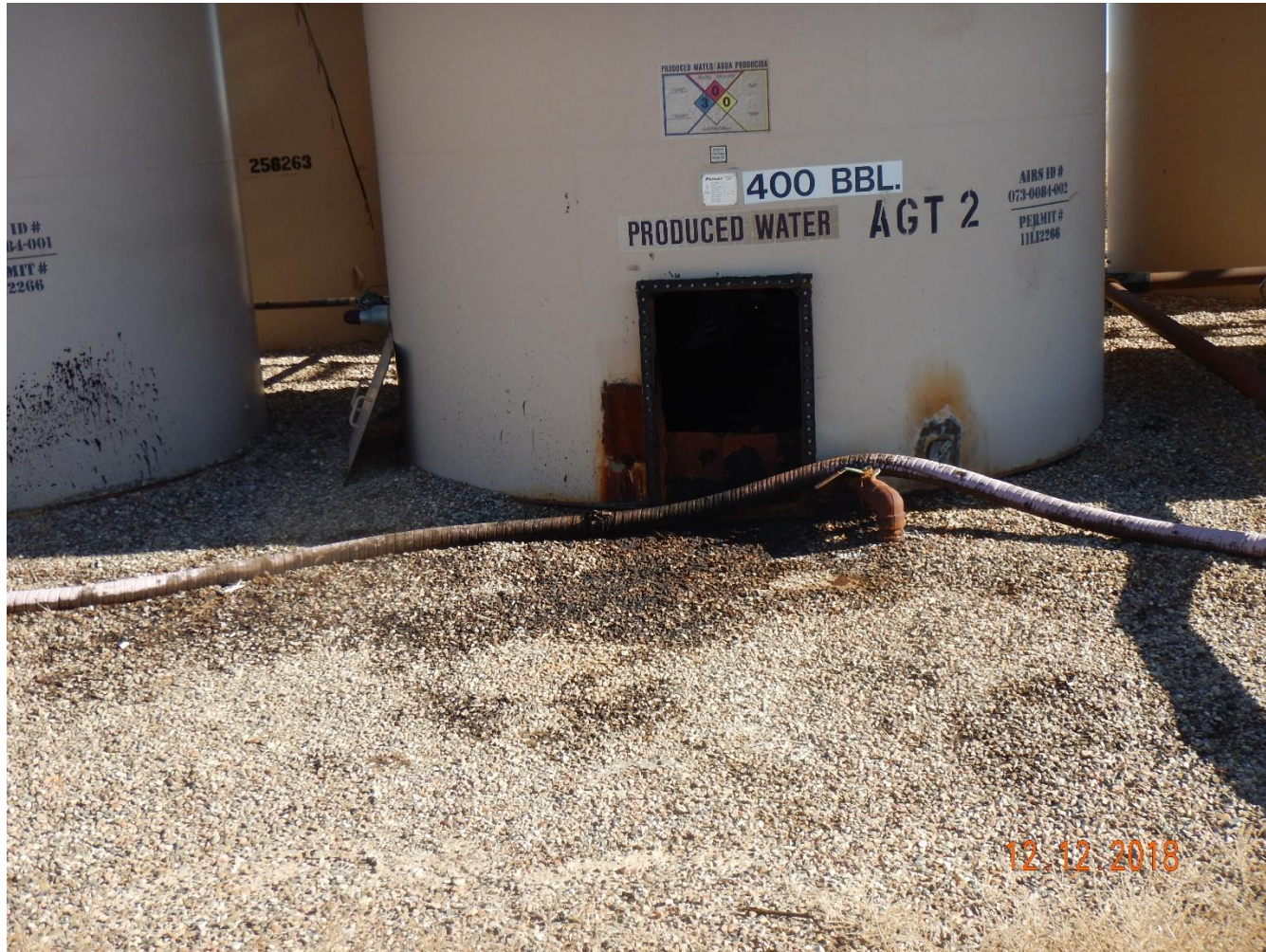
Photo 29: Photo taken from the west end of the tank battery. Previous inspections documented stained soils within the berm, and that the manway cover has been removed from the tank. Photo shows cover has not been replaced and stained soils remain