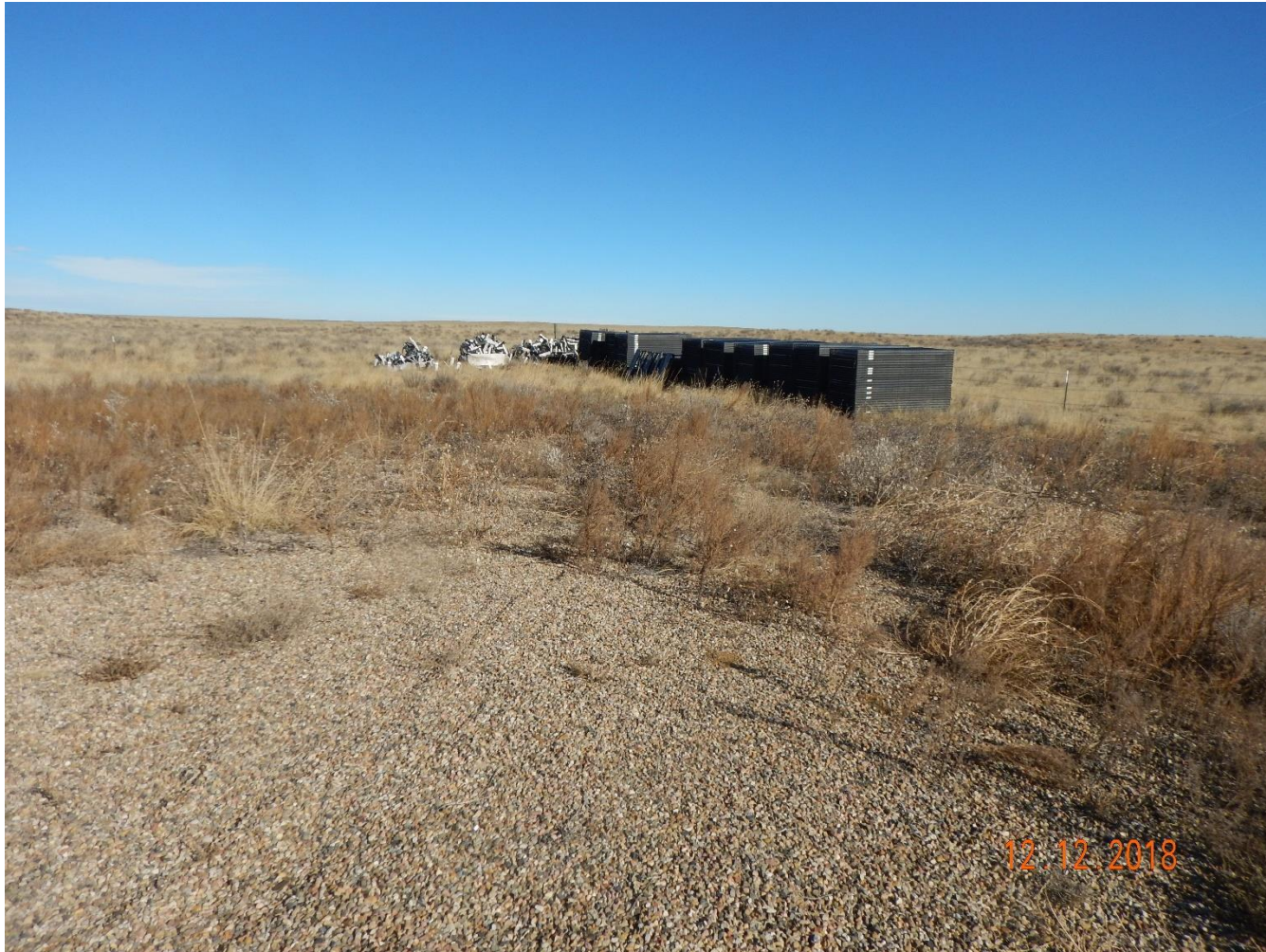
Photo 20: Photo taken from the north end of the location, facing southwest. Photo shows various unused equipment not needed for production remains stored on location.