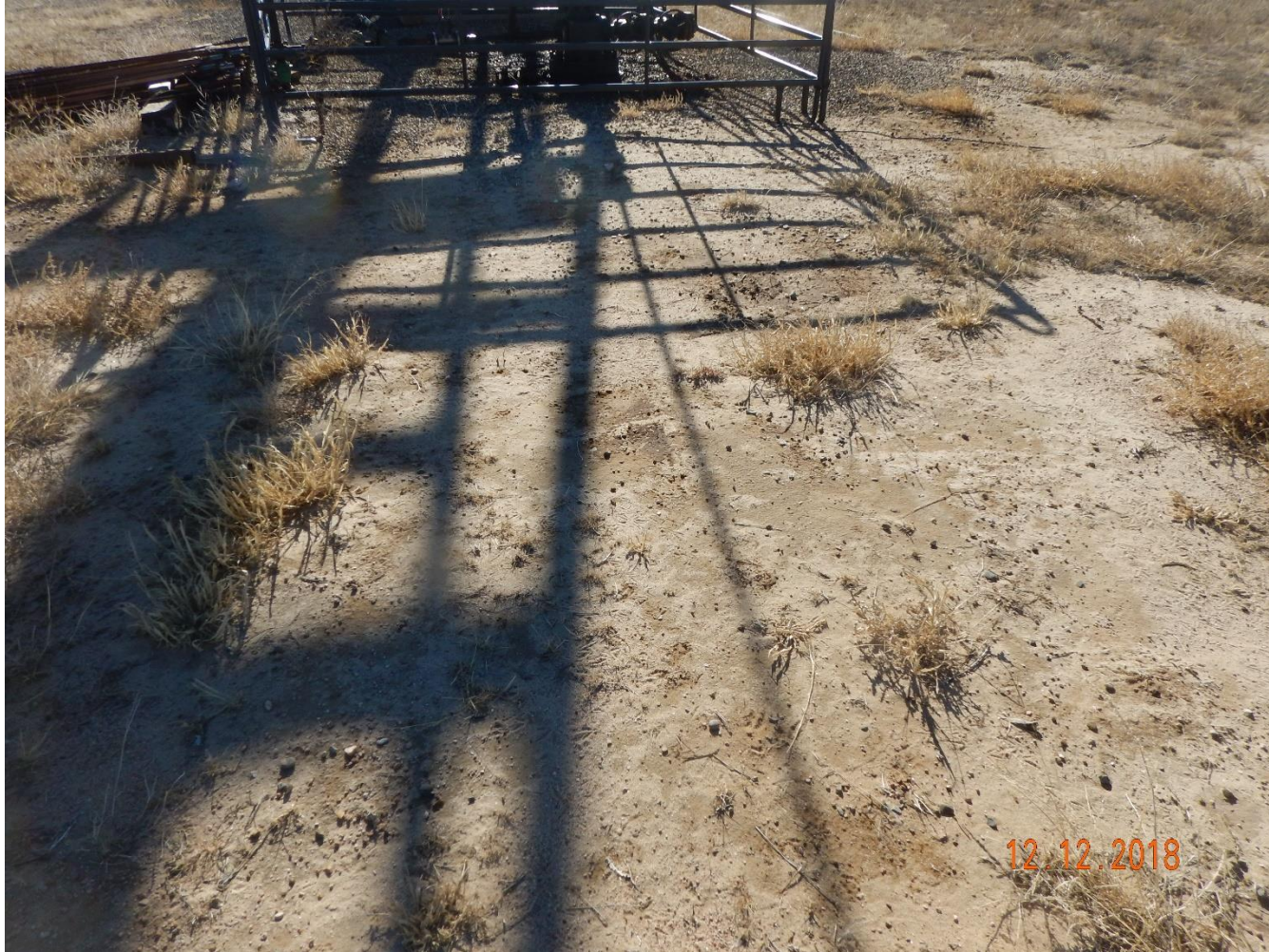
Photo 11: Photo taken from the north end of the well, facing south. Previous inspections documented contaminated soils around well and required stained soils to be cleaned. Photo shows contaminated soils remain.