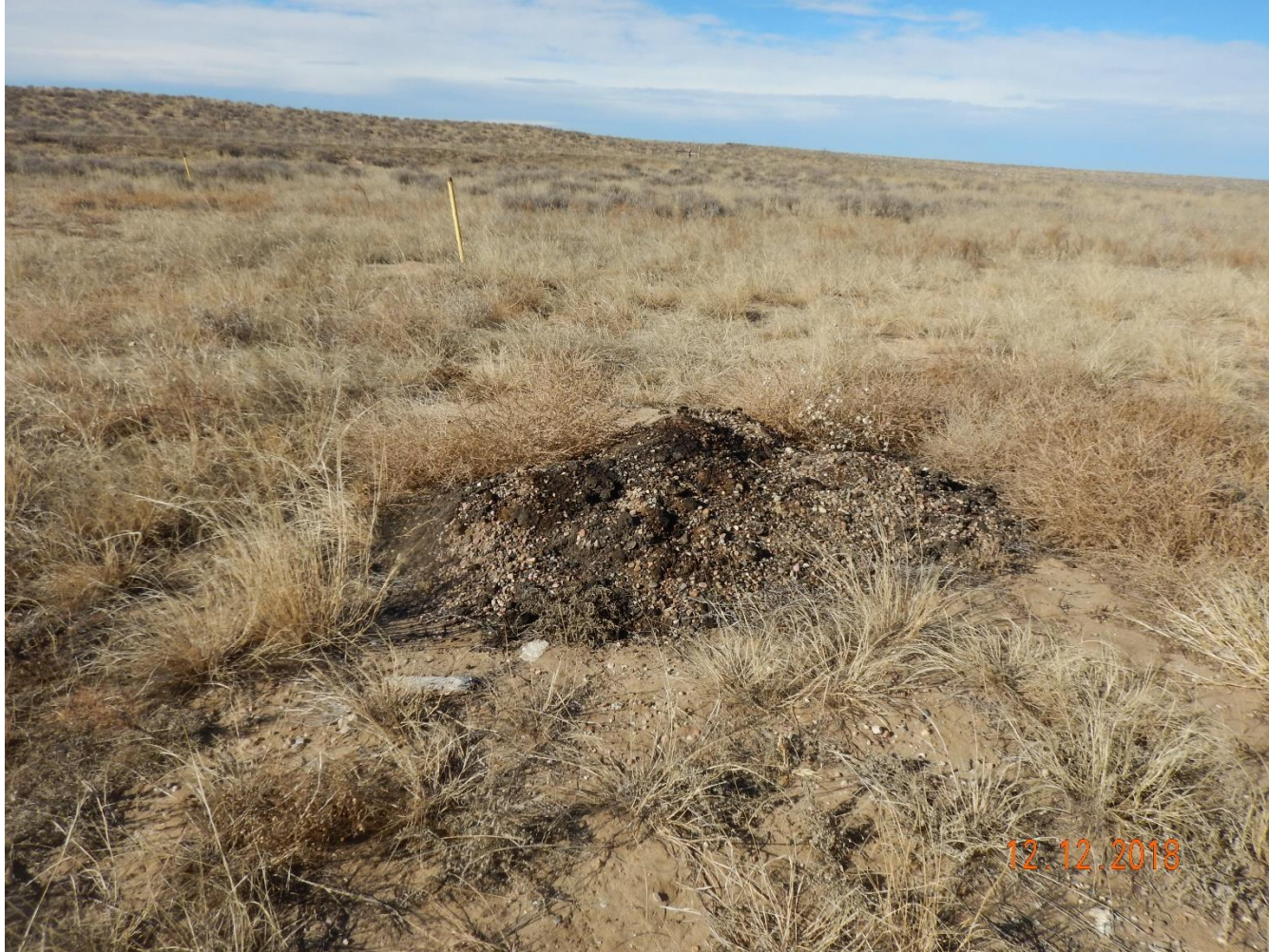
Photo 14: Photo taken from the north end of the location, facing northwest. Previous inspections required contaminated soils to be removed. Photo shows soils remain.