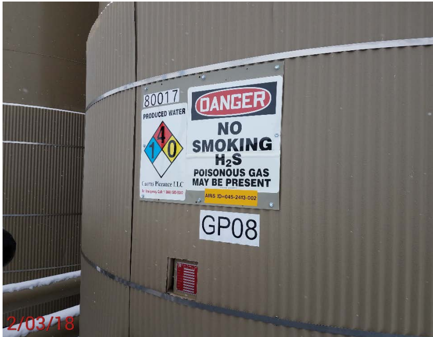
Location Photo #5, missing barrel capacity on all tanks within battery.