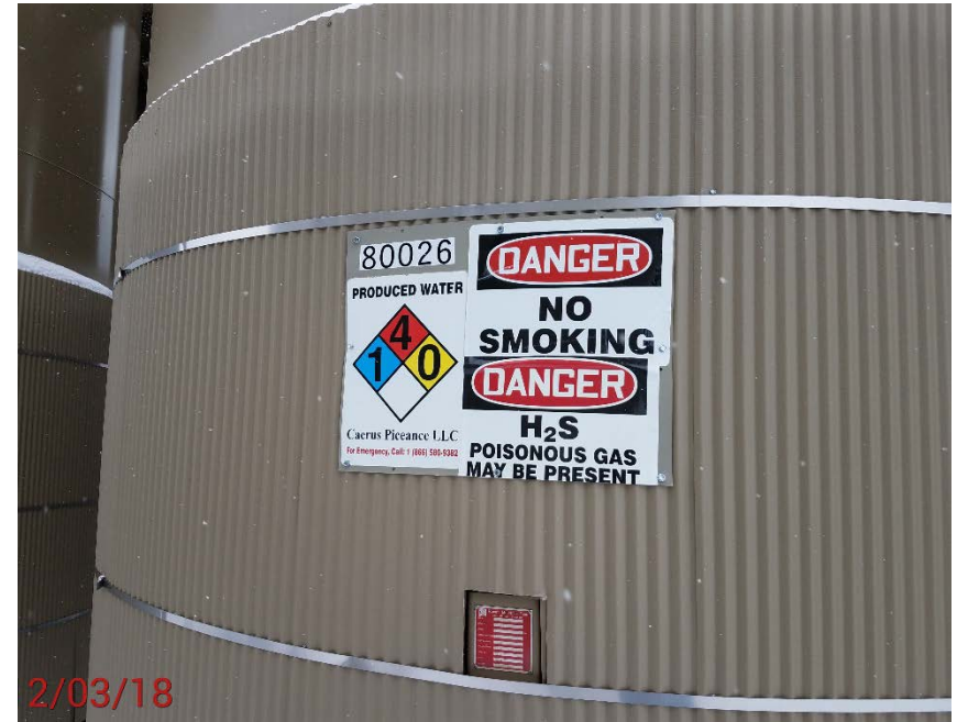
Location Photo #6, missing barrel capacity on all tanks within battery.