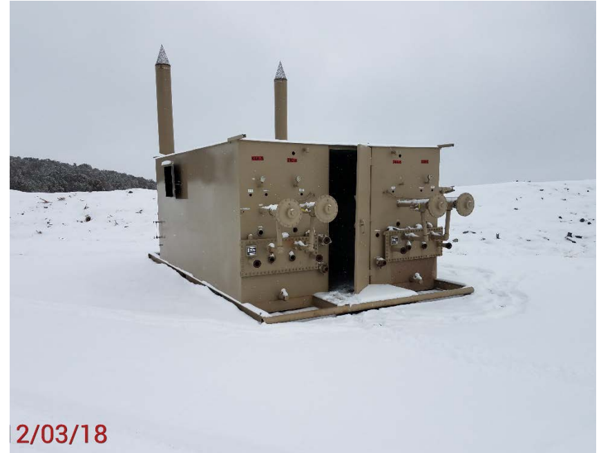
Location Photo #3