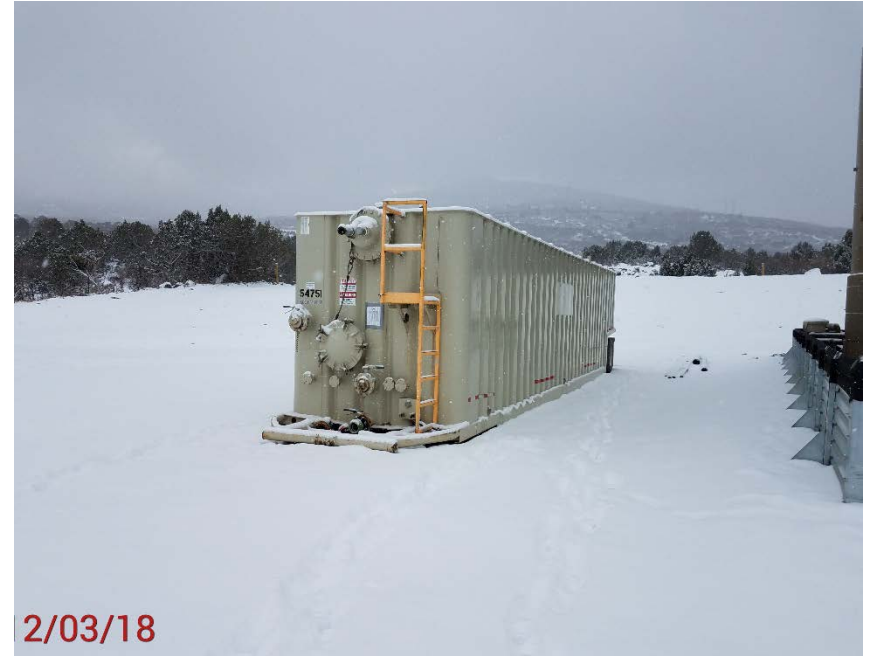
Location Photo #12, unmarked flow line.