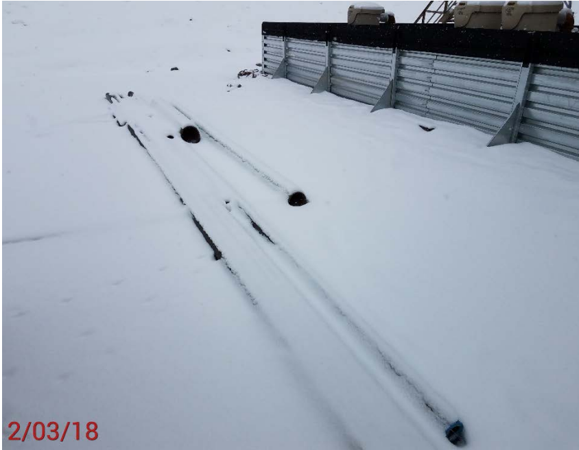
Location Photo #14, unused pipe on East side of battery containment.