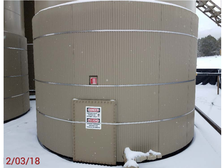
Location Photo #8, Missing information on 5 tanks in the battery.