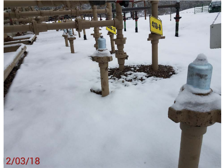
Location Photo #11, Unmarked flow lines