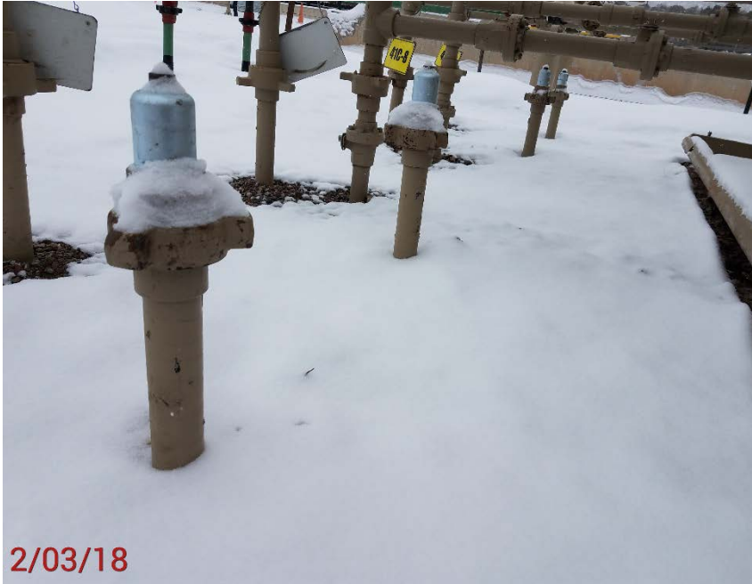
Location Photo #10, Unmarked flow lines