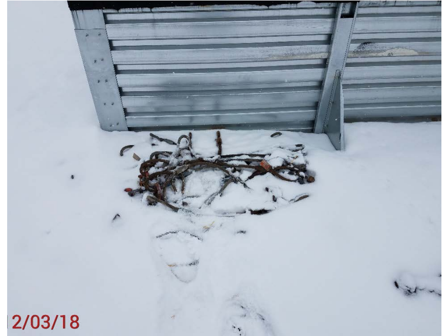
Location Photo #15, Cable restraints on East corner of battery containment.