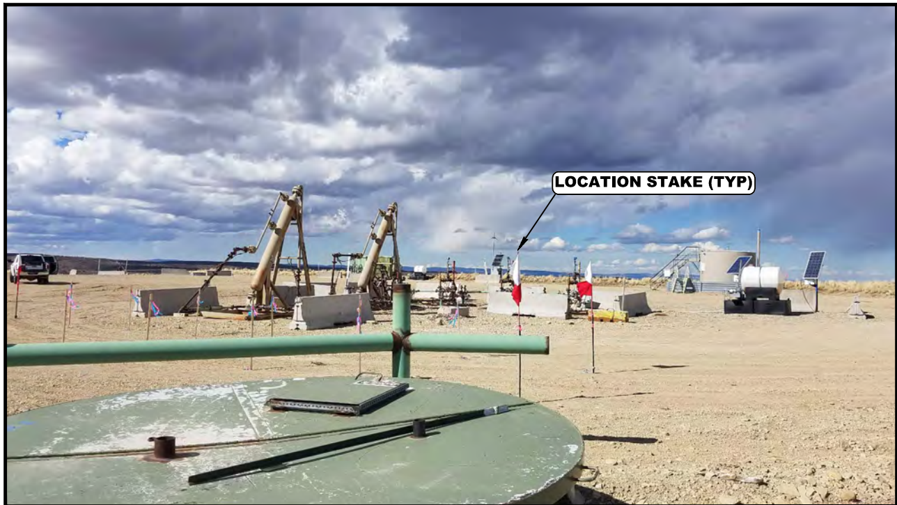
PHOTO: VIEW OF LOCATION STAKES