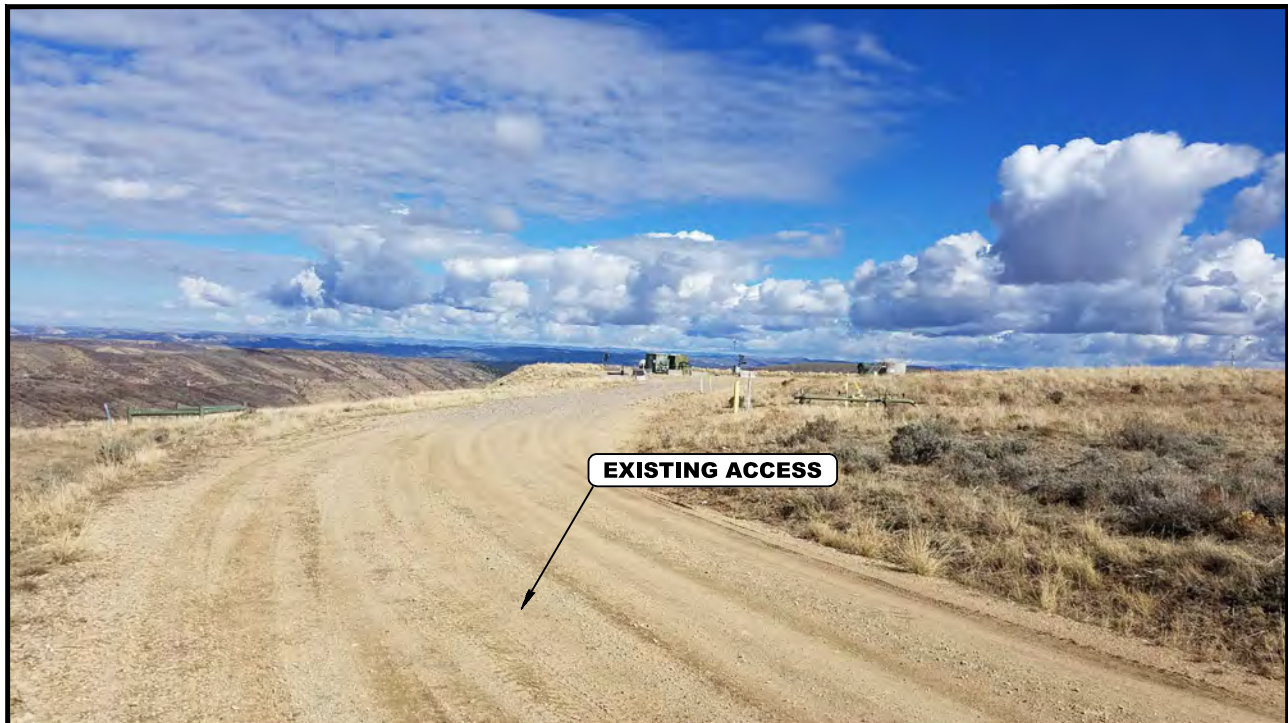
PHOTO: VIEW OF EXISTING ACCESS