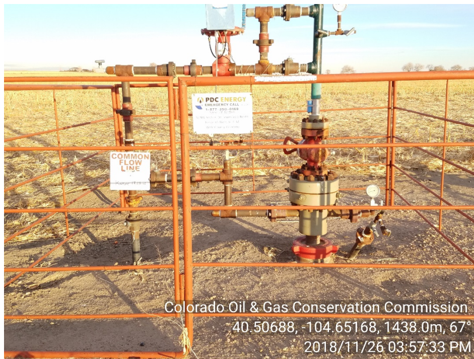
Photo #3 Kaiser 28-10 (05-123-36334) wellsite Shared Flowline (18-10, 28-10)