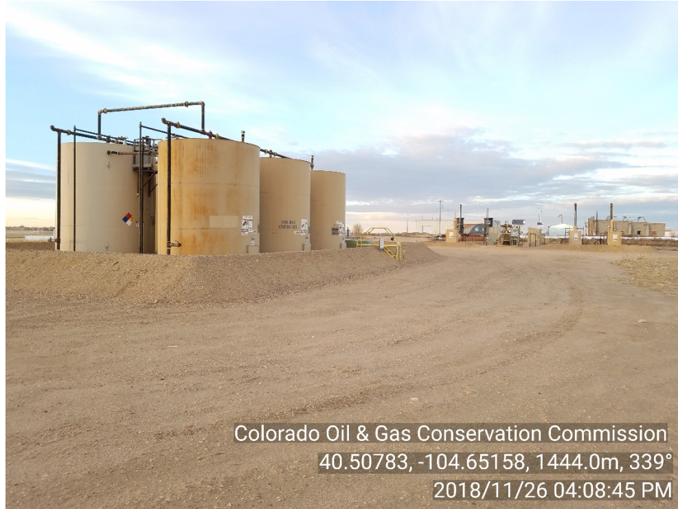
Photo #4 Tank Battery site – 7 wells Kaiser 2-10, 6-10, 7-10, 18-10, 25-10, 28-10, 921-10