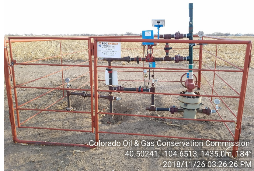
Photo #3 Kaiser 6-10 (05-123-32162) wellsite Shared Flowline (2-10, 6-10, 7-10)