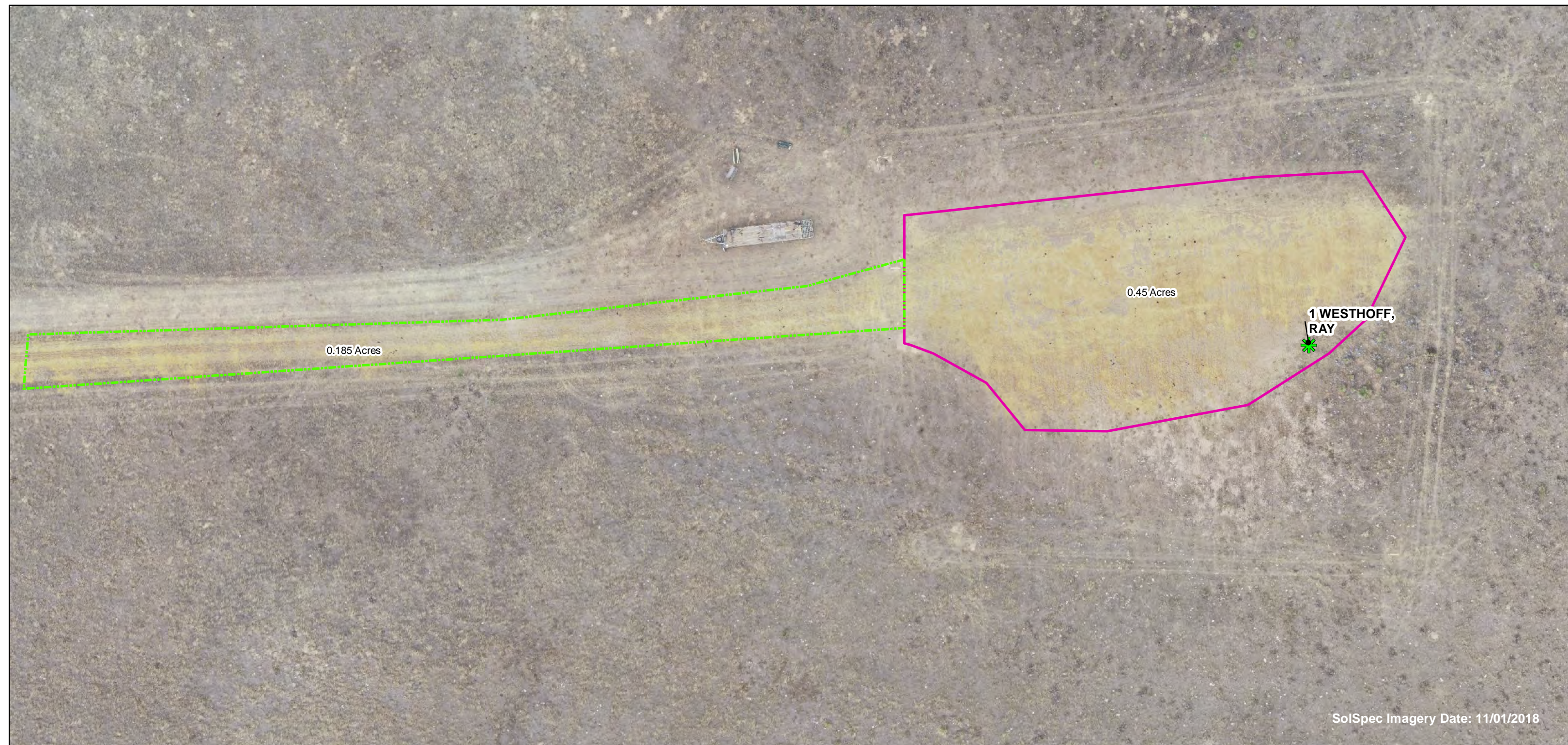
Exhibit 1 - Ray Westhoff #1